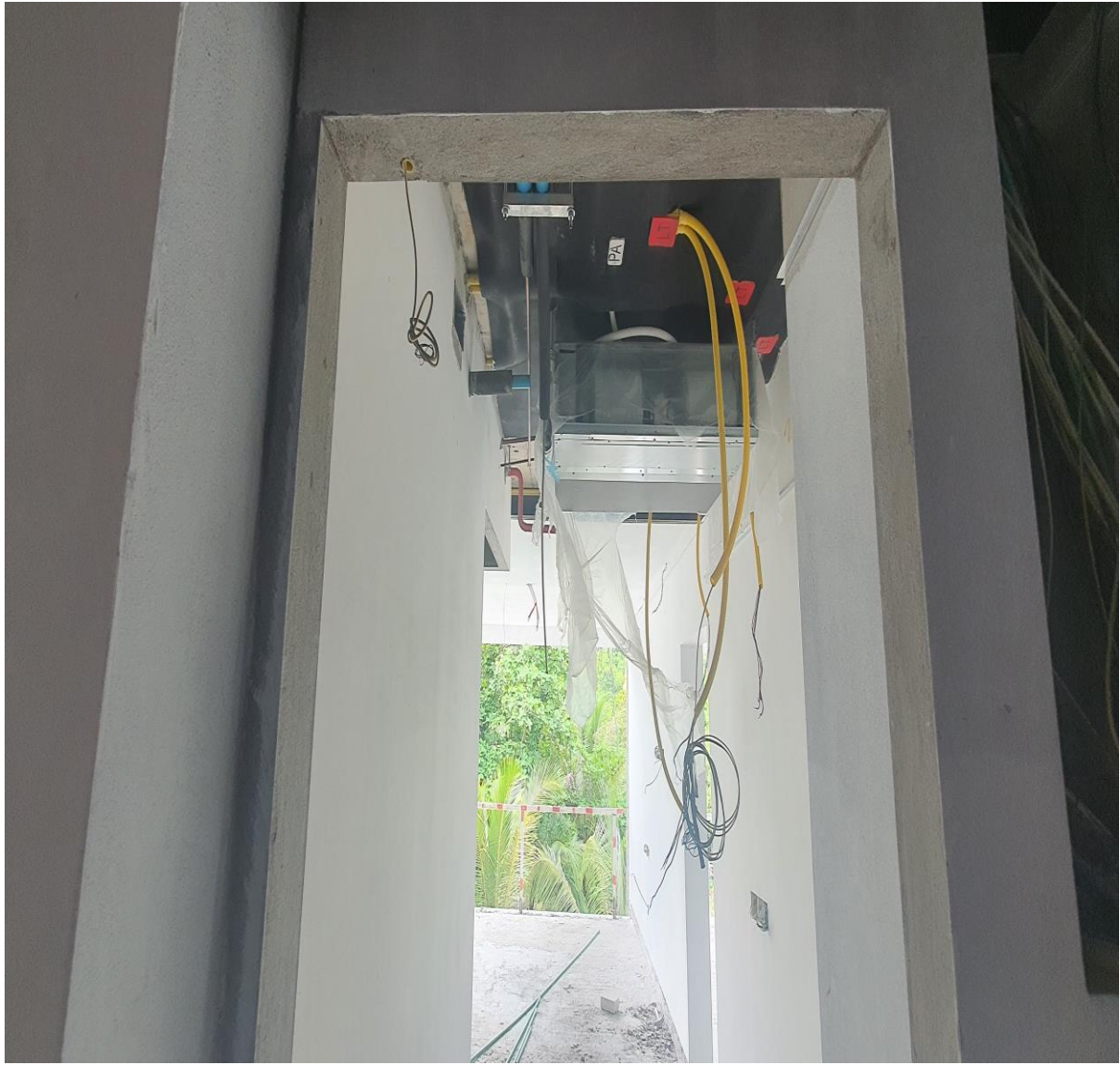
1 st Floor Building 3