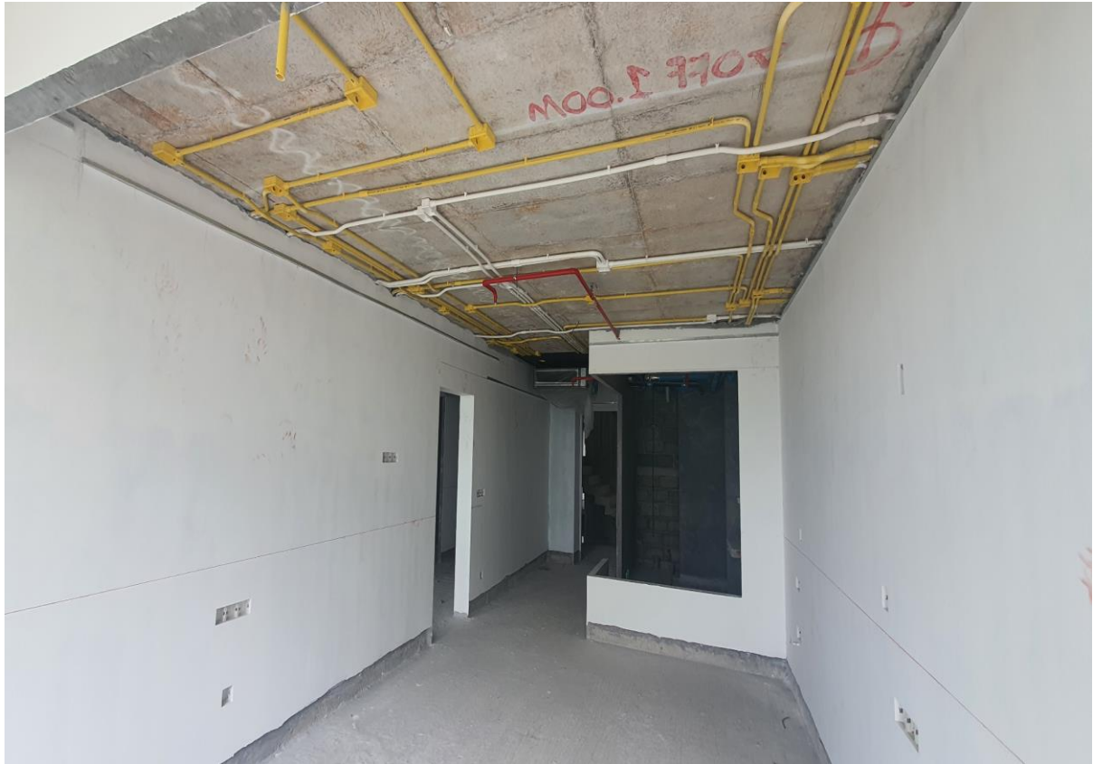
Inside 3 rd floor sea view rooms