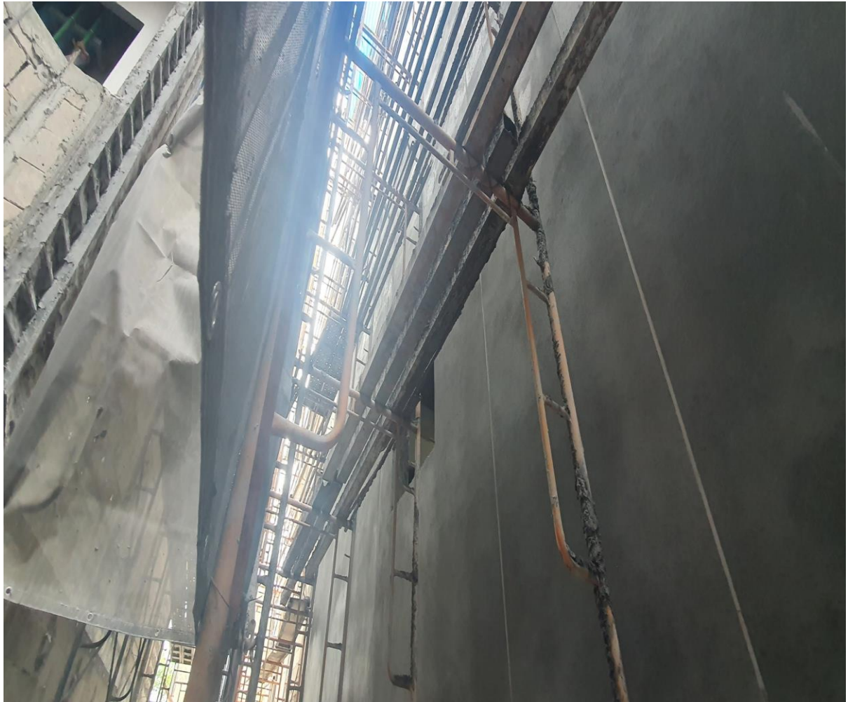
Exterior rendering Building 2 between 1 & 2