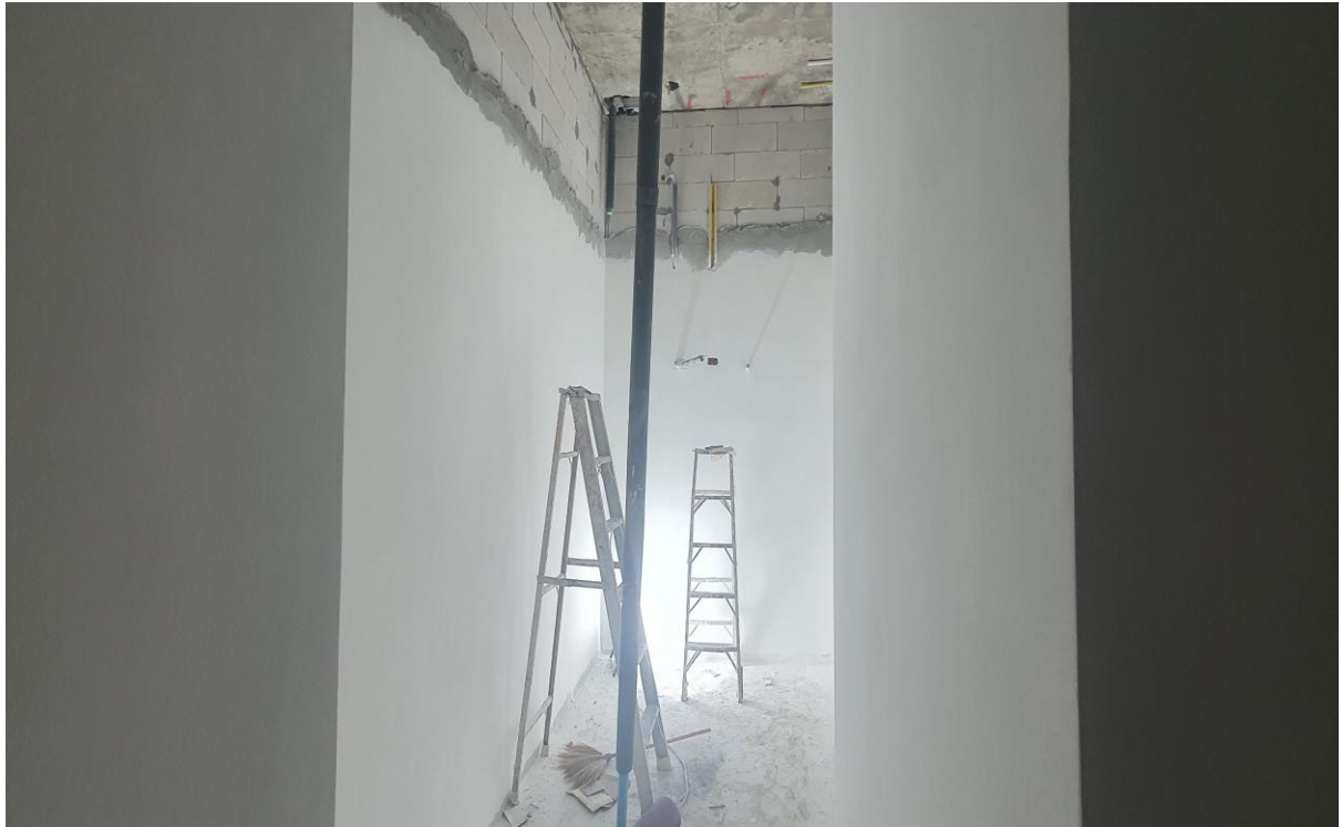
IT office rendering