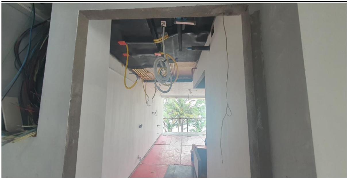
Inside Rooms 2 nd Floor Building 3