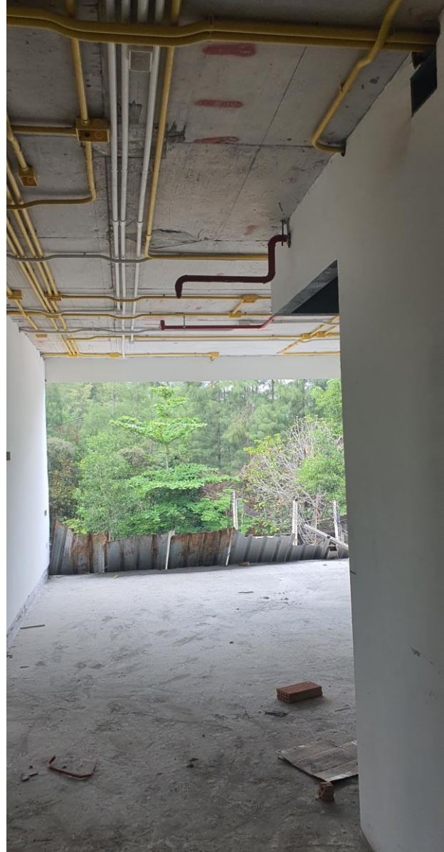
Building 6 1 st Floor Corridor and Garden View Rooms