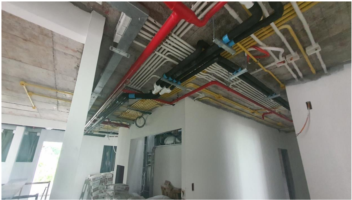
Corridor Building 3

Radisson Phuket Mai Khao Beach Construction Progress Report