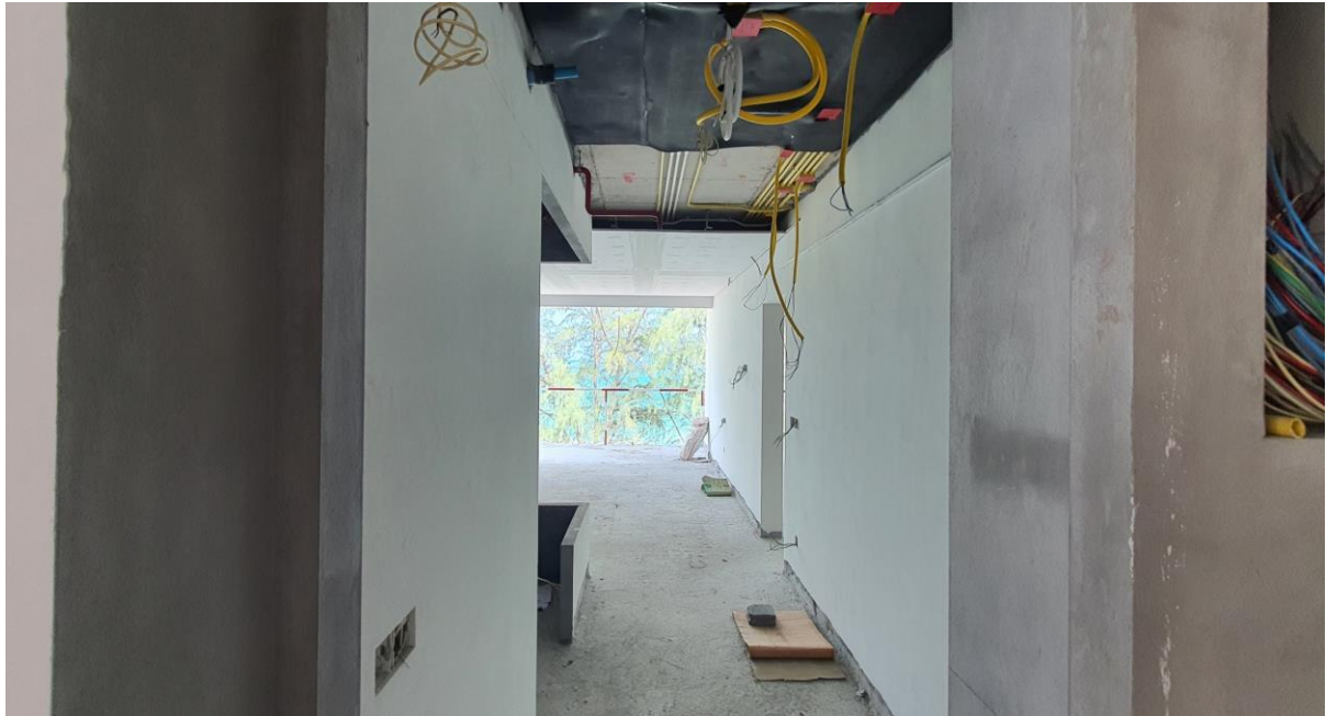
2 nd Floor Building 4