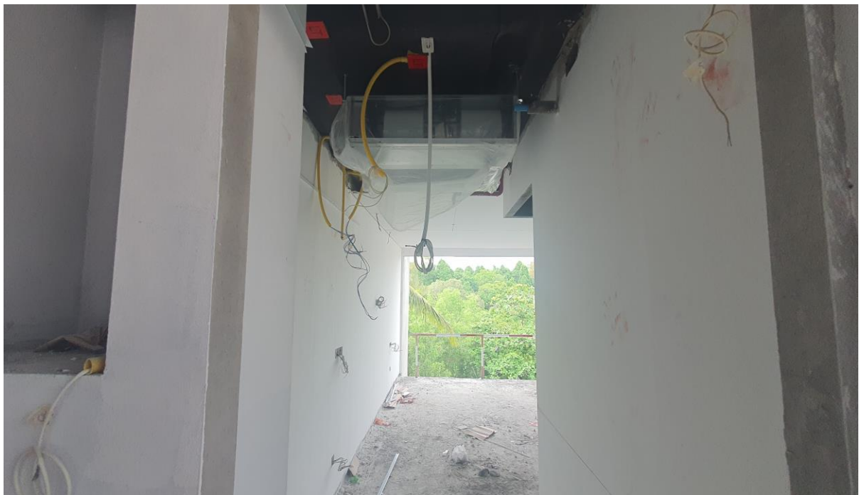
Inside Garden View Room Building 2 3 rd floor

Radisson Phuket Mai Khao Beach Construction Progress Report