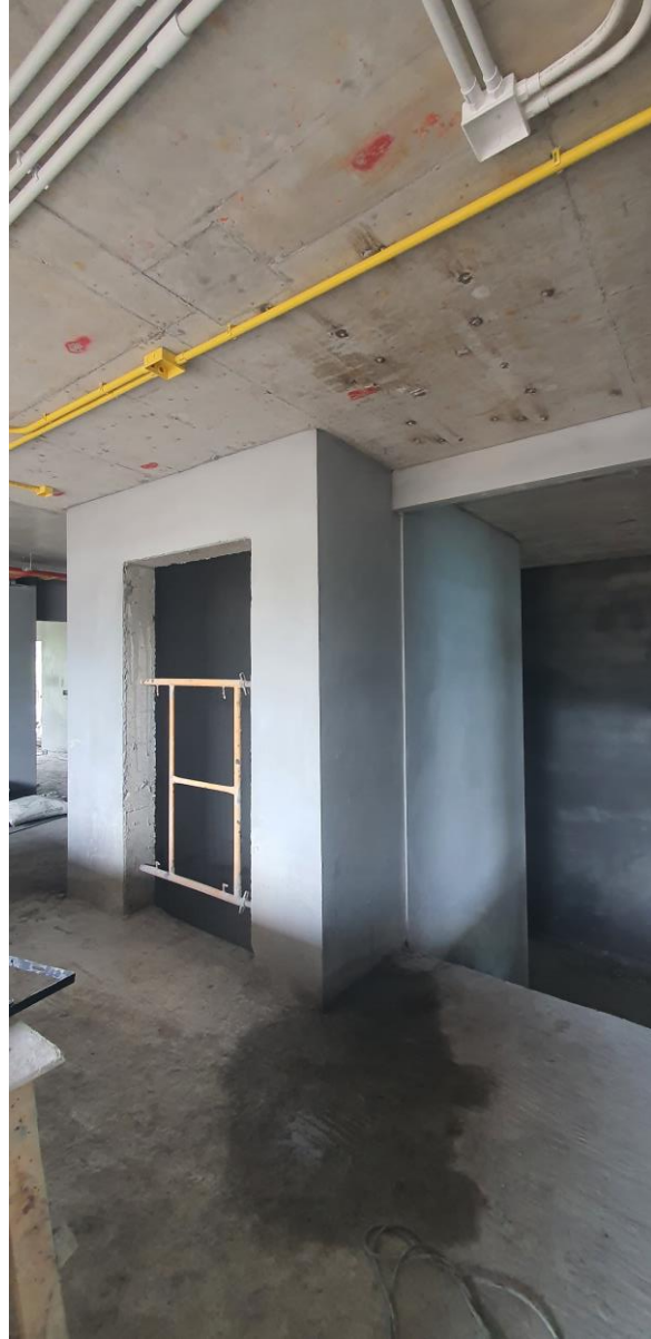
Fire Stair Building 6 & Main Lift Shaft passenger Lift 3 rd Floor 6