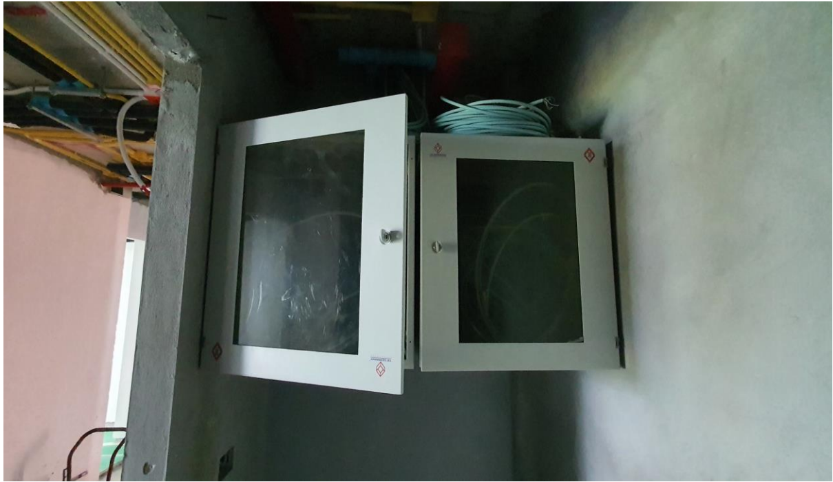
Guestroom floors Network Racks Building 8