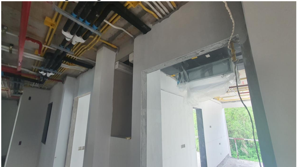
Corridor & Rooms Building 2 1 st Floor Garden view side

Radisson Phuket Mai Khao Beach Construction Progress Report