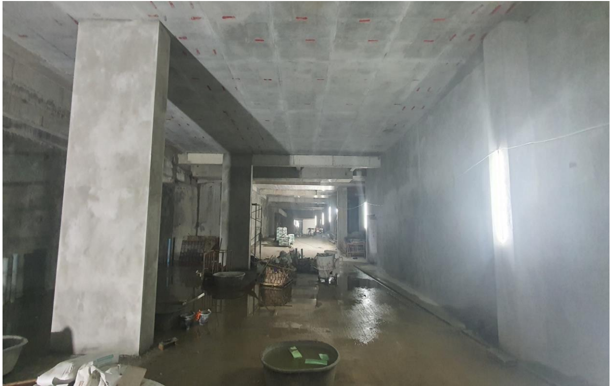
Basement Rendering looking towards Building 5,4 3,2 1 from Building 6