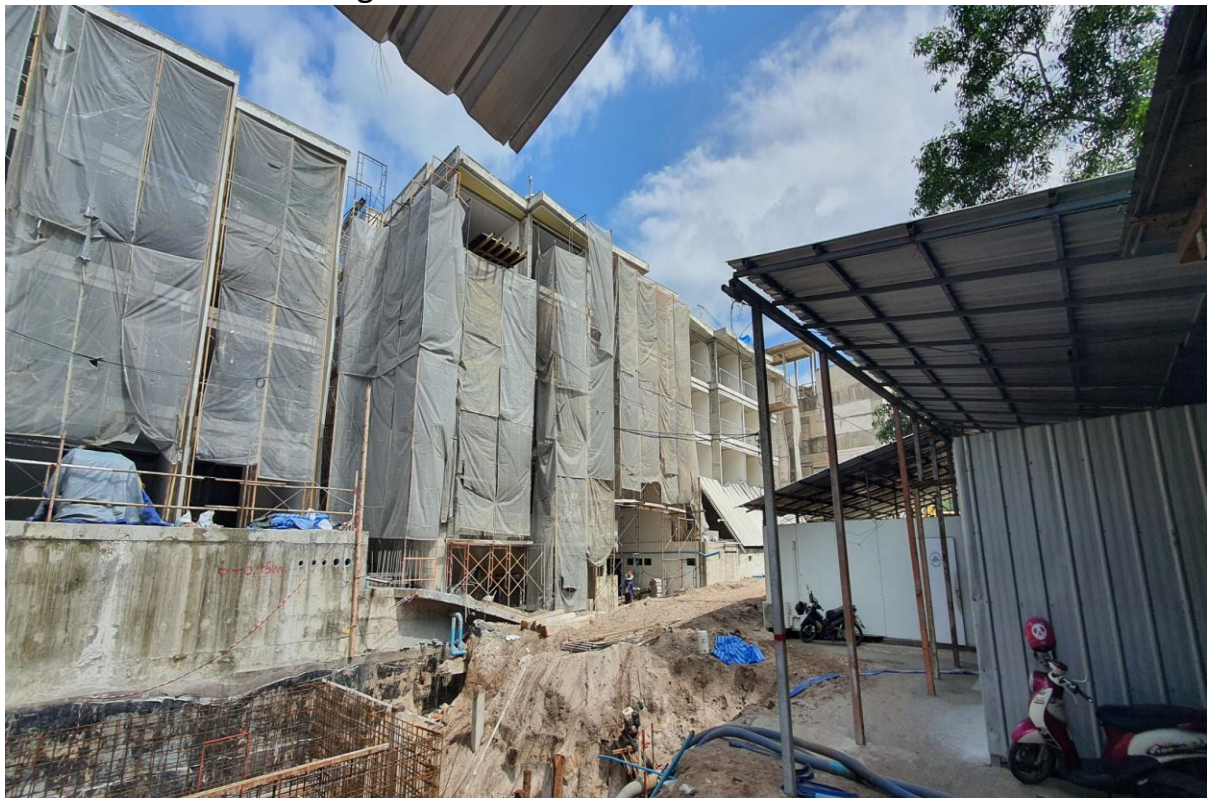
Rear 6,7 8