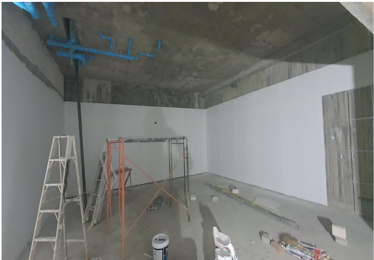
Rendering Housekeeping stores