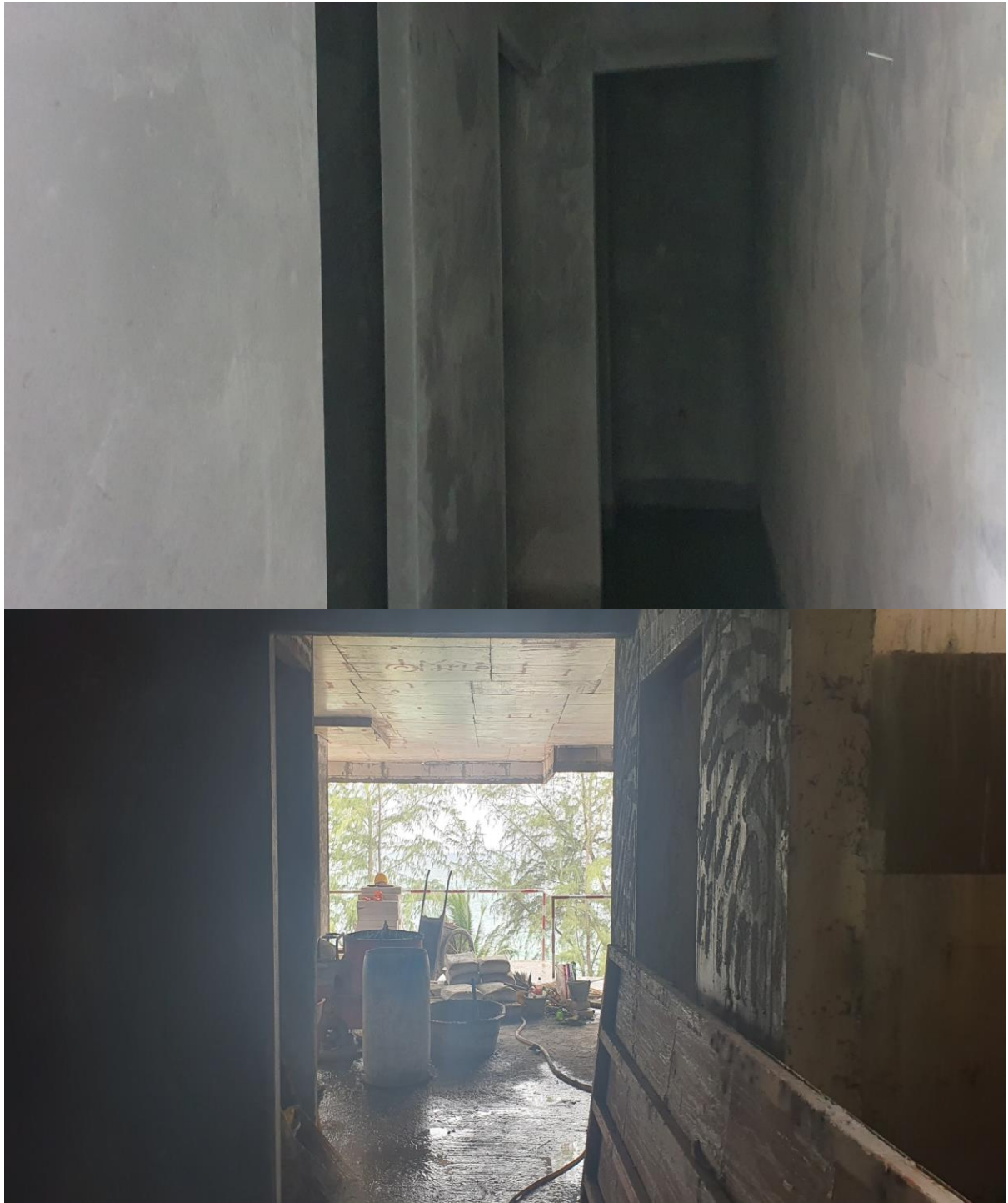
Rendering entrance Area Gym