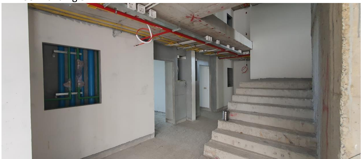
Building 4 rendering & corridor conduit and raceway

Radisson Phuket Mai Khao Beach Construction Progress Report