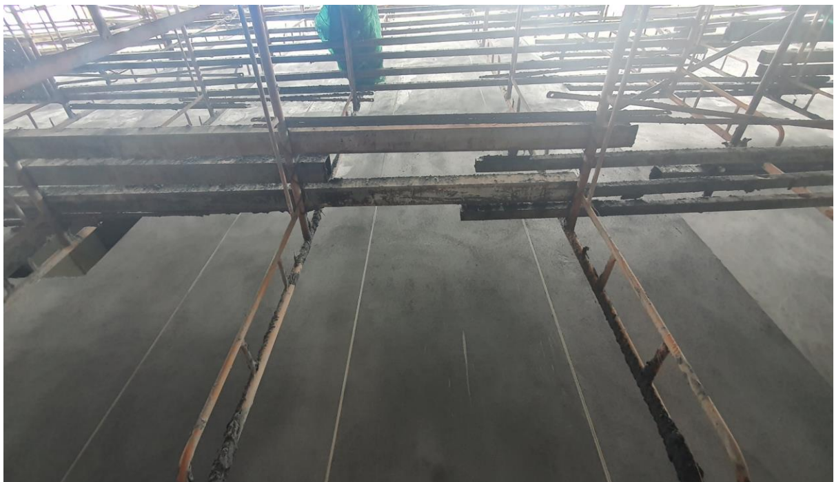
Exterior rendering Building 2 on the side next to 1