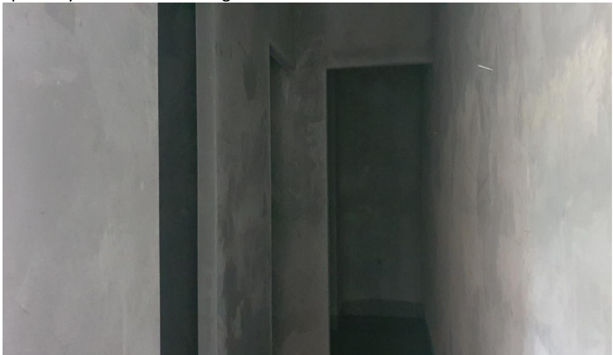
Rendering Inside Restrooms Building 5 1 st Floor