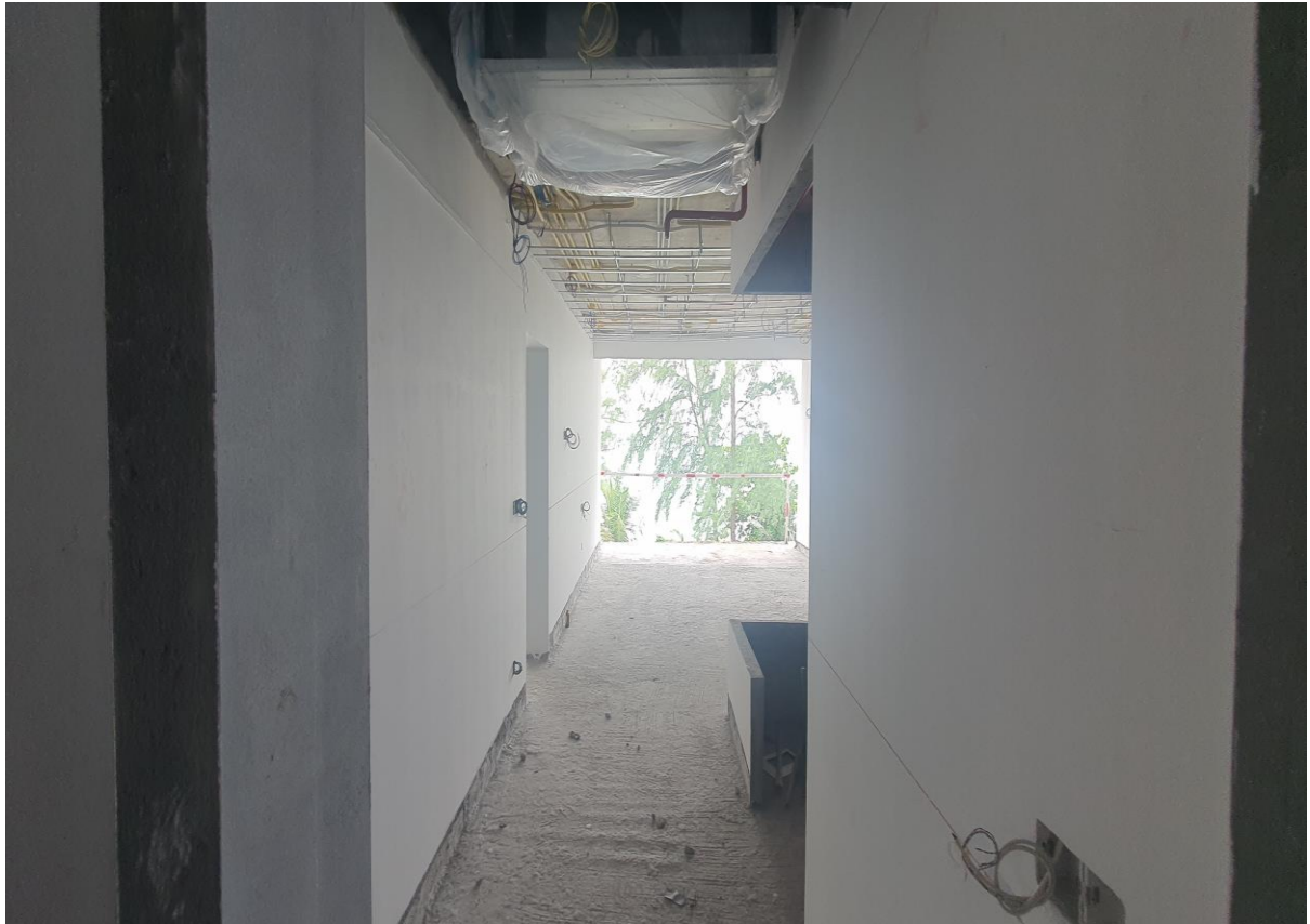
Inside rooms 2 nd Floor Building 2