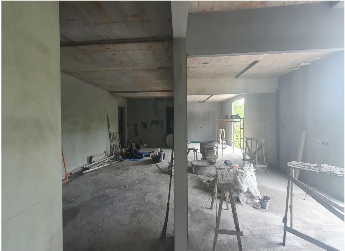
Meeting room & Breakout Building 5