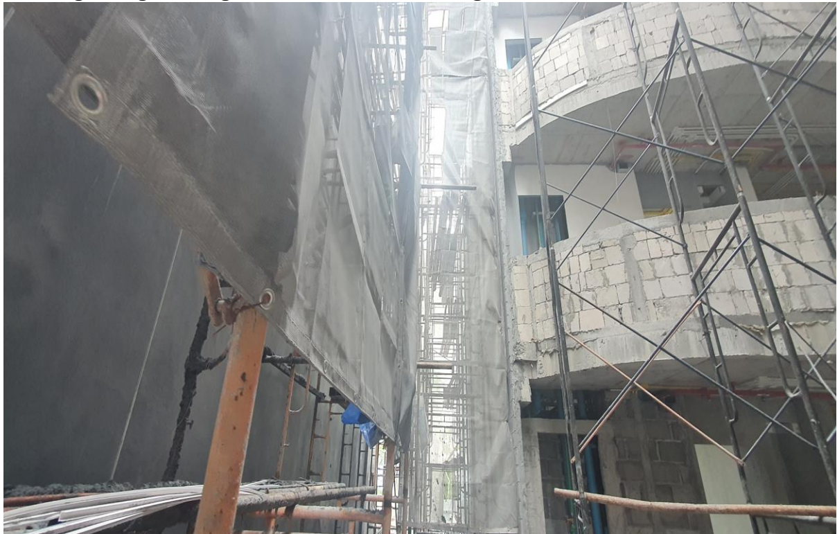
Between Building 2 and 1

Radisson Phuket Mai Khao Beach Construction Progress Report