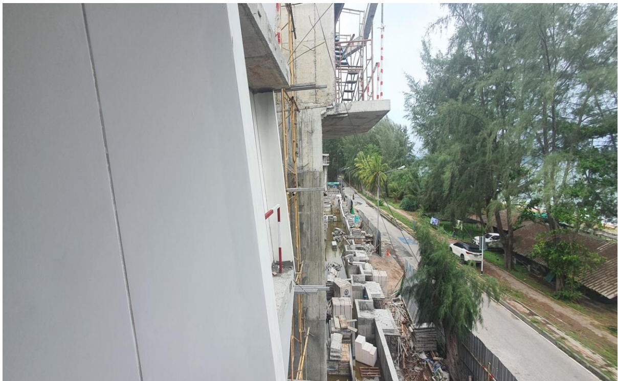
View Frontage 2 nd Floor Building 2

Radisson Phuket Mai Khao Beach Construction Progress Report