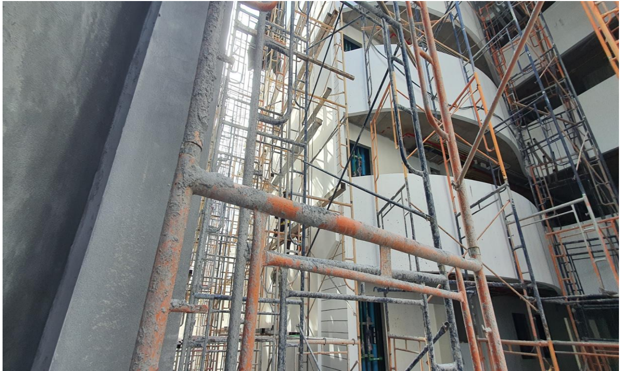
Building 3 from corner Building 4