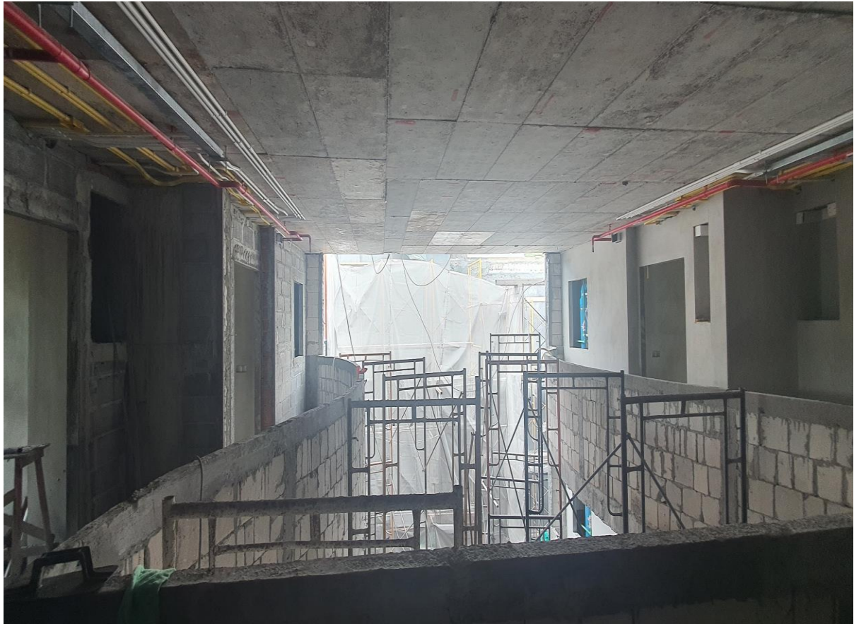
3 rd Floor Building 1 look towards building 2