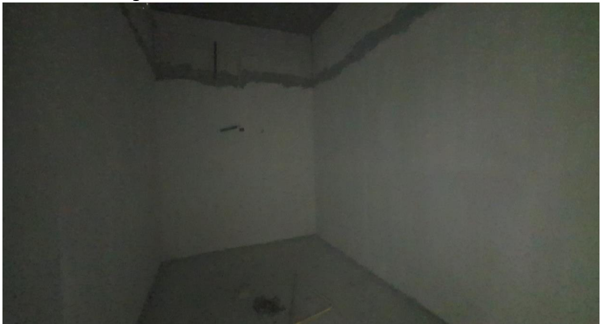
Plastering Server Room