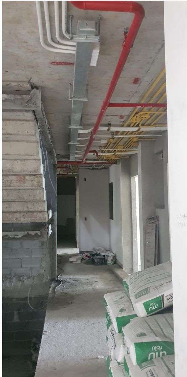
Building 6 Corridor and Between Building 5 & 6