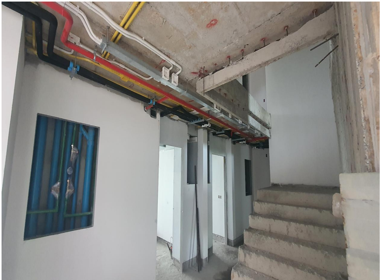
Building 2 2 nd Floor