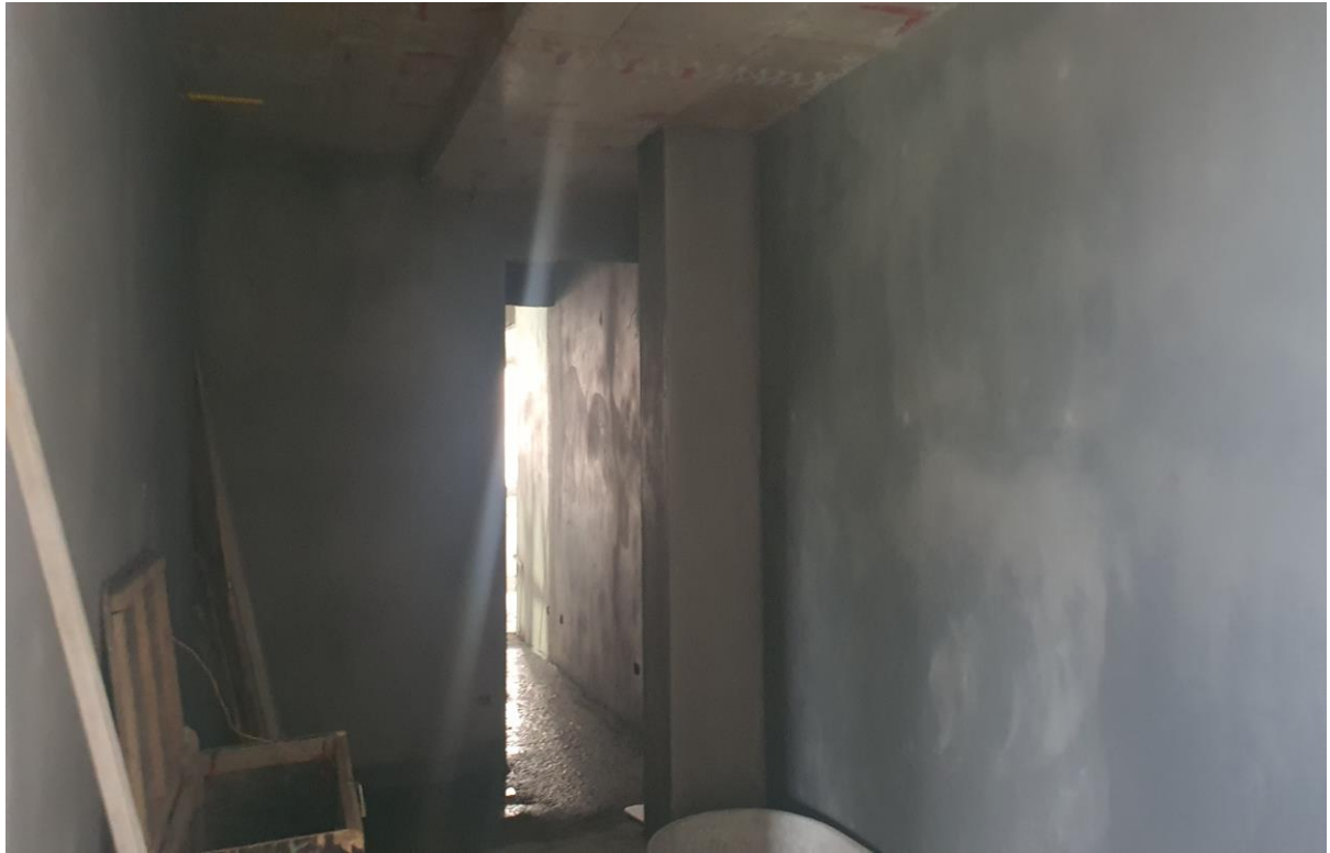
Rendering Spa Office & Spa Reception