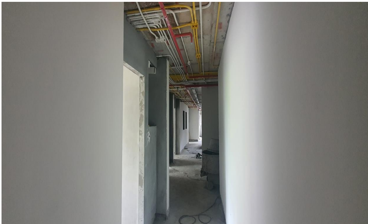
Corridor Building 1