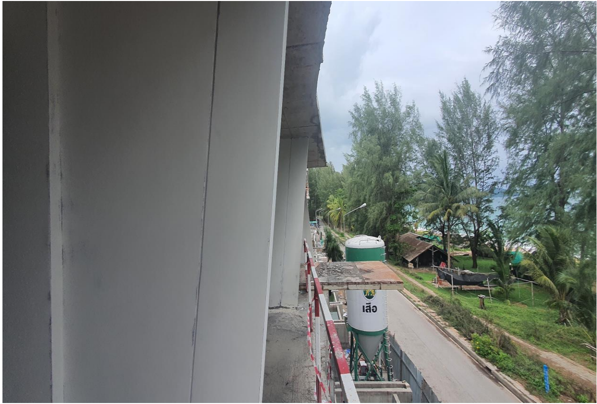
Looking along frontage from 1 st Floor Building 1