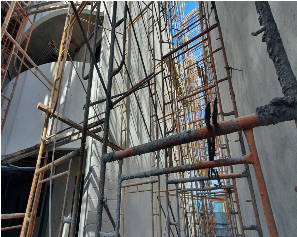
External rendering Building 8 and 7