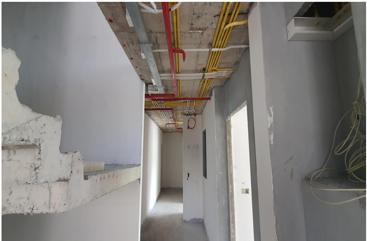
Corridor Building 4

Radisson Phuket Mai Khao Beach Construction Progress Report