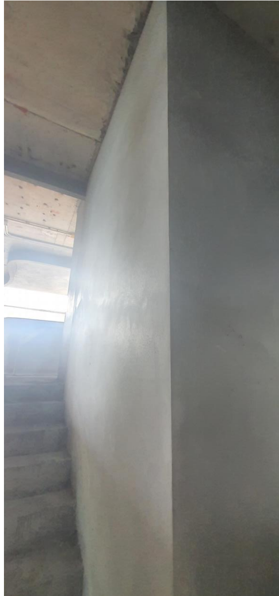
2 nd Floor Building 6