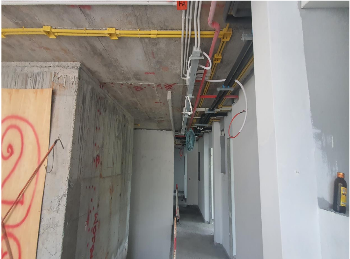
3 rd Floor Building 2