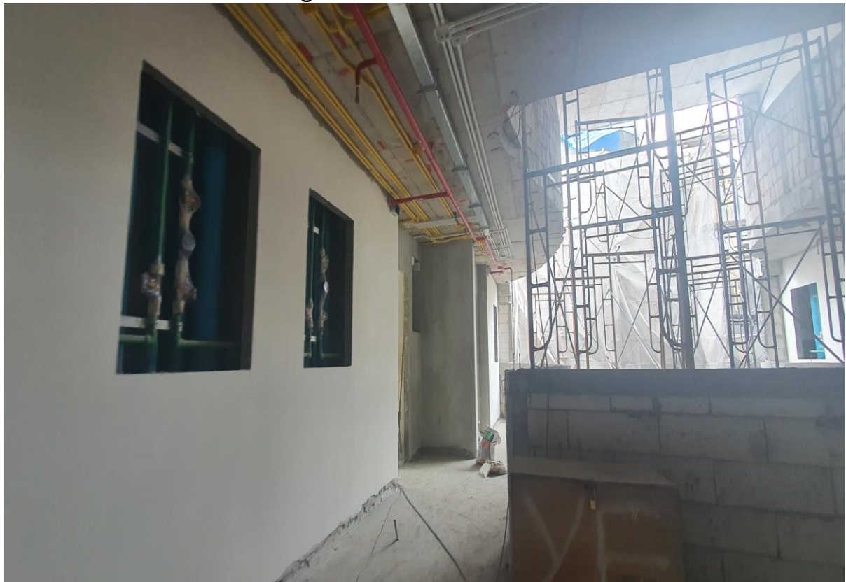
Corridor 2 nd Floor Building 1