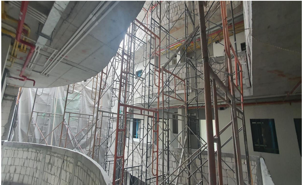
Landing 1 st Floor Building 1