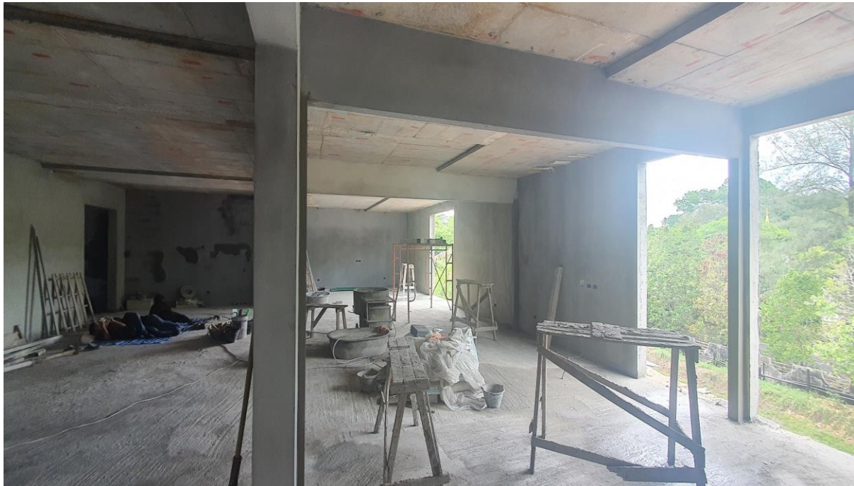
Rendering walls Meeting Rooms Building 5