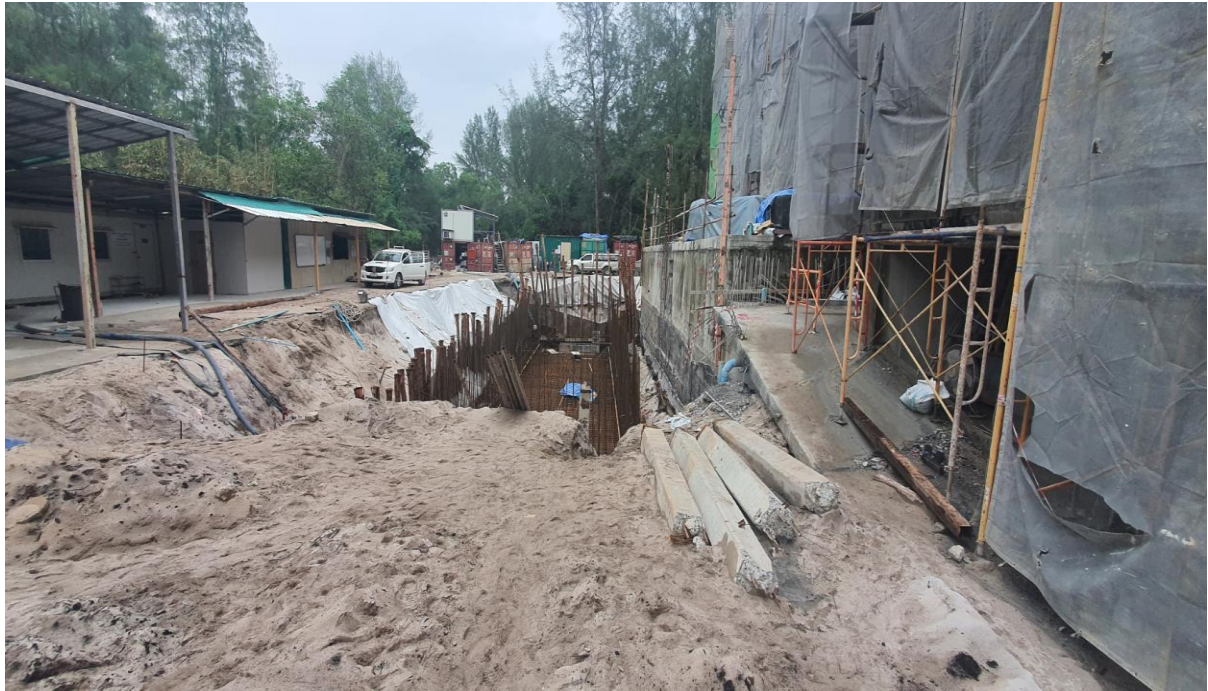
Retention tanks rear Building 8