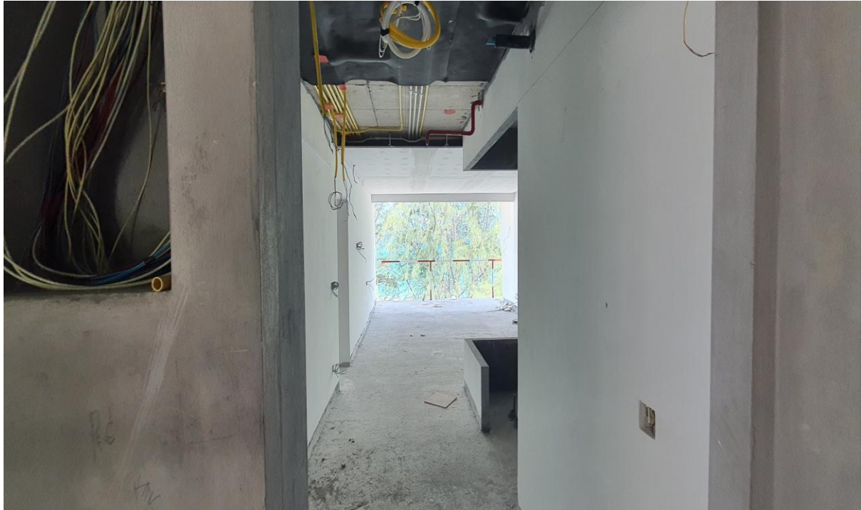
1 st Floor Building 4