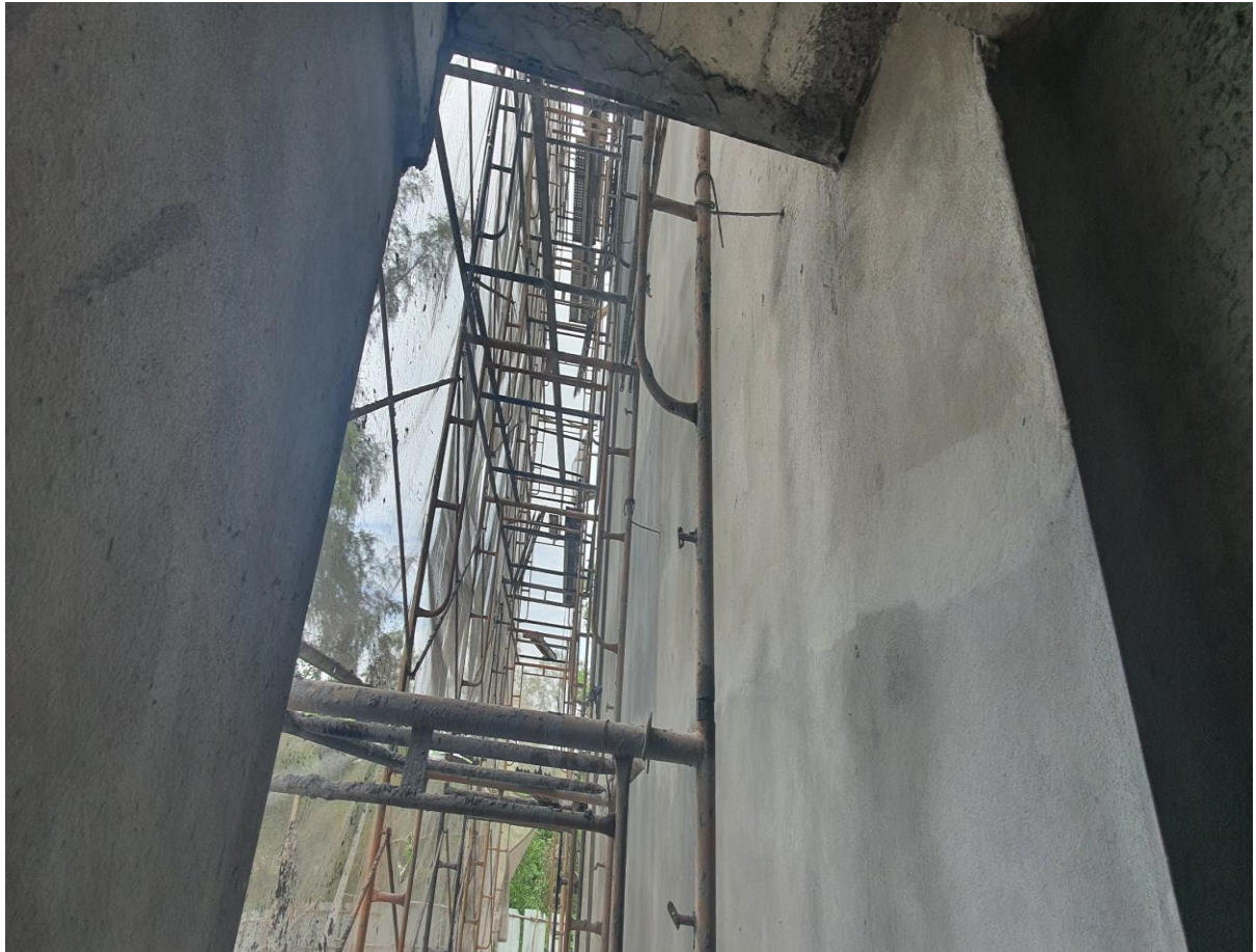
External Rendering extreme end of Building 1