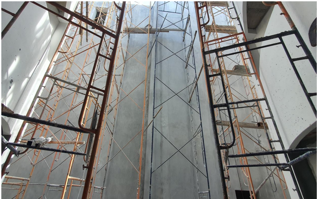
Render exterior Building 8