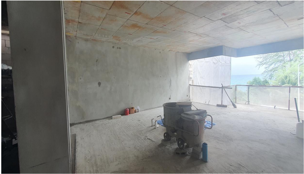
Speciality Restaurant Building 5