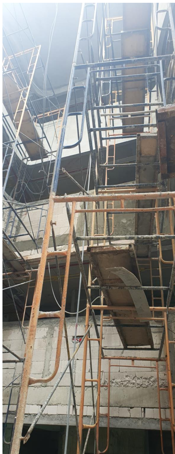
Building 6 Corridor & Rooms, plastering and Conduit works