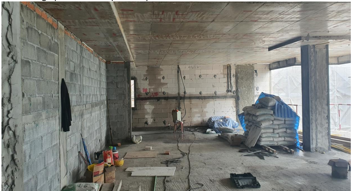
Preparing for render inside GYM