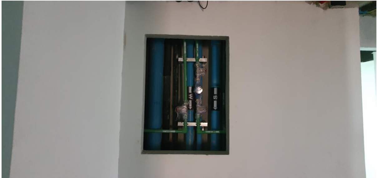
Shaft wet service building 8