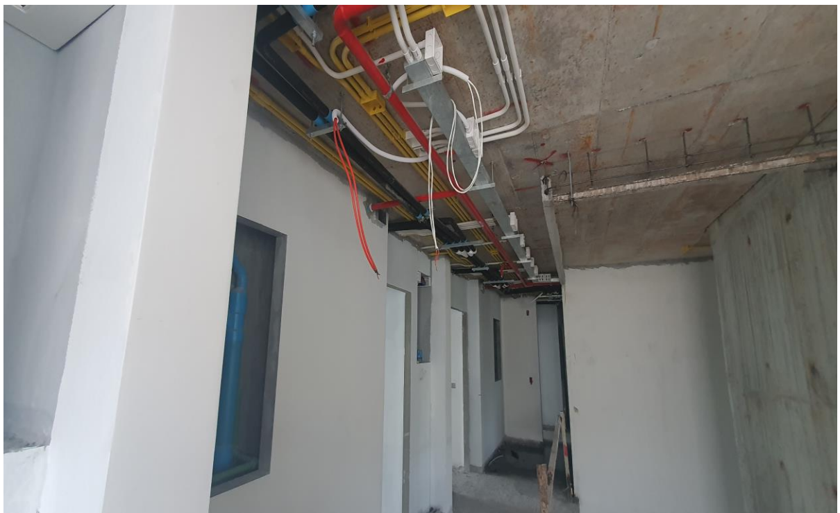
Corridors Building 2