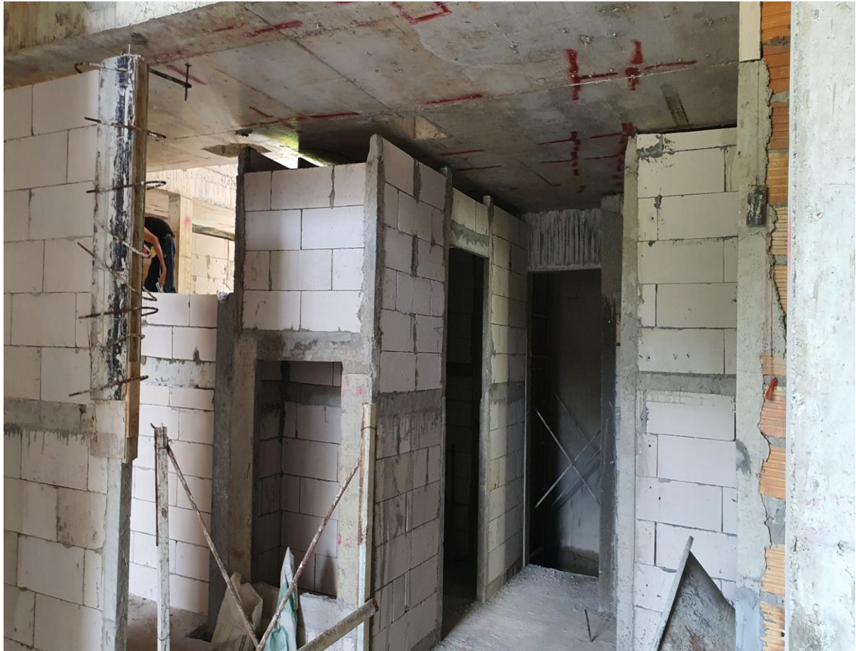
Blockwork Corridor 2 nd Floor Building 7 – Maid pantry/EE Cupboard and FIRE HOSE cabinet areas – service elevator shaft in background