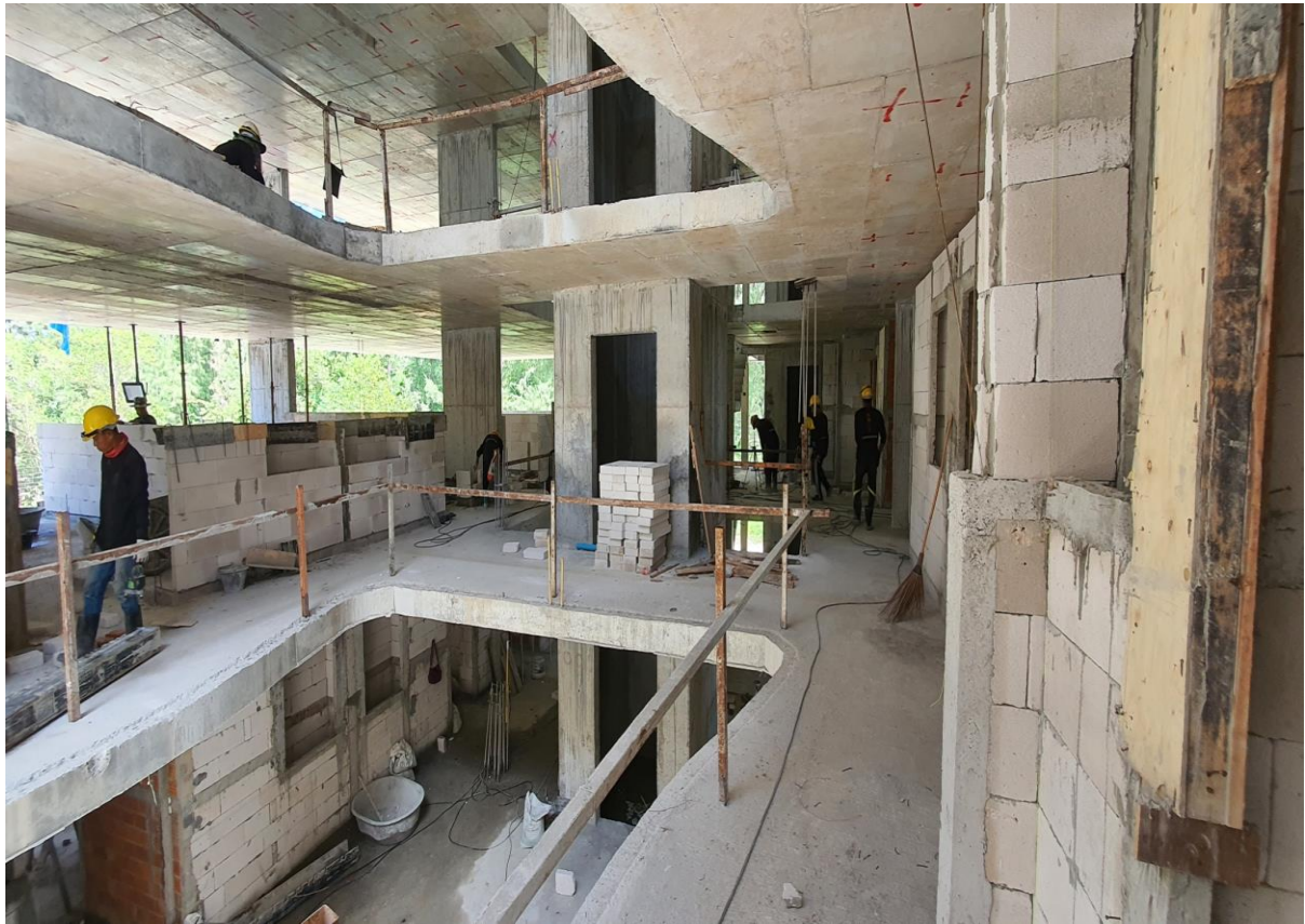
1 st and 2 nd floor blockworks Building 8 view from outside 8101, looking over to 8106/7/8- ground floor units 8007 & 8008 are also visible