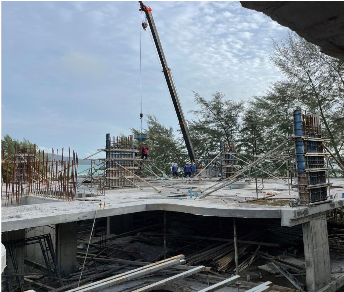
Columns Building 3 3 rd floor to Roof Level

Radisson Phuket Mai Khao Beach Construction Progress Report