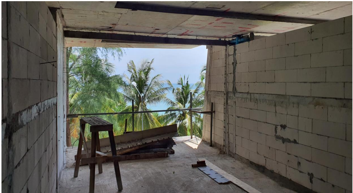
Blockwork unit 7203 Building 7 2 nd floor