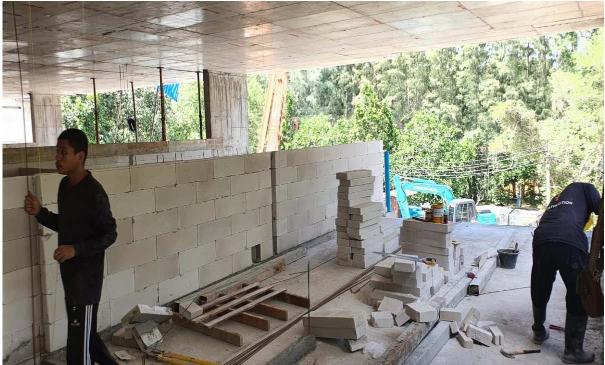
Blockwork in 8210 2 nd floor building 8