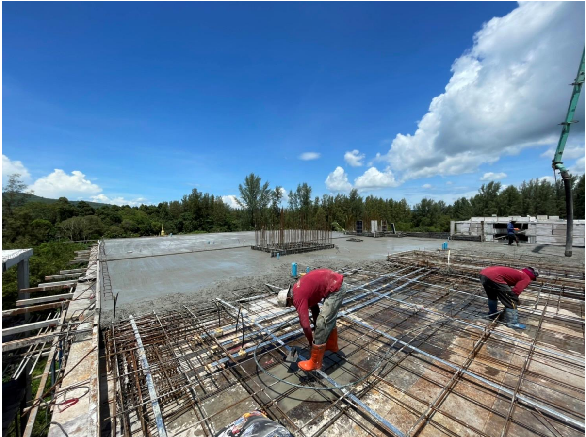
Building 3 Roof Slab pouring