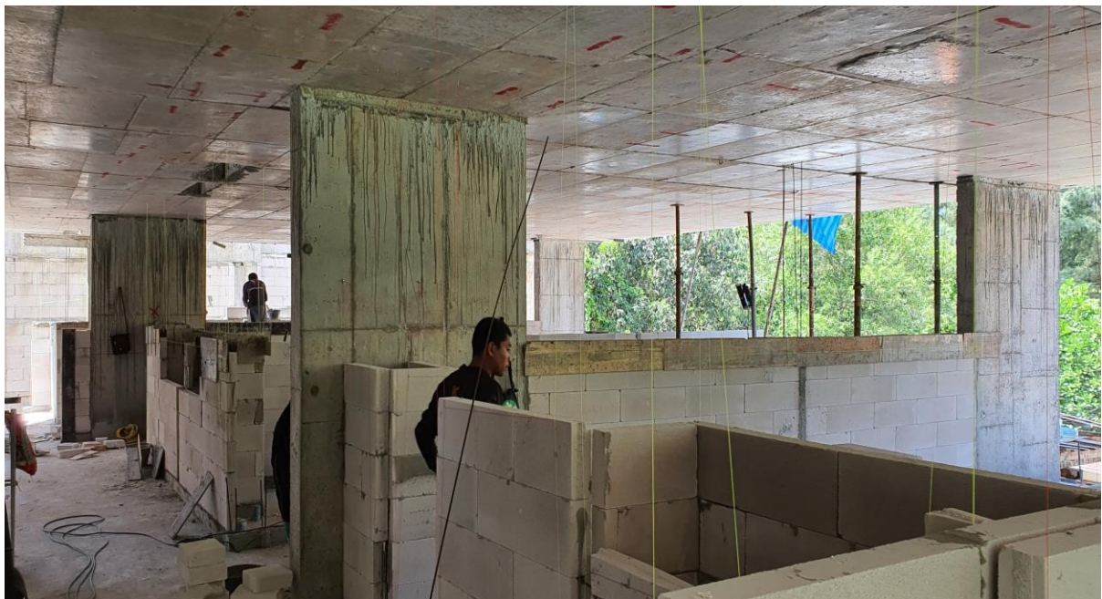
Blockwork in progress 2 nd floor Building 8 units 8208, 8207 and 8206

Radisson Phuket Mai Khao Beach Construction Progress Report