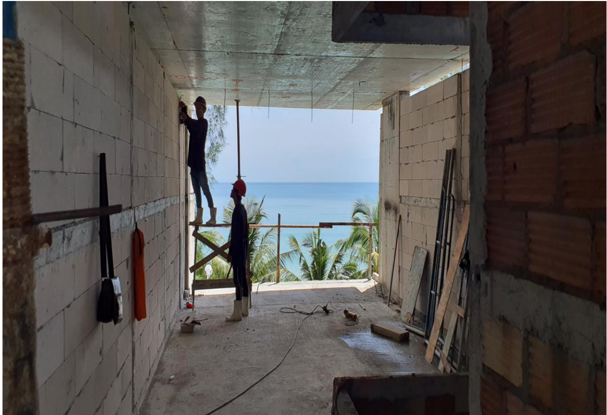
Blockwork inside 7301 3 rd floor Building 7