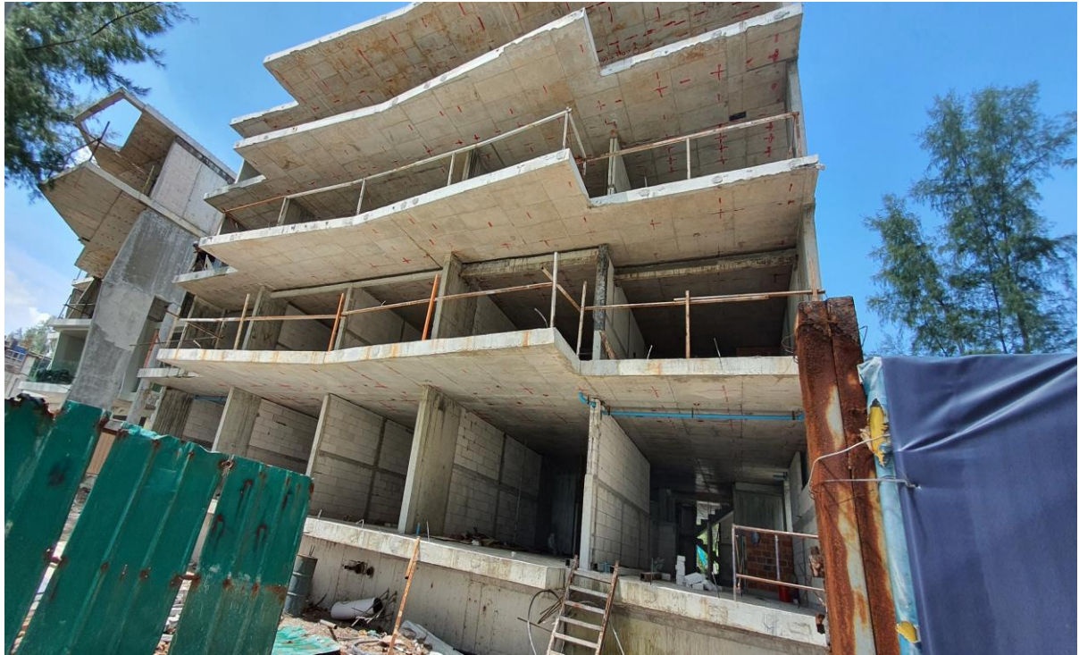
Building 8 Blockwork in progress – blockwork is ongoing in G /1 & 2 levels – rooms 8003/8004 and 8005 are visible on the ground floor