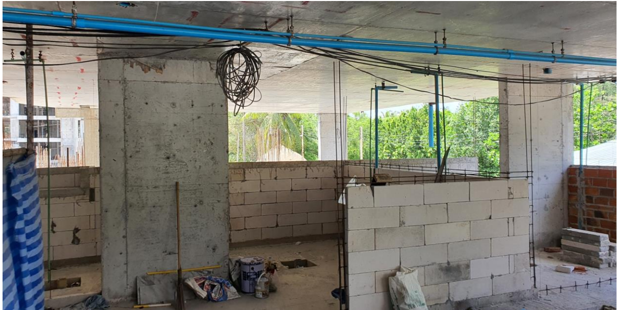
Ground floor Building 7 Main Kitchen inside ALL Day Dining zone