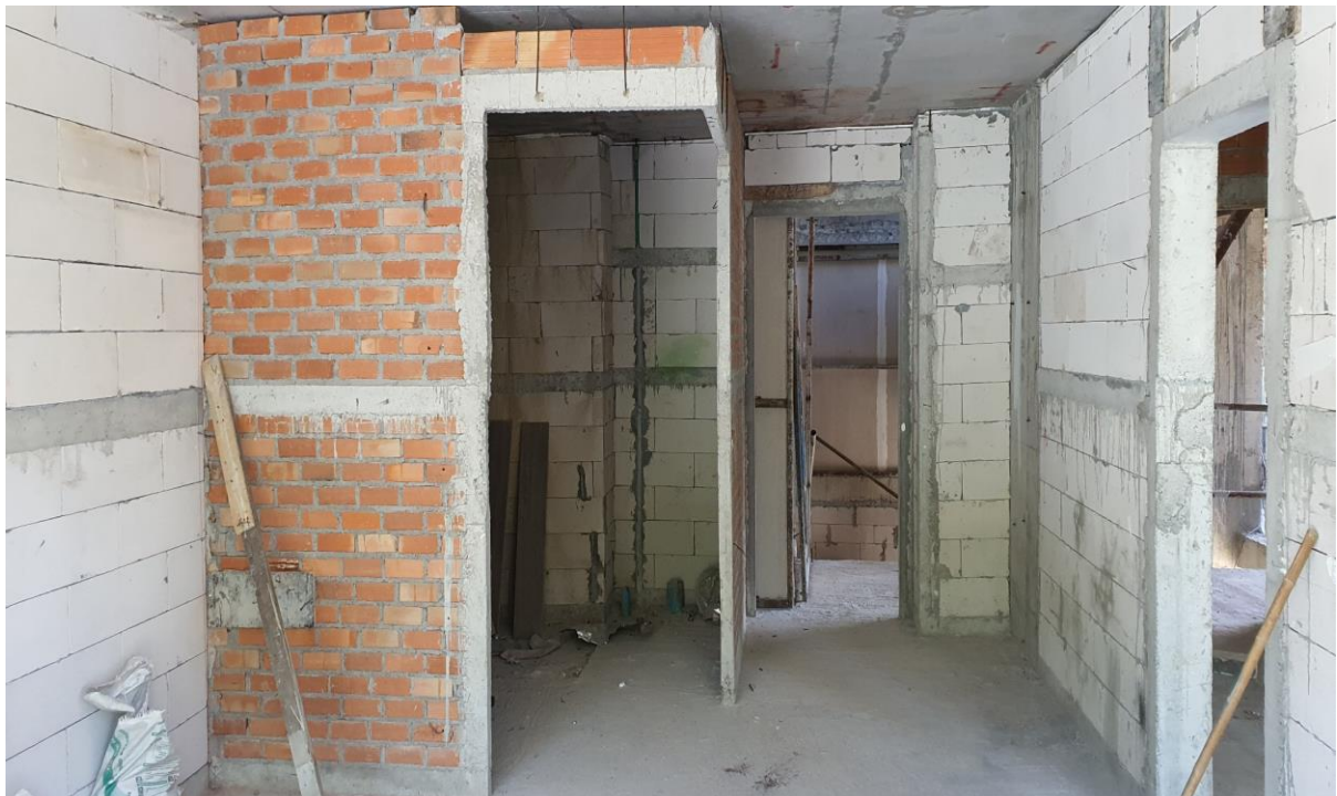
Blockwork 1 st floor Building 7 garden view unit looking back toward corridor room 7107