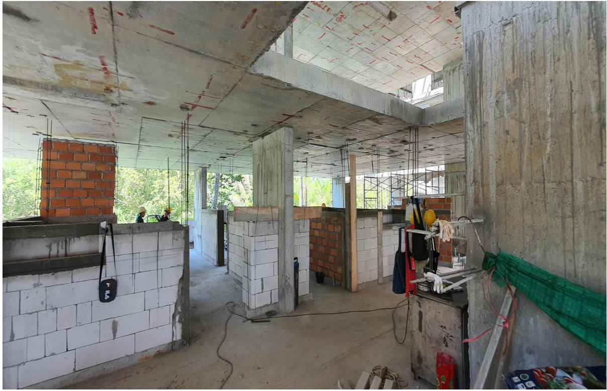
Building 2 Ground Floor Garden view units blockwork commenced view of units 2106 and 2107