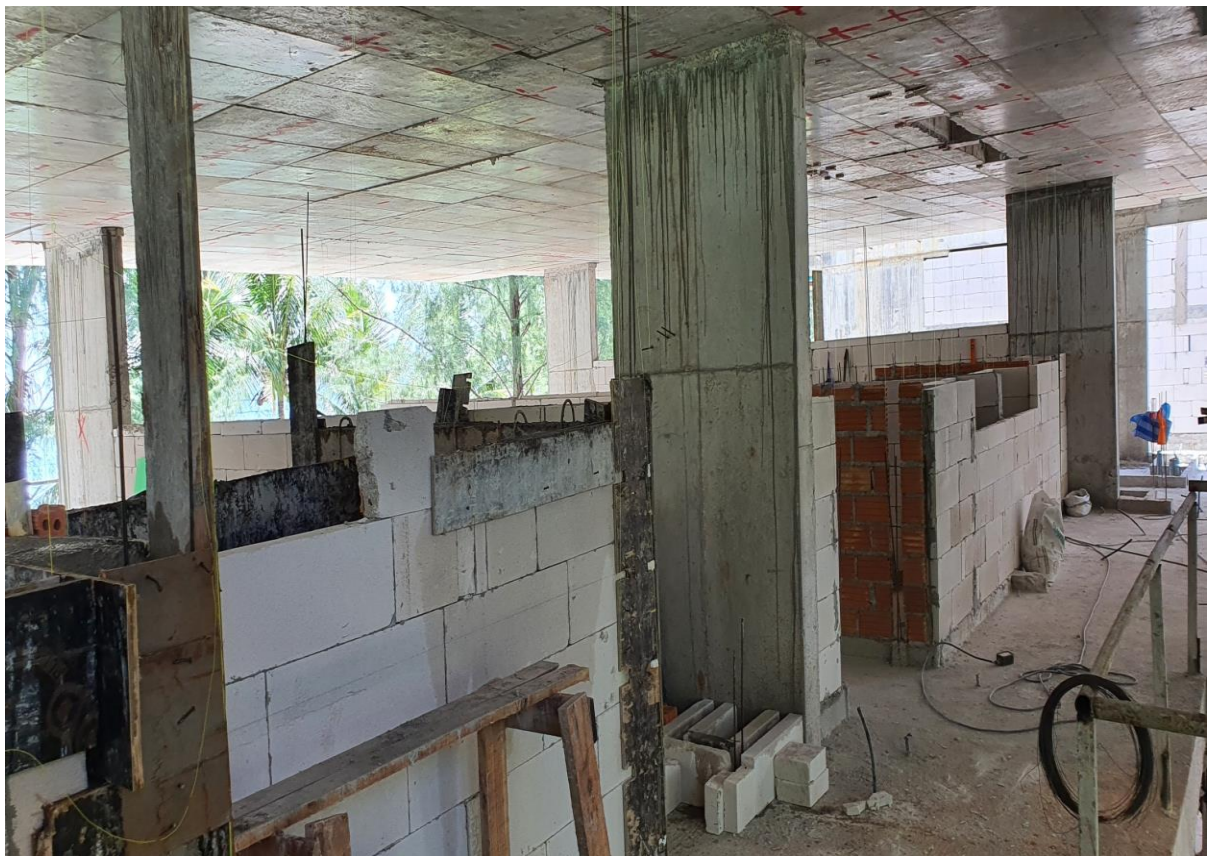
2 nd floor Building 8 Units 8204 8203 and 8202 visible

Radisson Phuket Mai Khao Beach Construction Progress Report