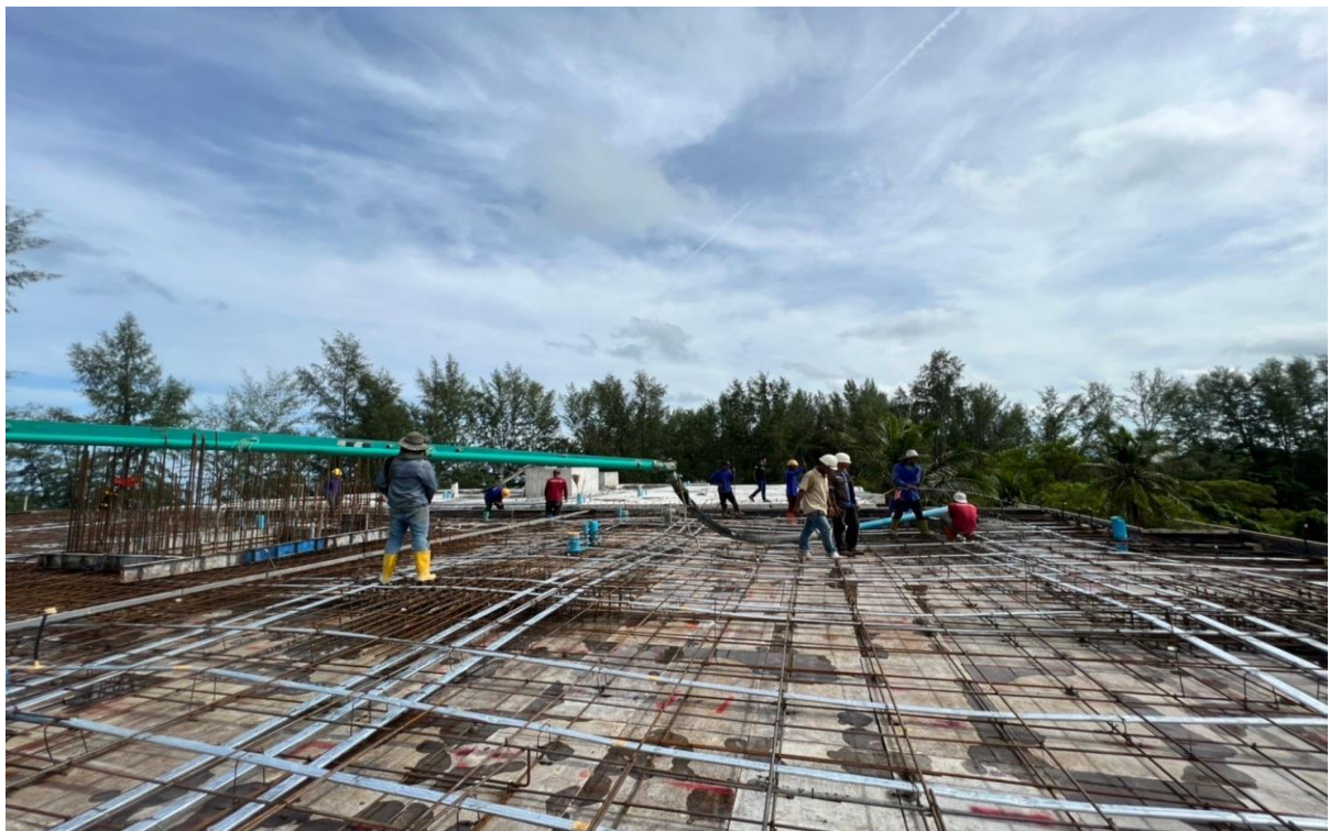
SLAB Building 3 ROOF FLOOR Begin concrete pumping – Post tension and Steelwork visible