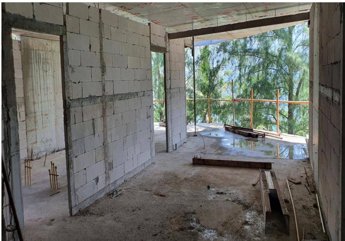
Blockwork 7303 Living area lead to master bedroom Type F 3 rd floor building 7