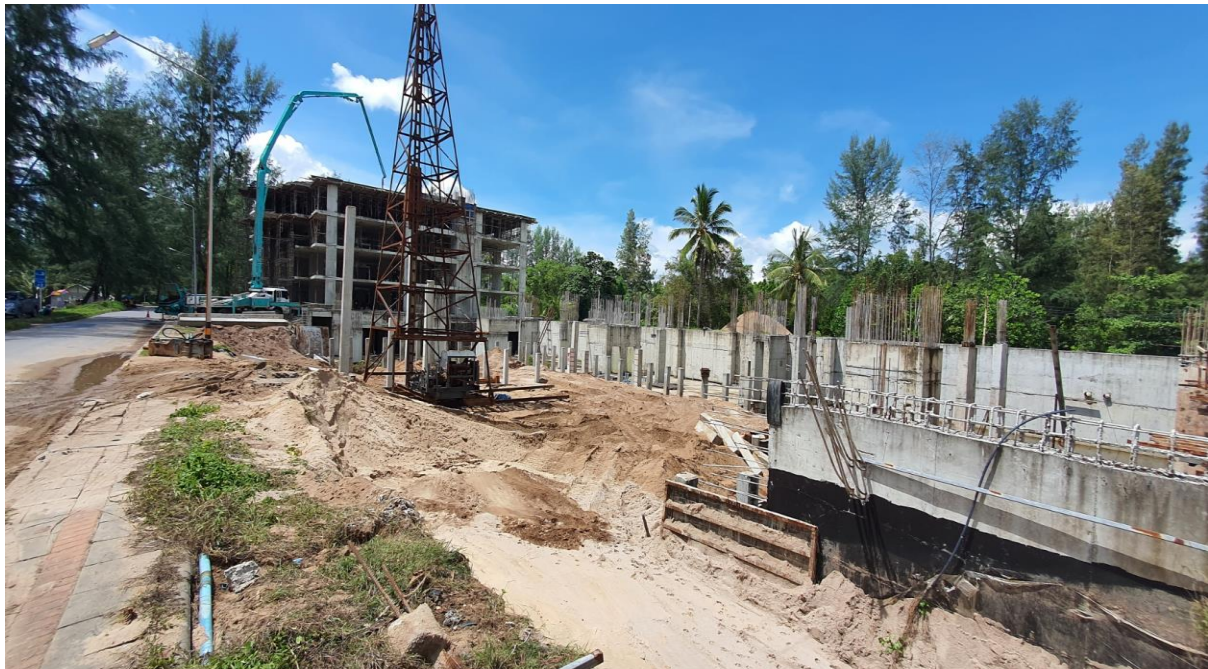
Piling pool structure on area that was the Previous Sales gallery, pouring of Slab Building 3 roof level in background