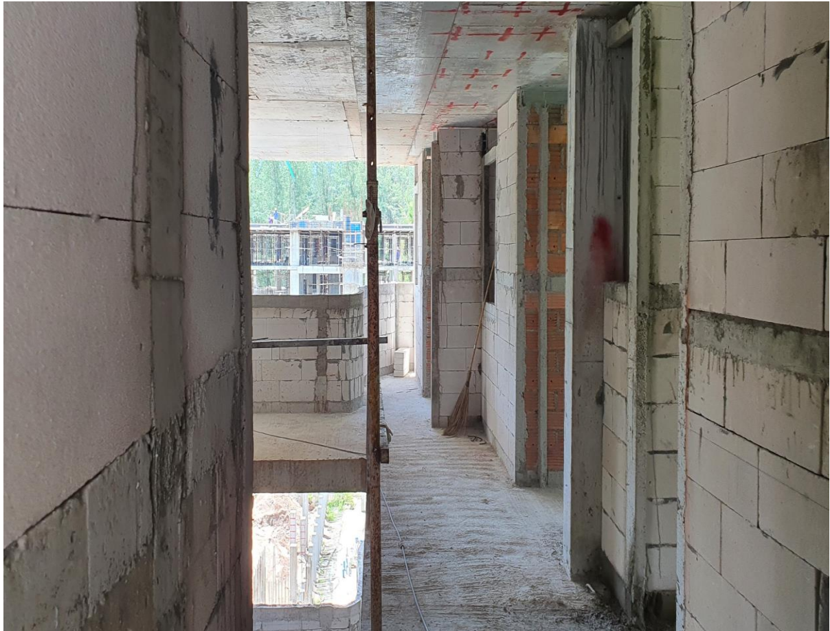
Corridor Block work and Balustrade 3 rd floor Building 7, from fire escape looking toward entrance area