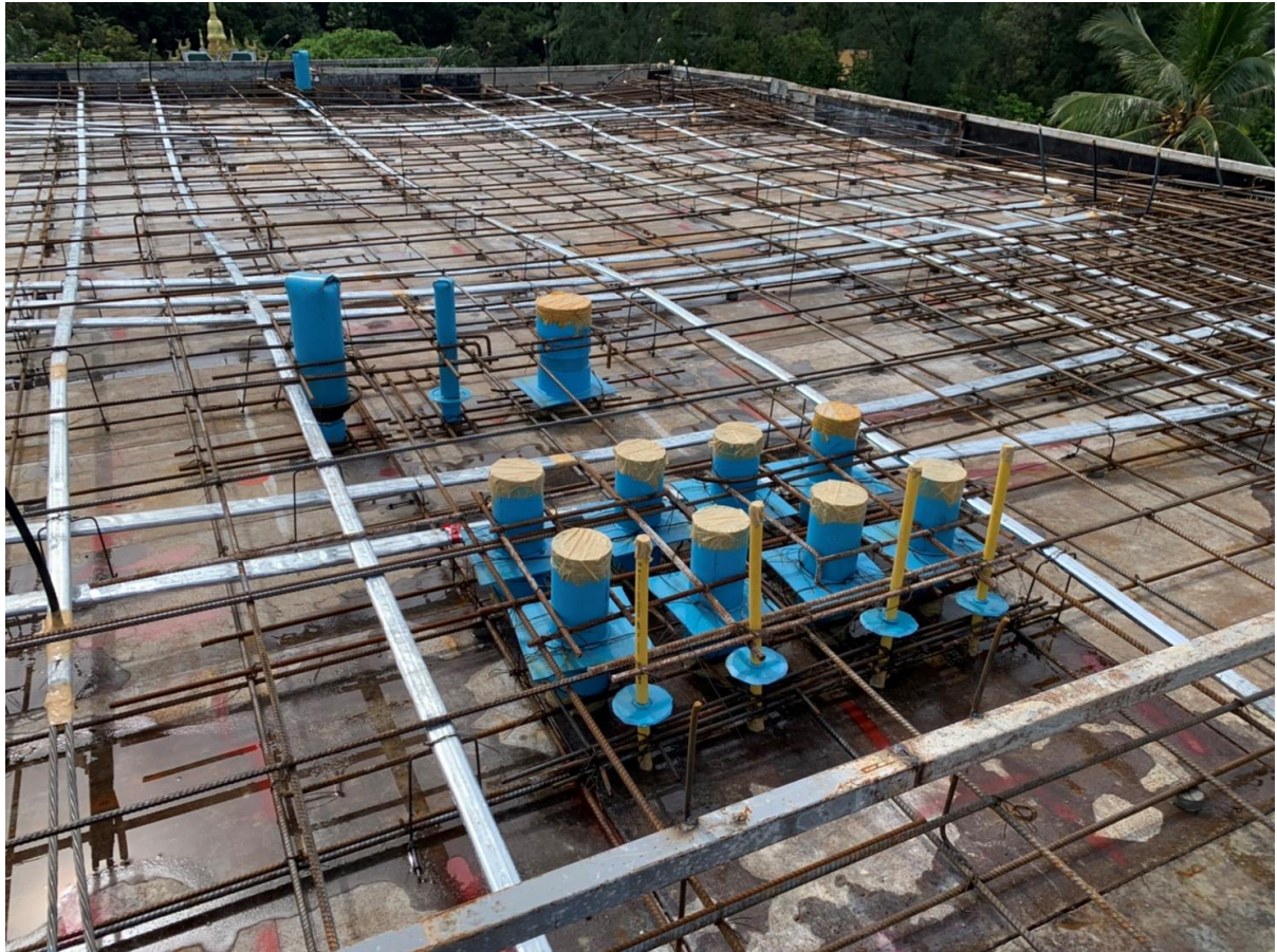
Sleeve work for Slab Building 3 Roof level