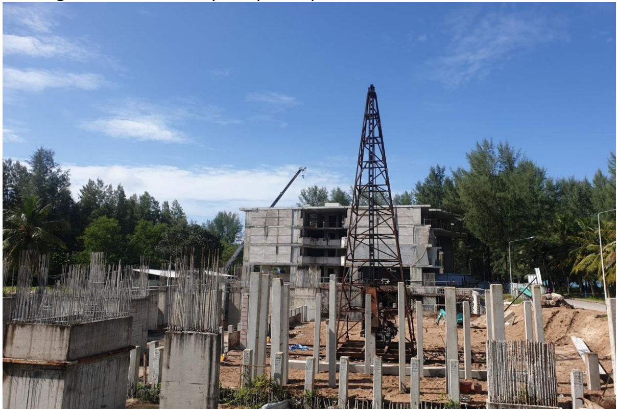
Piling works Pool Zone 5 /6/7 – building 7 visible in background

Radisson Phuket Mai Khao Beach Construction Progress Report