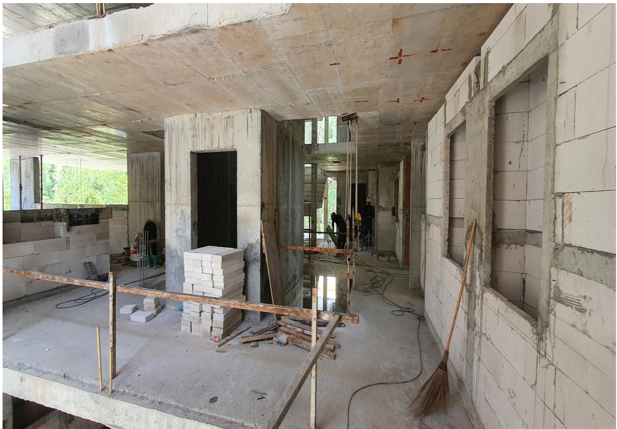
Block Work 1 st floor building 8 Right side is unit 8102-8105