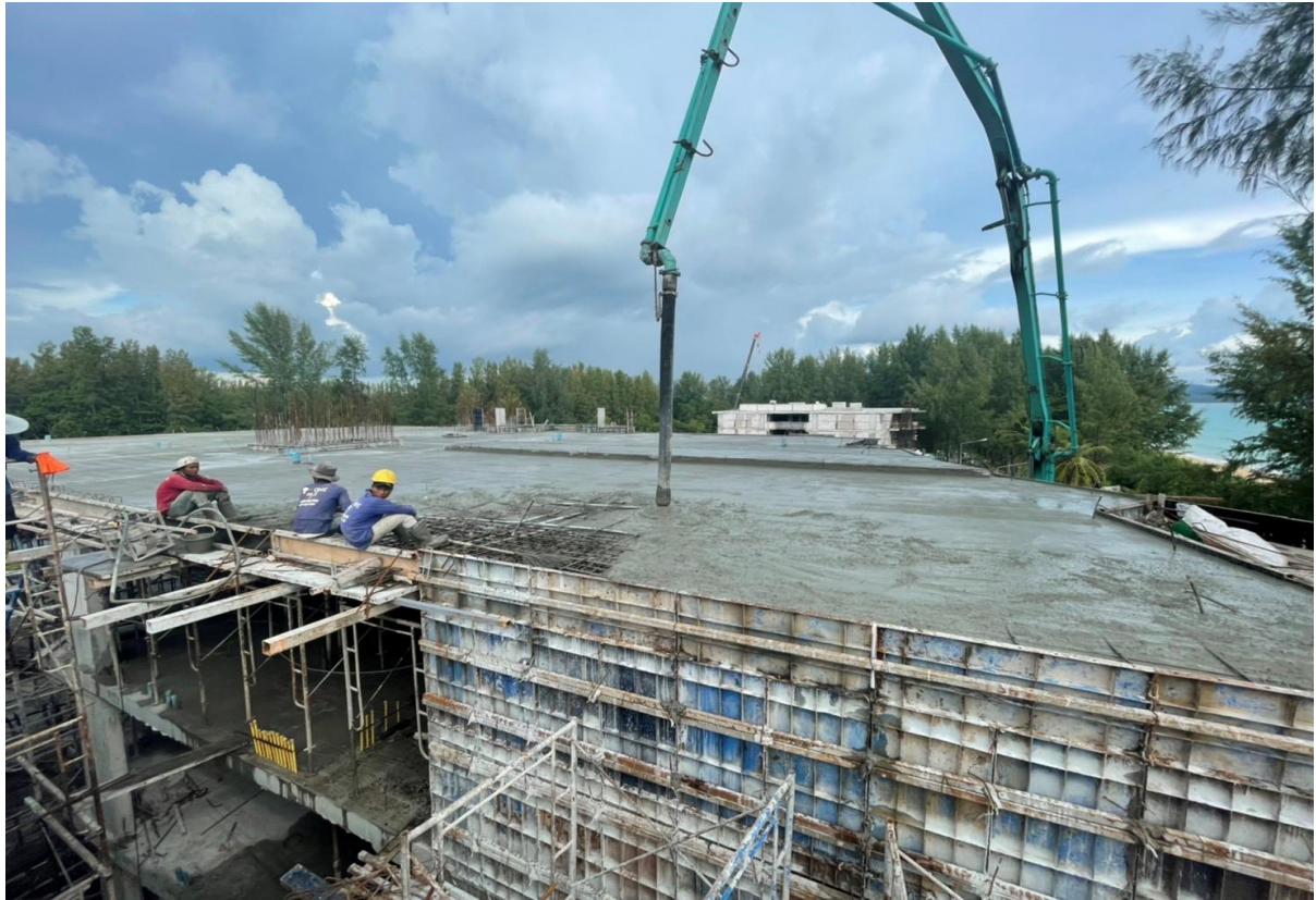
Building 3 Roof Floor Nearly completed pour