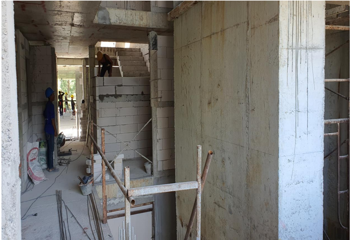
Blockwork 2 nd floor Building 7 from corridor garden view side looking from main lift to fire stair