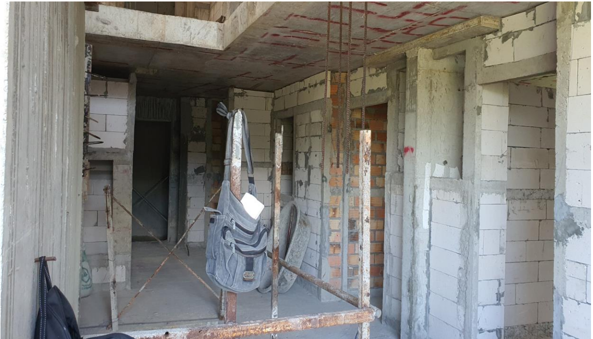
2 nd Floor Building 7 Blockwork Units 7203 7204 visible

Radisson Phuket Mai Khao Beach Construction Progress Report