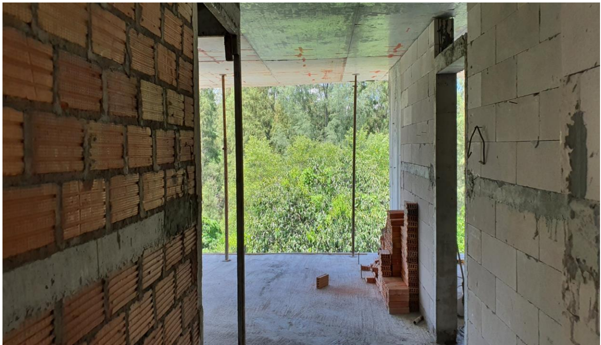
3 rd floor Building 7 garden view units with interconnecting door 7305-7306