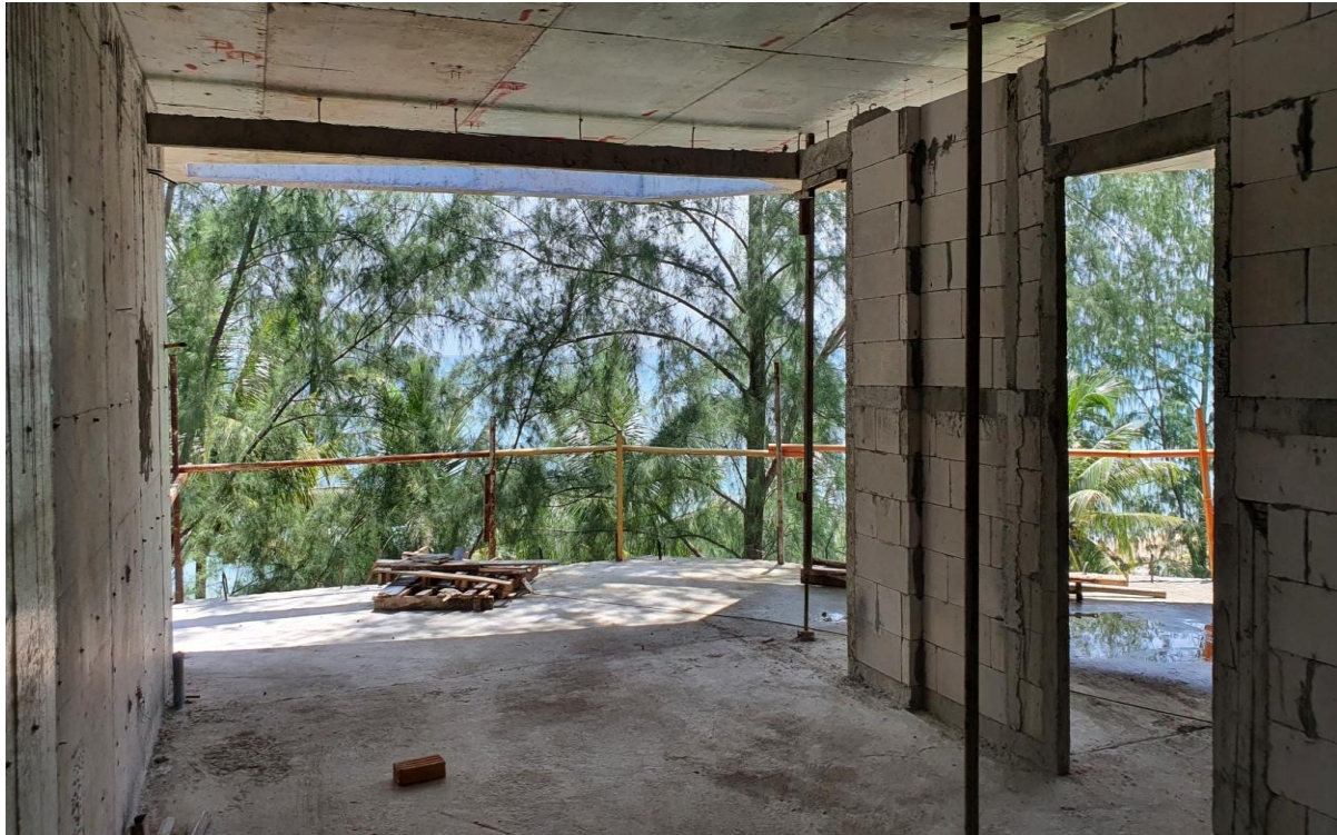
Blockwork bedroom zone 7303 3 rd floor Building 7