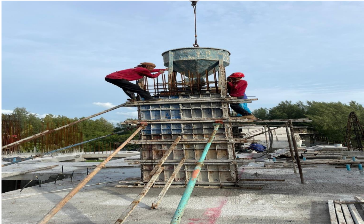
Building 3 3 rd floor to Roof floor columns