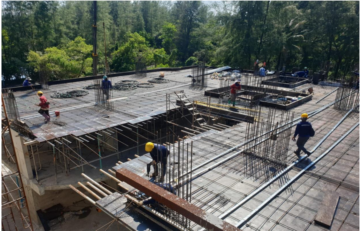
Installing Post tension Sling Slab 8 2 nd floor