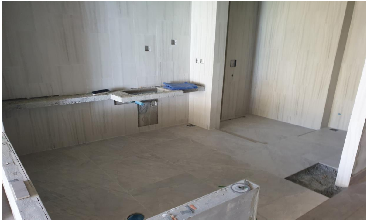
Mock up Room Tiling