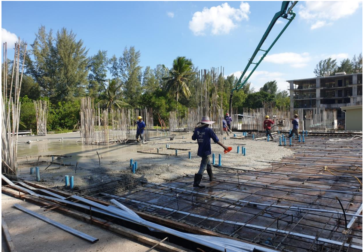
Concrete Pour Slab 3G

Radisson Phuket Mai Khao Beach Construction Progress Report