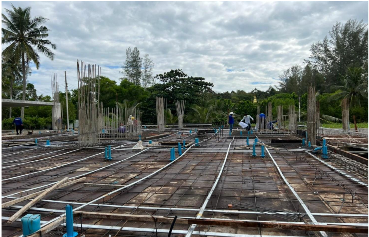
Check Sleeving slab 3G

Radisson Phuket Mai Khao Beach Construction Progress Report