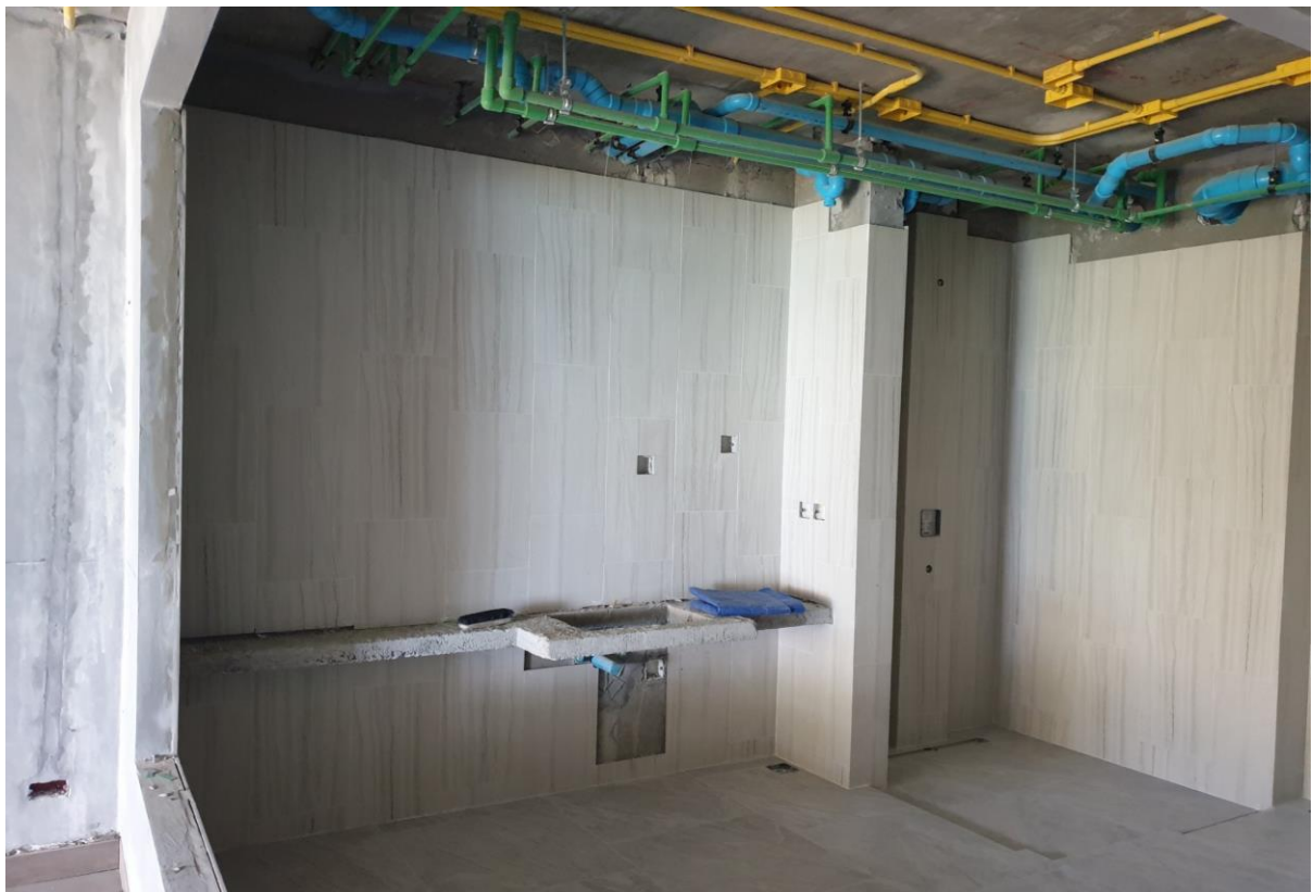
Mock Up room tiling 1 st Floor Building 7 bathroom Walls & Floor

Radisson Phuket Mai Khao Beach Construction Progress Report