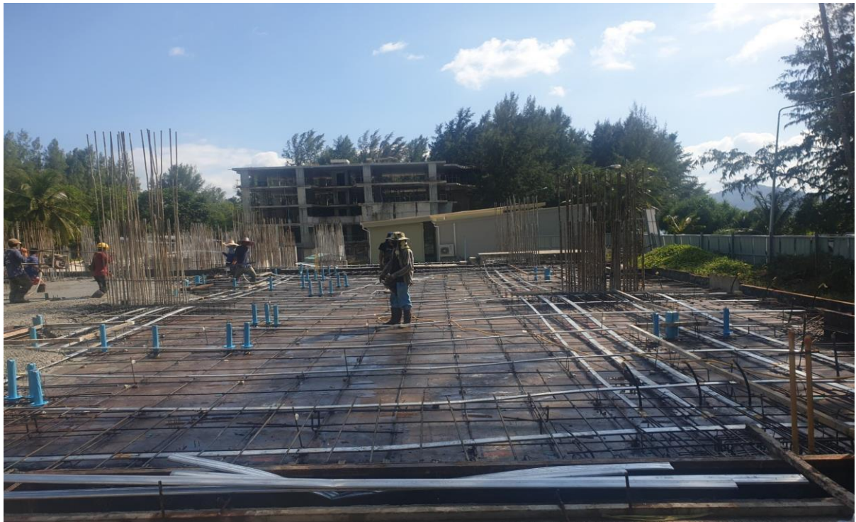
Concrete pouring Slab 3 G

Radisson Phuket Mai Khao Beach Construction Progress Report