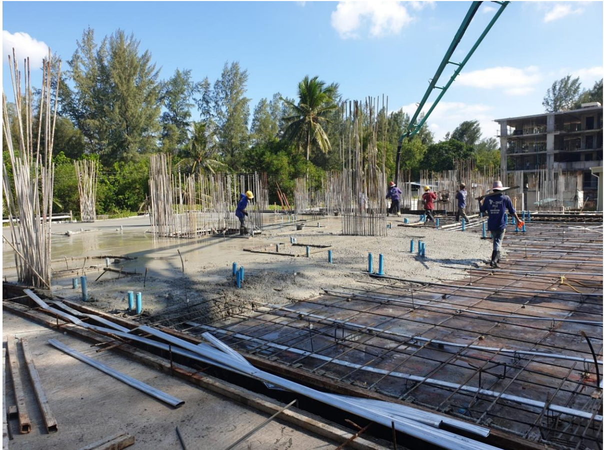
Inspect Sleeving Slab 3 G