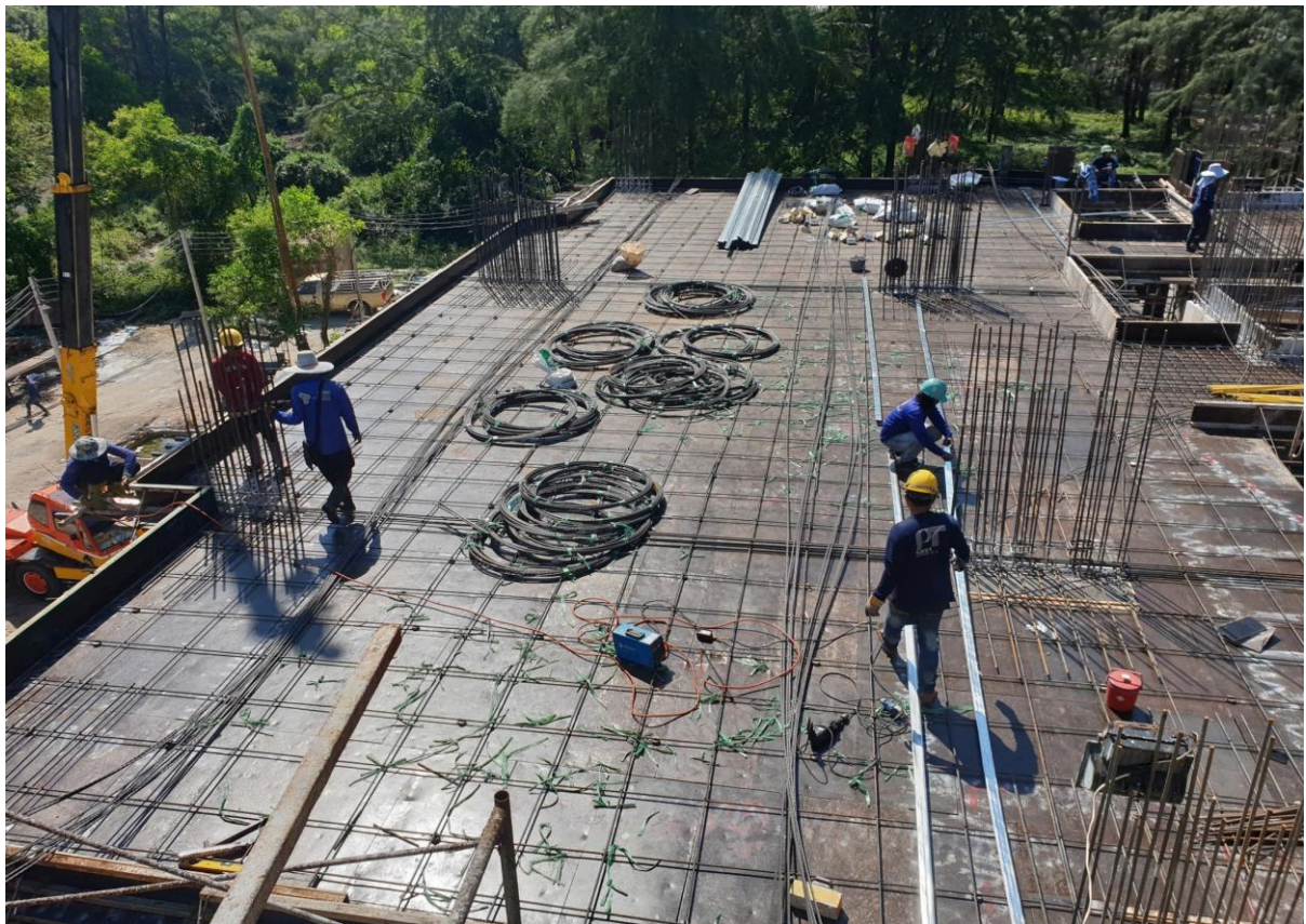
Lower Rebar installed preparing install post tension sling slab 8 2 nd floor

Radisson Phuket Mai Khao Beach Construction Progress Report