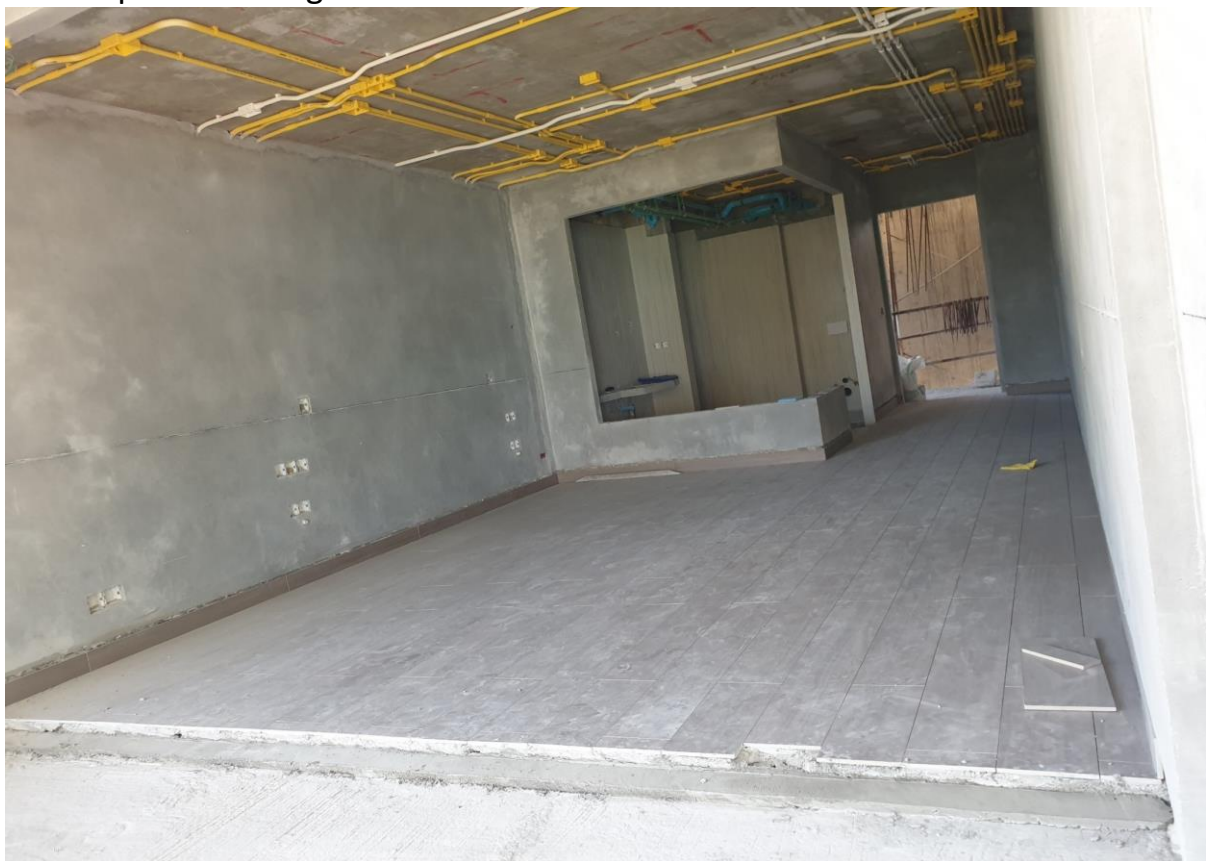
Tiling floors Mock Up rooms

Radisson Phuket Mai Khao Beach Construction Progress Report