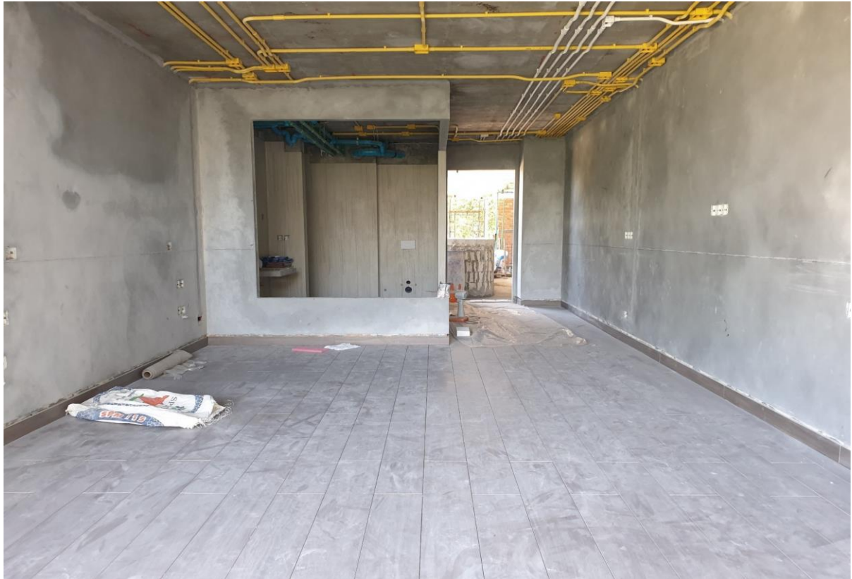
Tiling bathroom and main Floor Mock up rooms 7 1 st Floor