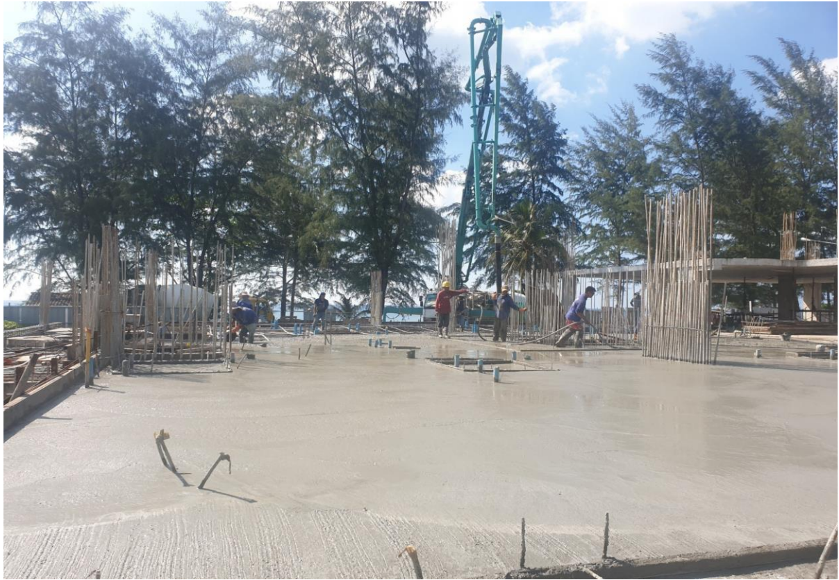
Pour Concrete Slab 3 G