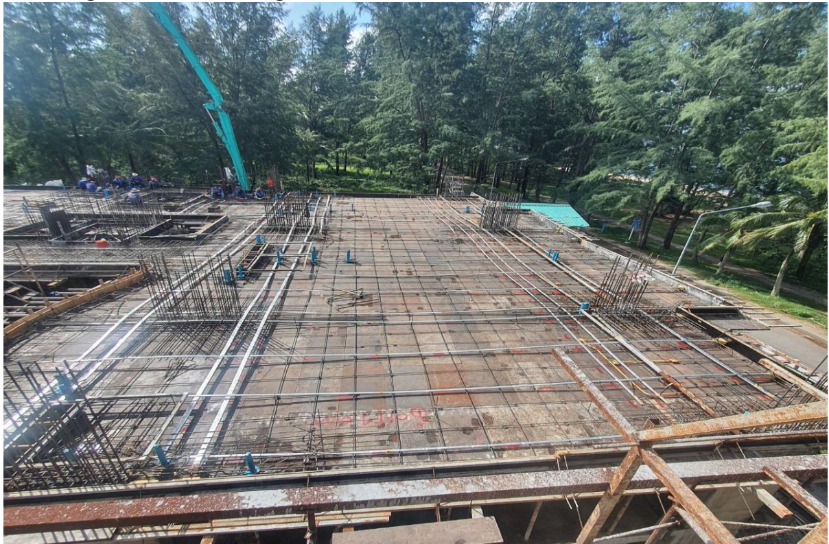
slab 8 2 nd floor

Radisson Phuket Mai Khao Beach Construction Progress Report