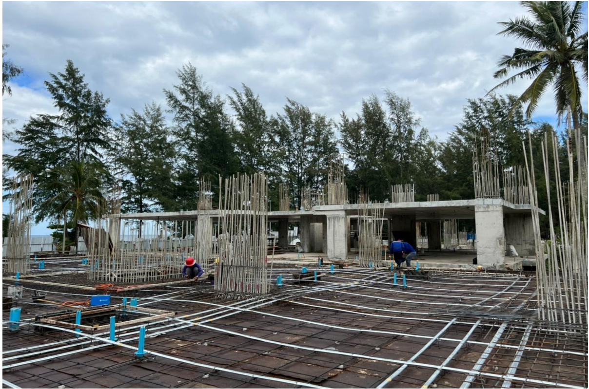
Post tension Sling installed inspect sleeving 3 G Slab