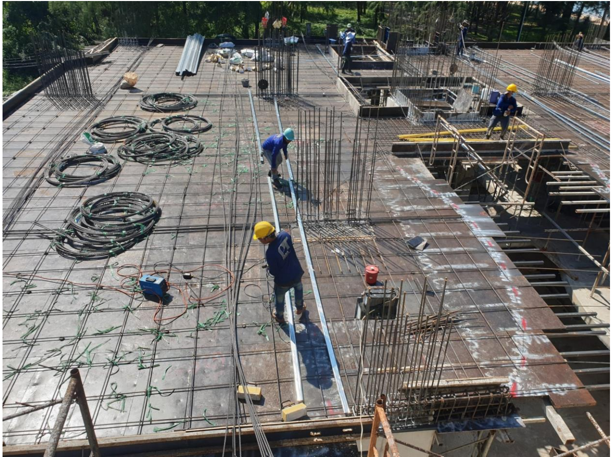
Installing Post tension Sling Slab 8 2 nd floor