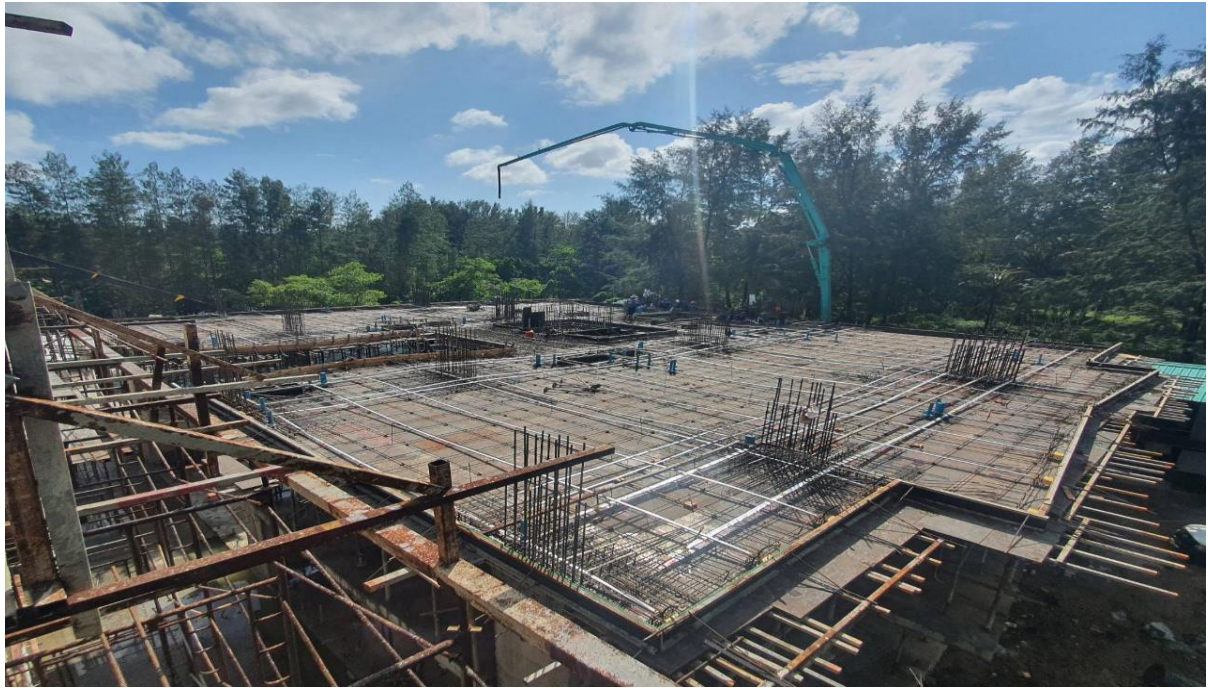
Poring slab & 2 nd floor