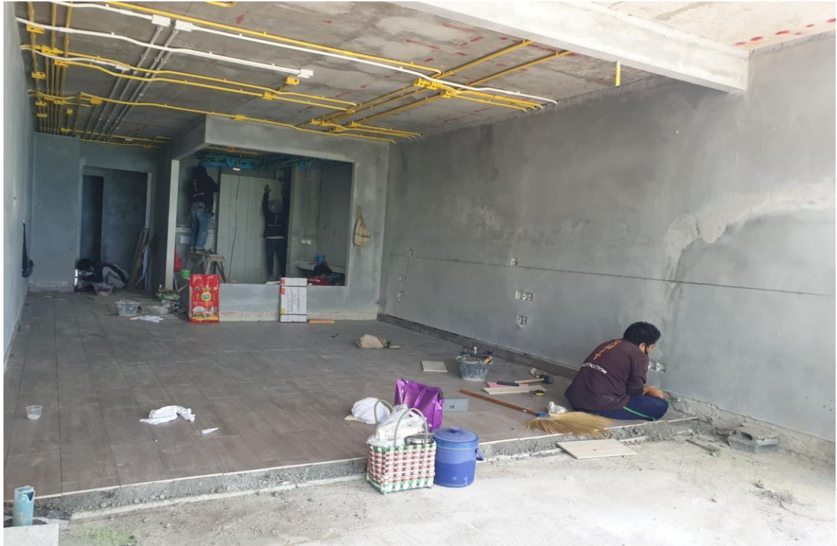
Mock up rooms floor tiles