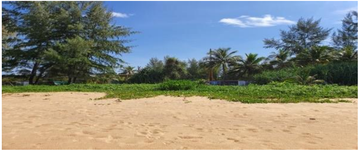
From the beach looking East, back to the project NEW PROJECT RENDERS