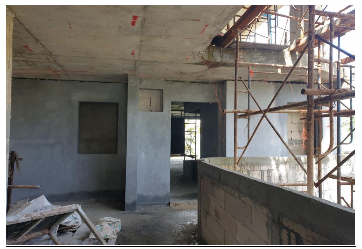
7101 from opposite guest lift lobby