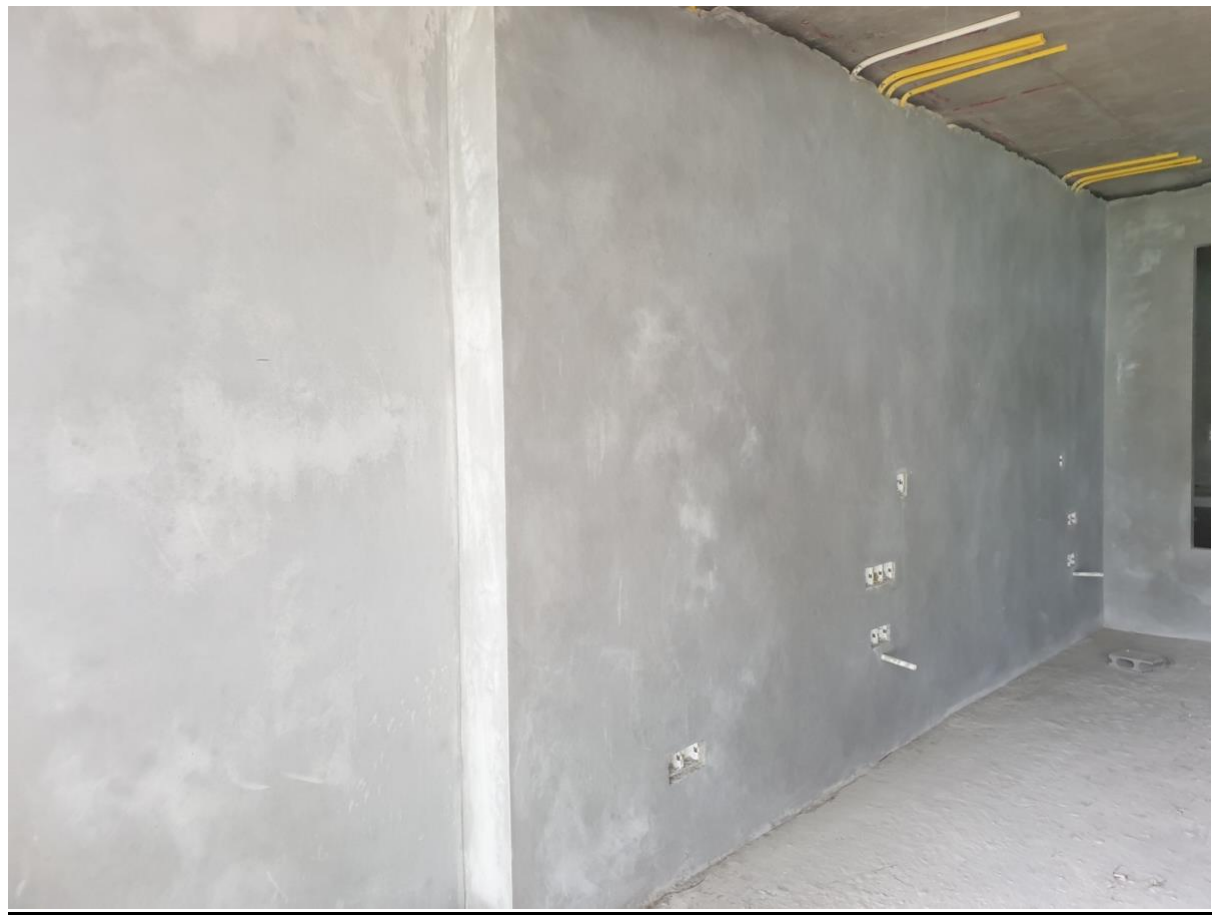
7102 Walls Bedhead with electrical 1<sup>st</sup> Fix back boxes