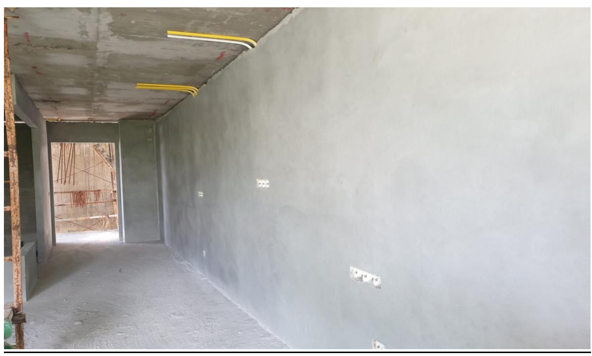
7102 Tv Panel & Desk Area