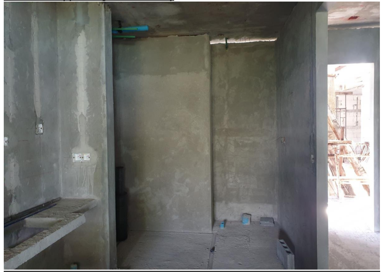
Toilet & Shower area