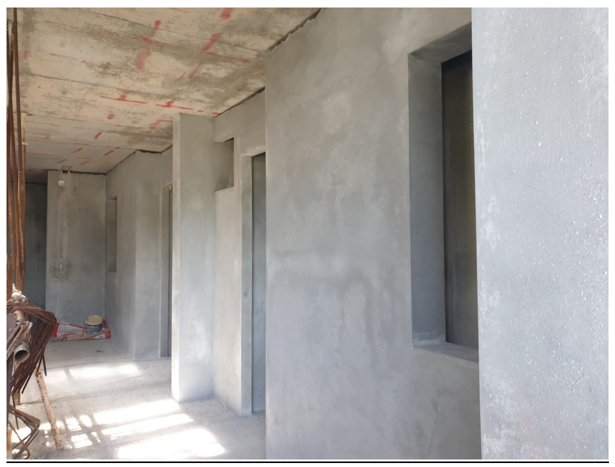
Corridor 7-1 looking from 7101 to 7102/7103

Radisson Phuket Mai Khao Beach Construction Progress Report