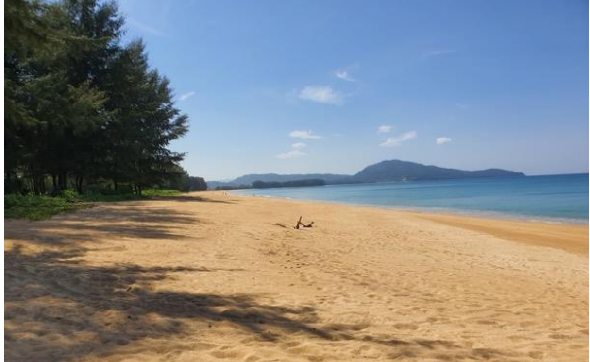
View of the beach, looking to the south