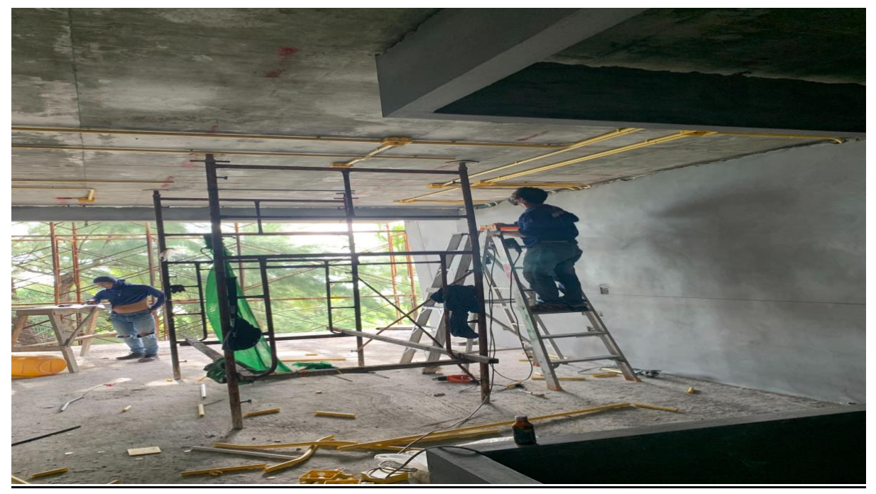
Conduit preparation 7102