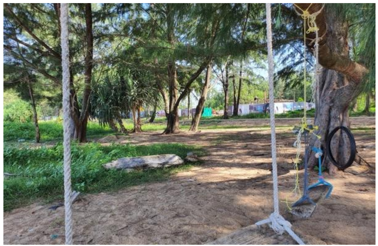
Start of the beach areas opposite the edge of the plot (at building 8 end)