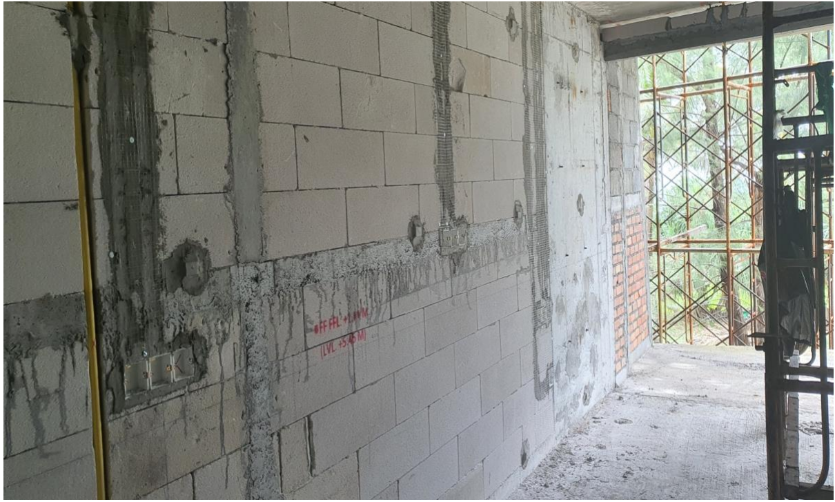
1 st Fix Electrical