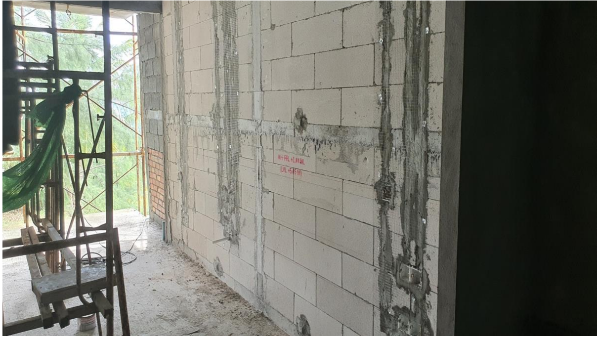
1 st Fix electrical inside rooms Building 7 floor 1