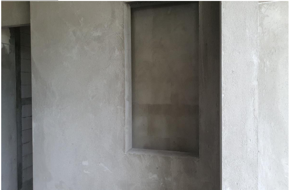
Wet services shaft for guestroom