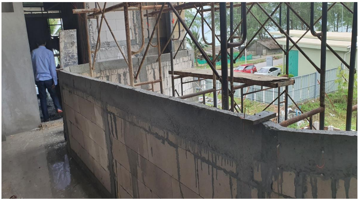
Balustrade wall 7-1 looking towards 7101