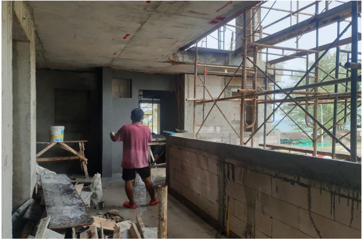
Building 7 1 st floor corridor rendering