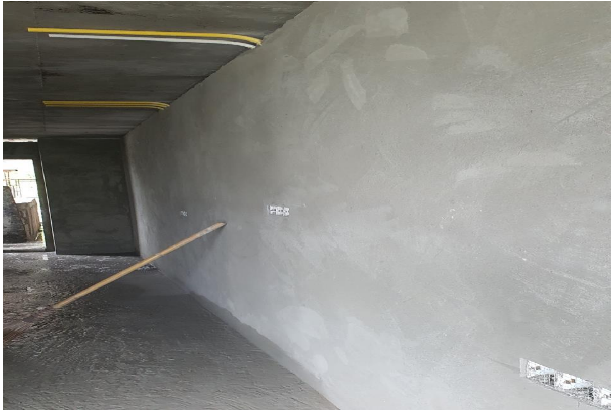
1 st Fix electrical and rendering guestroom walls