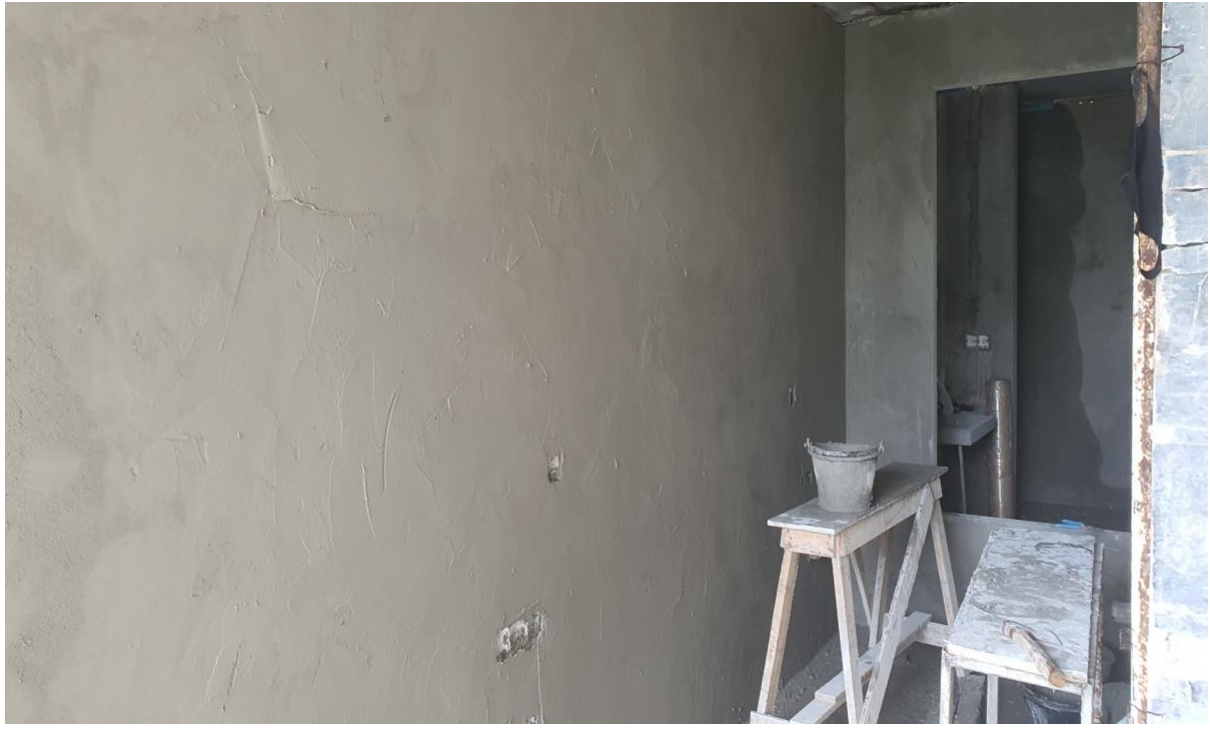
Ongoing rendering guestrooms 7-1