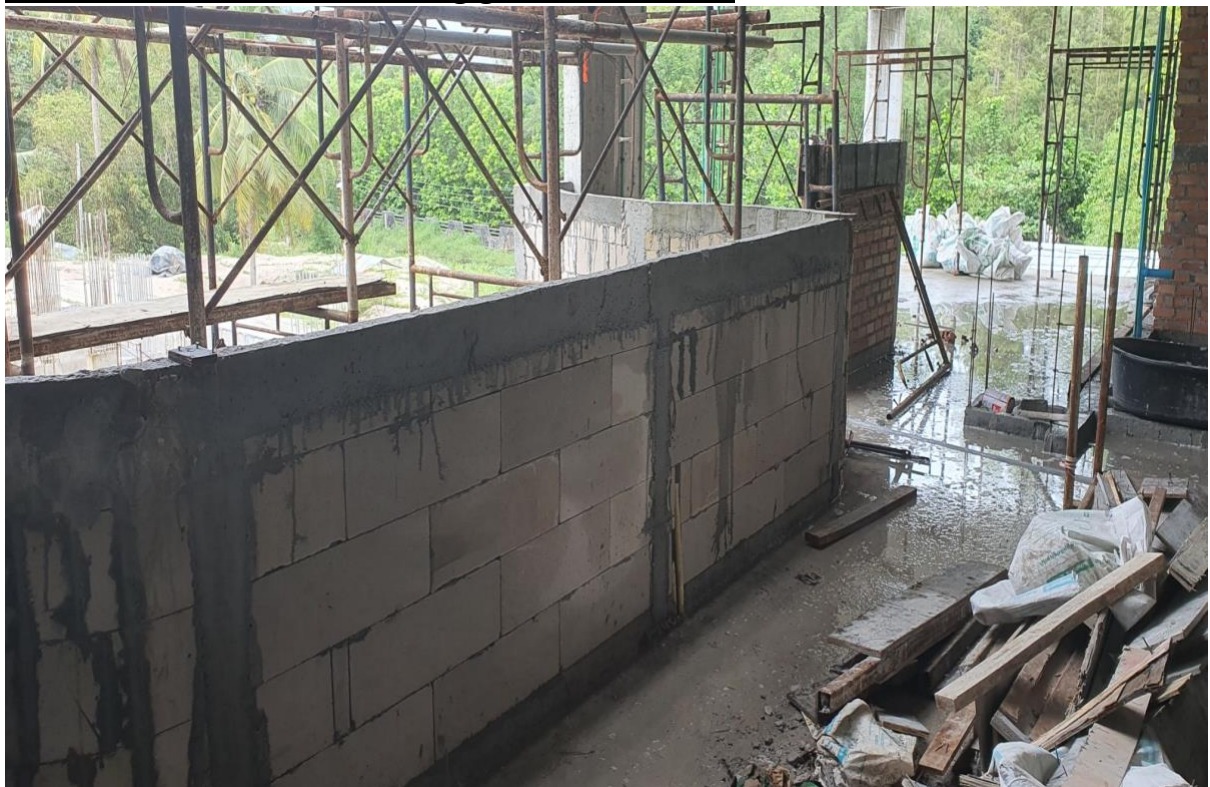
Floor 7-1 block wall balustrade in front main lift