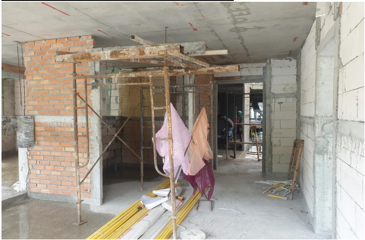
Blockwork in room 7105

Radisson Phuket Mai Khao Beach Construction Progress Report