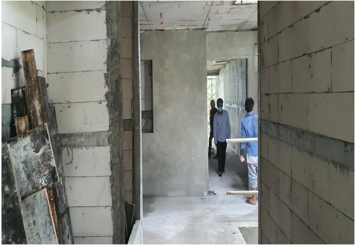
Corridor between EE cupboard and rear main stair looking toward 7102/7103