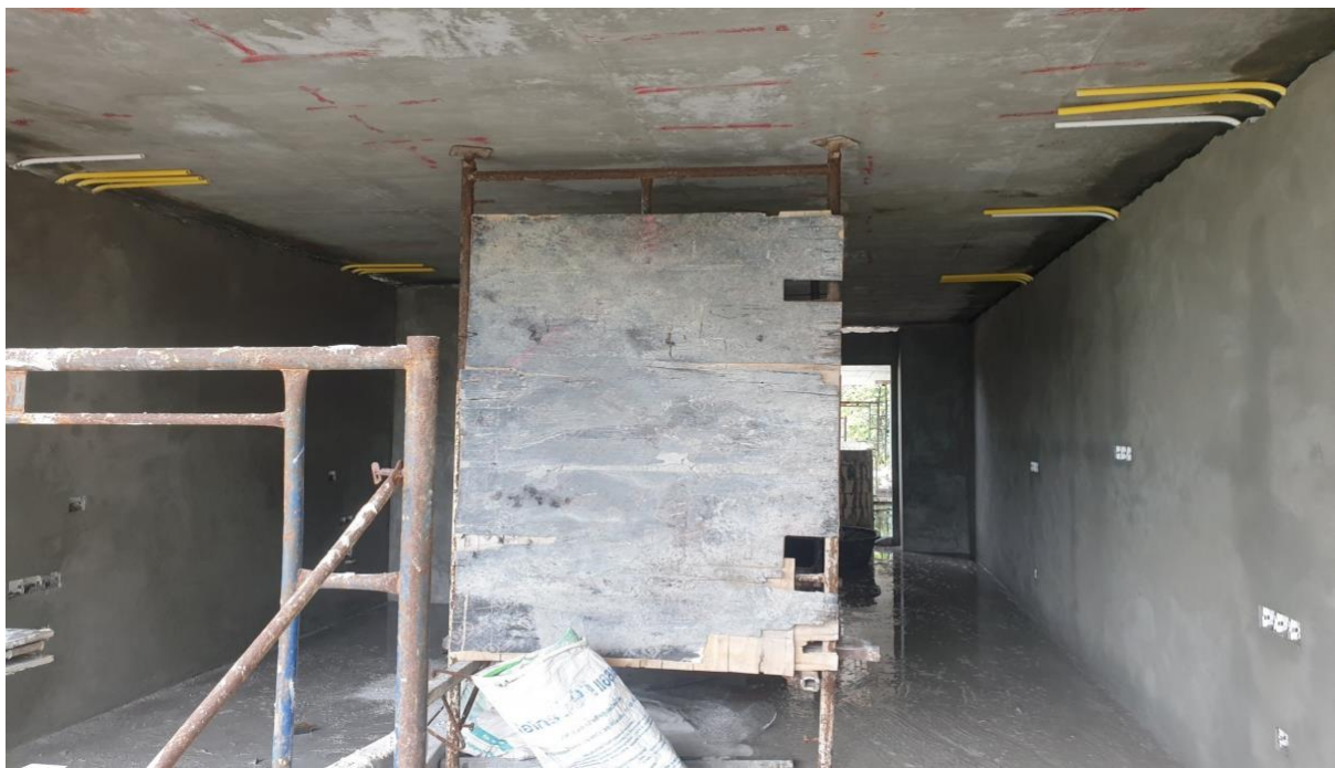
Rendering walls Guestrooms