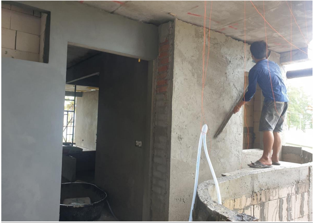
Rendering corridor areas outside guestroom 7101