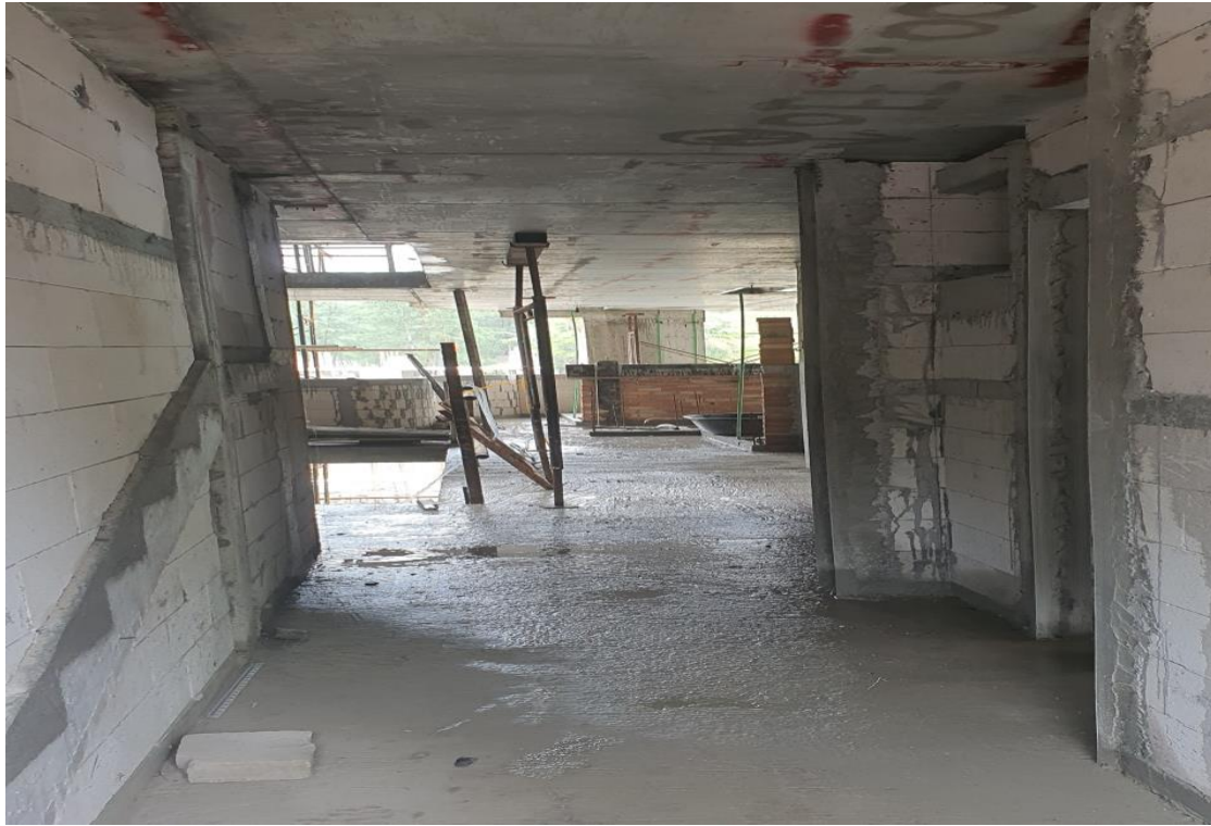
From Fire exit stair looking to Front building rooms 7105-7108 on right side