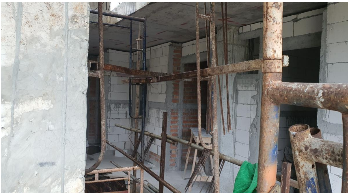
Corridor near Main Lift looking across to 7102/7103