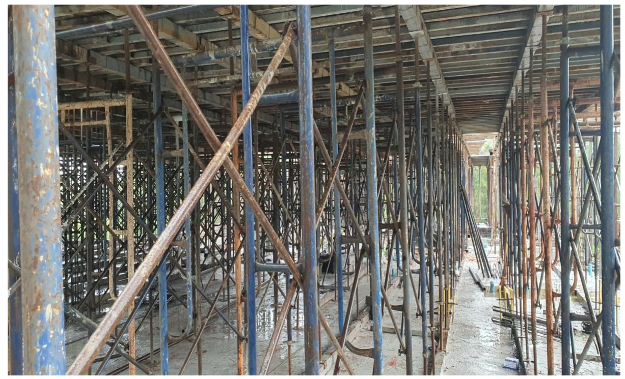
Scaffold support Roof Slab 7