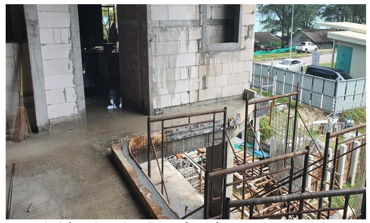
Prepare kerb for Balustrade wall 7-1 in front of 7101