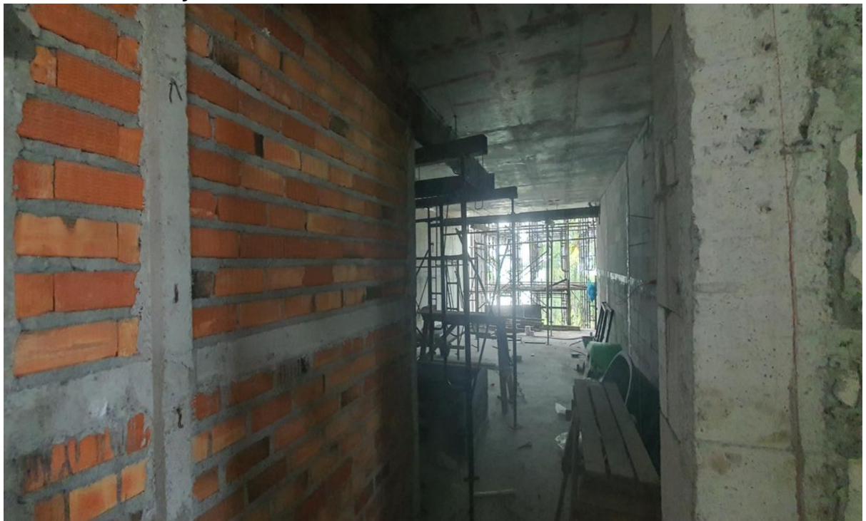
Blockwork in rooms 7104 (red brick Bathroom area)