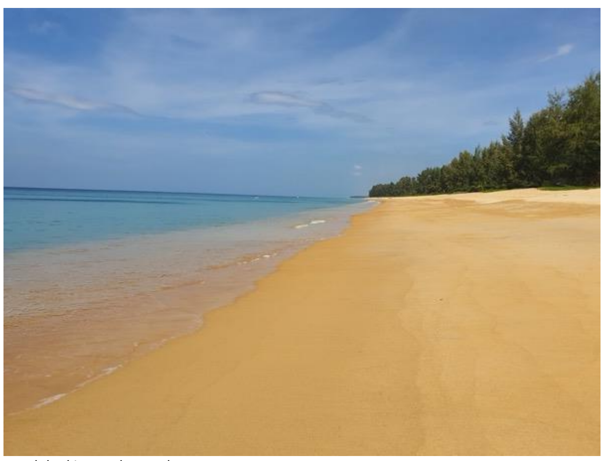
Beach looking to the north