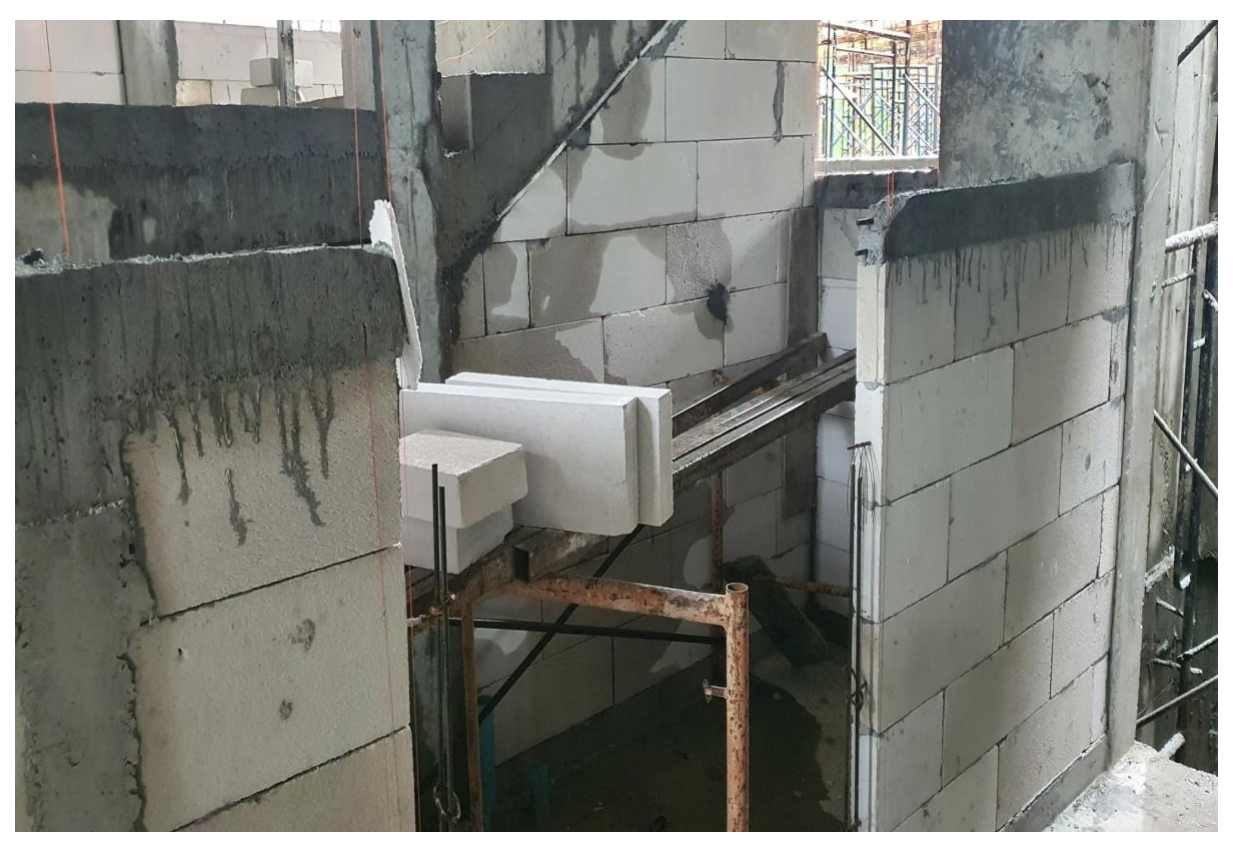
Block Work Maid Room