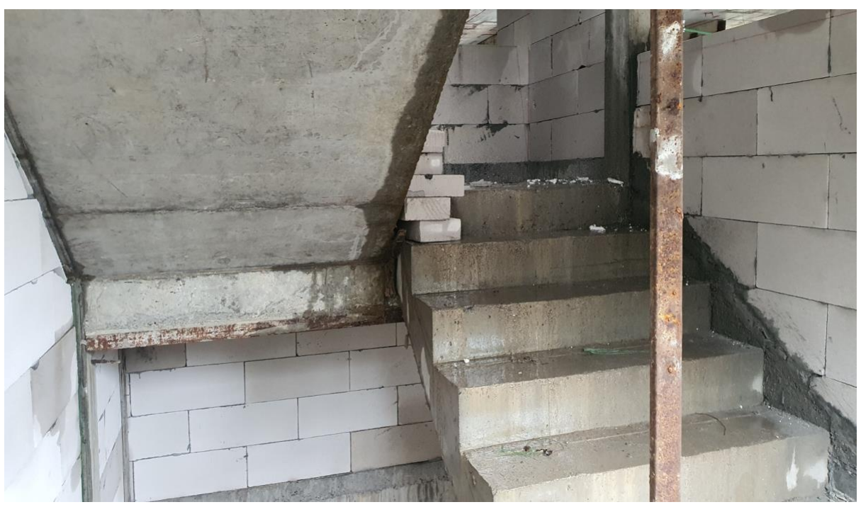
Blockwork emergency stairwell 7-g to 7-1