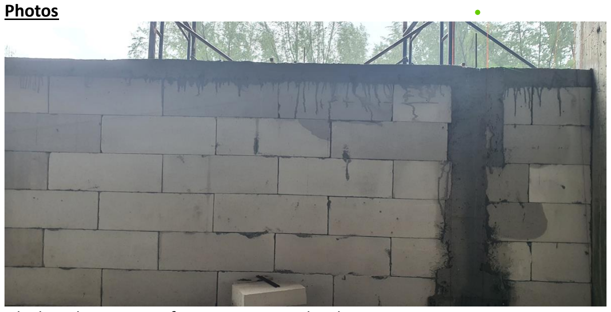
Blockwork rear part of emergency Stair level 7-1

Radisson Phuket Mai Khao Beach Construction Progress Report