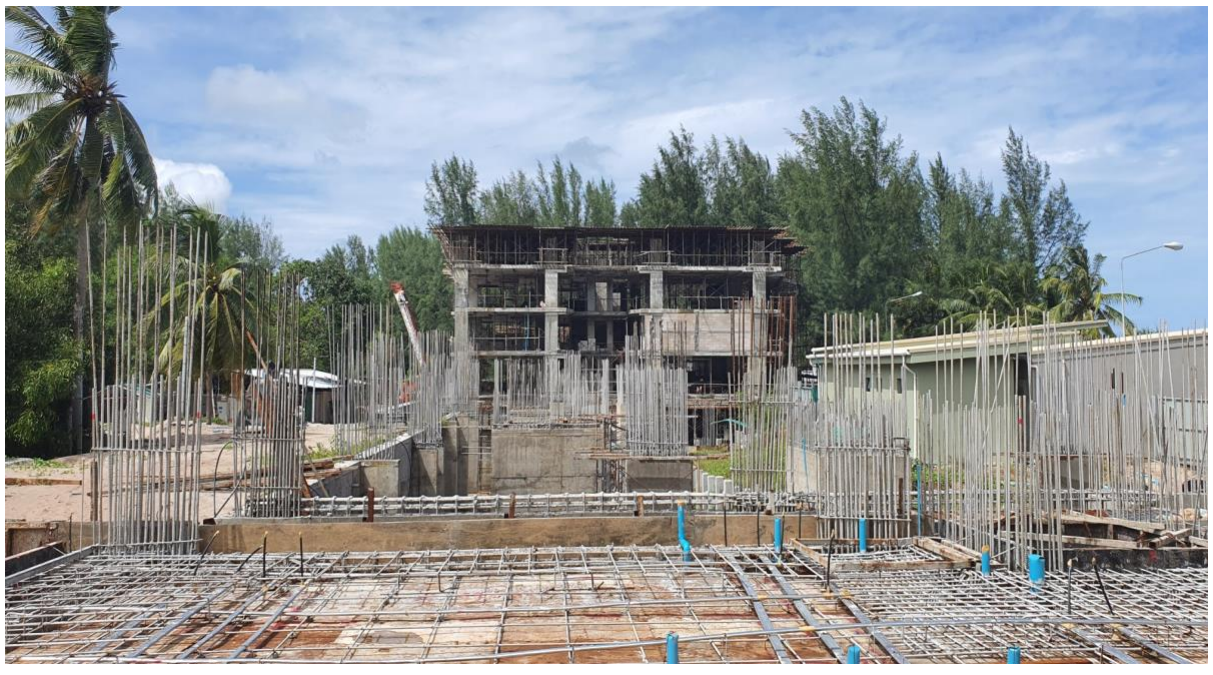
Building 7 seen from Slab 3-G Roof floor formwork is top level