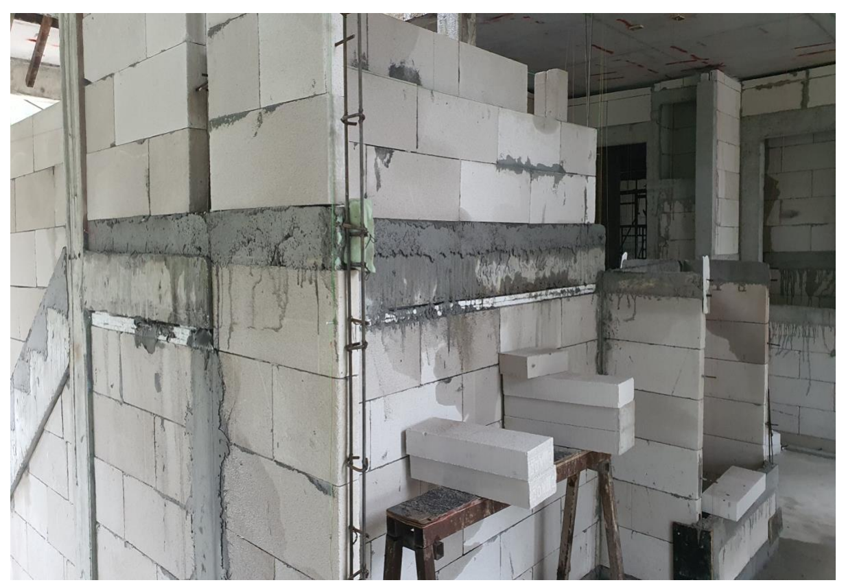
Blockwork Fire Stair area and EE Cupboard and Fire hose Cabinet 7-1