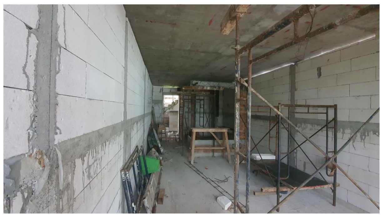
Balcony looking into 7104