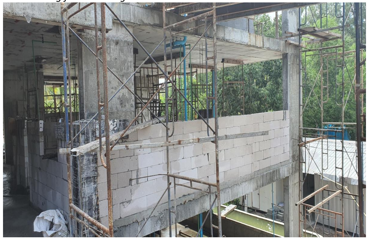
7108 looking from Building 8

Radisson Phuket Mai Khao Beach Construction Progress Report