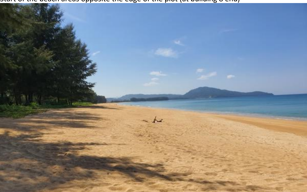
View of the beach, looking to the south