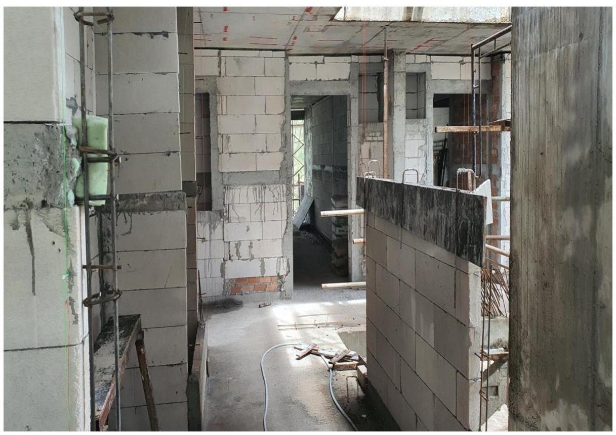
Corridor 7-1 looking from 7107 to 7103 near rear of main stair/EE cupboard