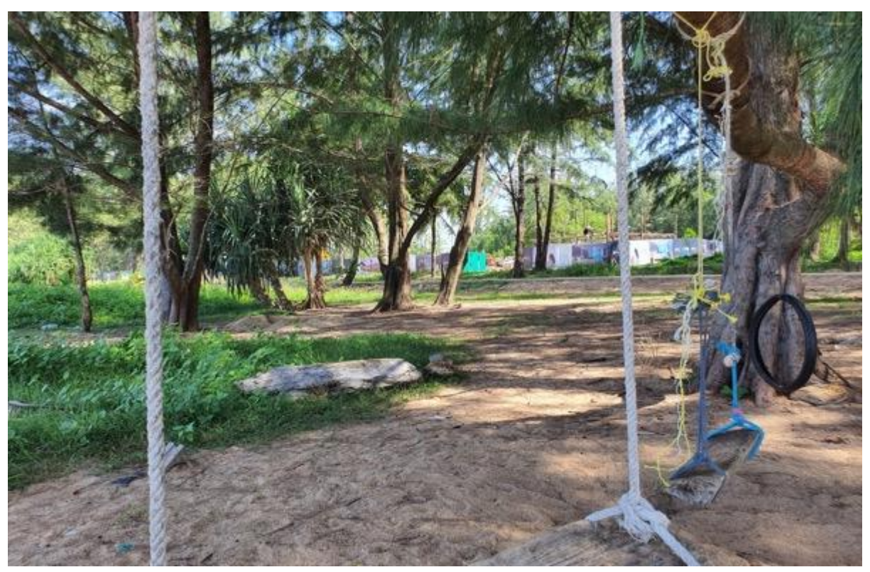
Start of the beach areas opposite the edge of the plot (at building 8 end)