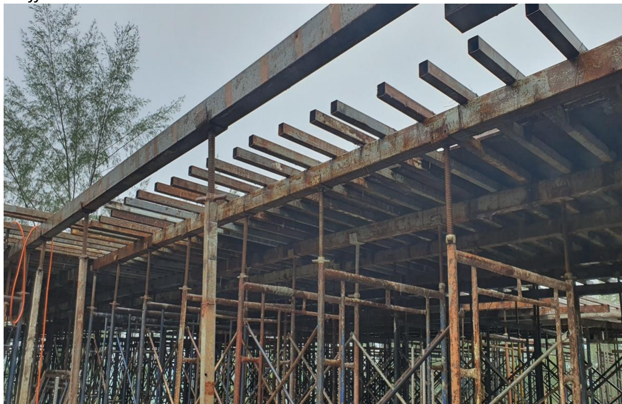
Scaffold formwork 7 Roof

Radisson Phuket Mai Khao Beach Construction Progress Report