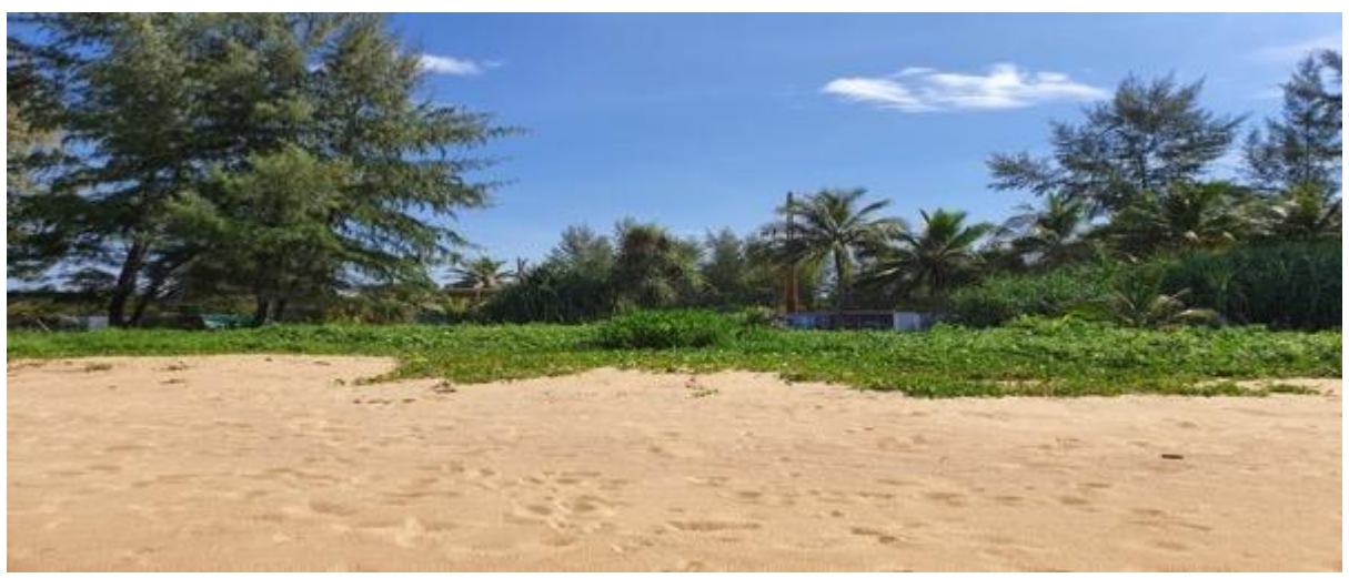
From the beach looking East, back to the project NEW PROJECT RENDERS