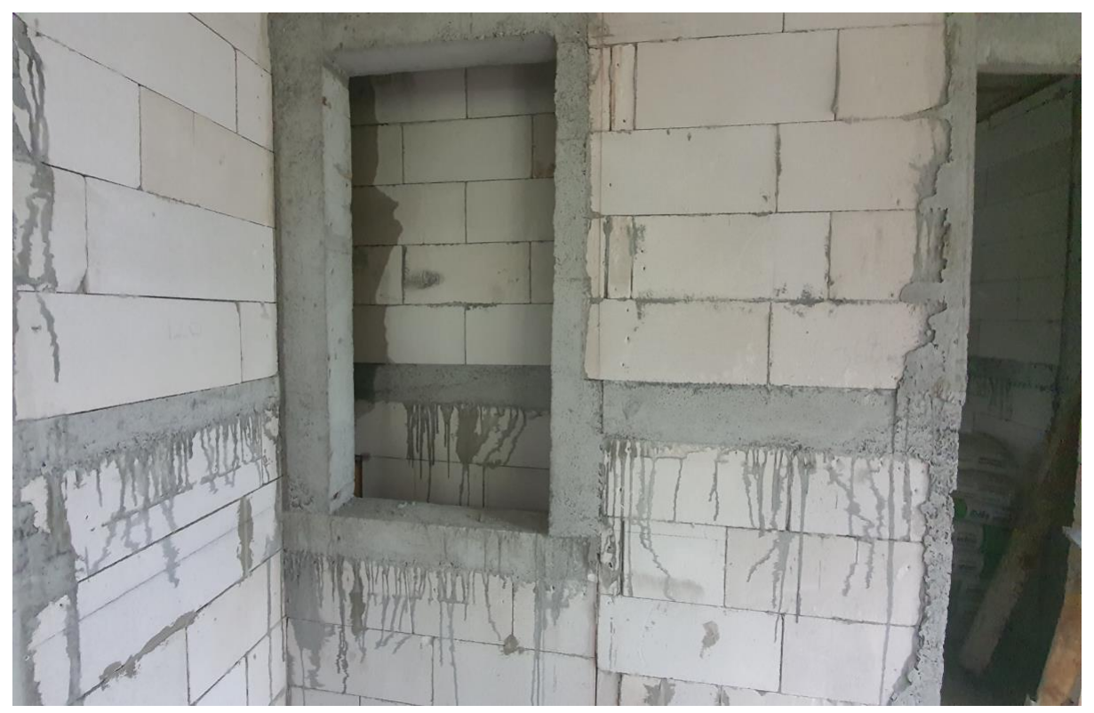
Wet Services shaft rooms