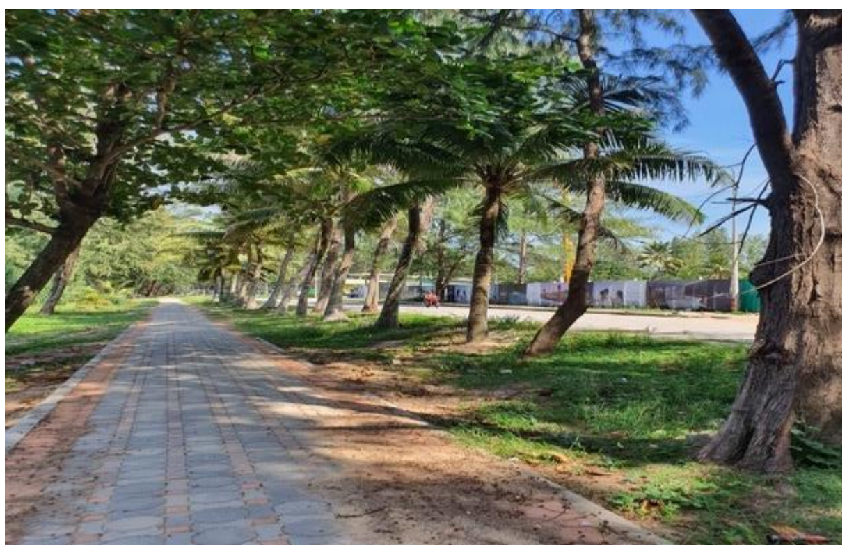
Directly in front of the plot, road and cycle/pathway and to the right onto the beach