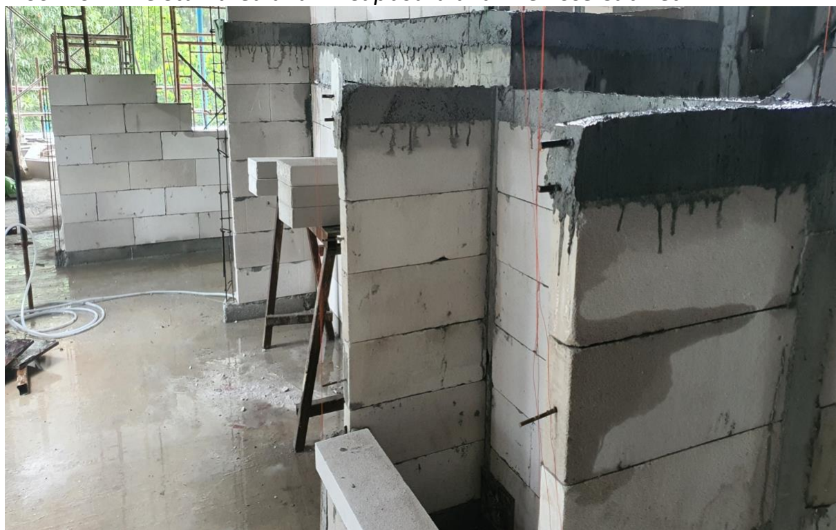
EE Cupboard & Fire Hose Cabinet