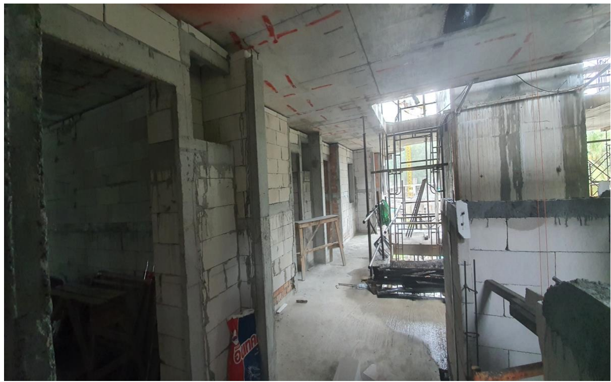
7-1 Corridor looking from Service Lift towards Rooms 7104 – 7101