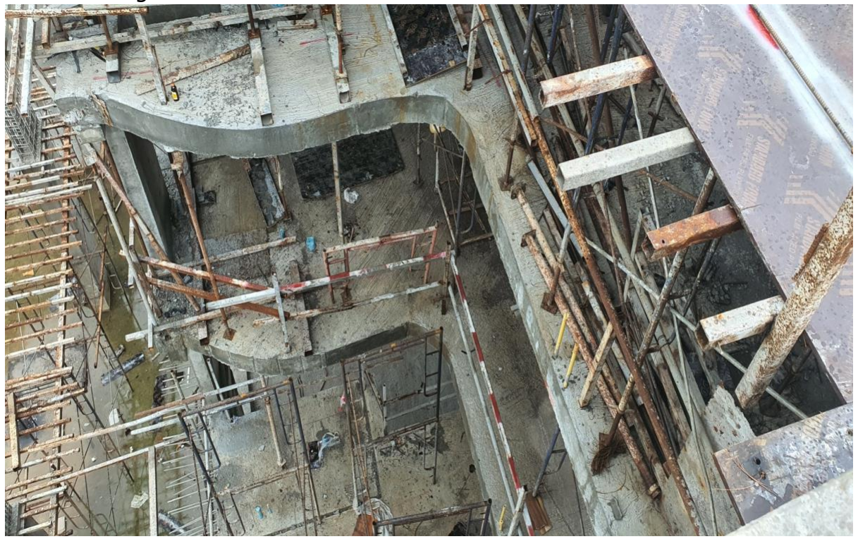
View from 7-3 looking down through entrance areas floor by Floor to Ground floor