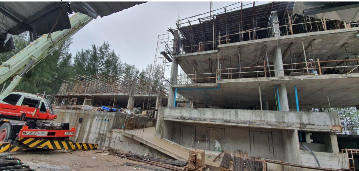
Rear of Building 7 (Right side) and 8 (Left side) Building 7 is upto 3<sup>rd</sup> Floor level just roof level to go