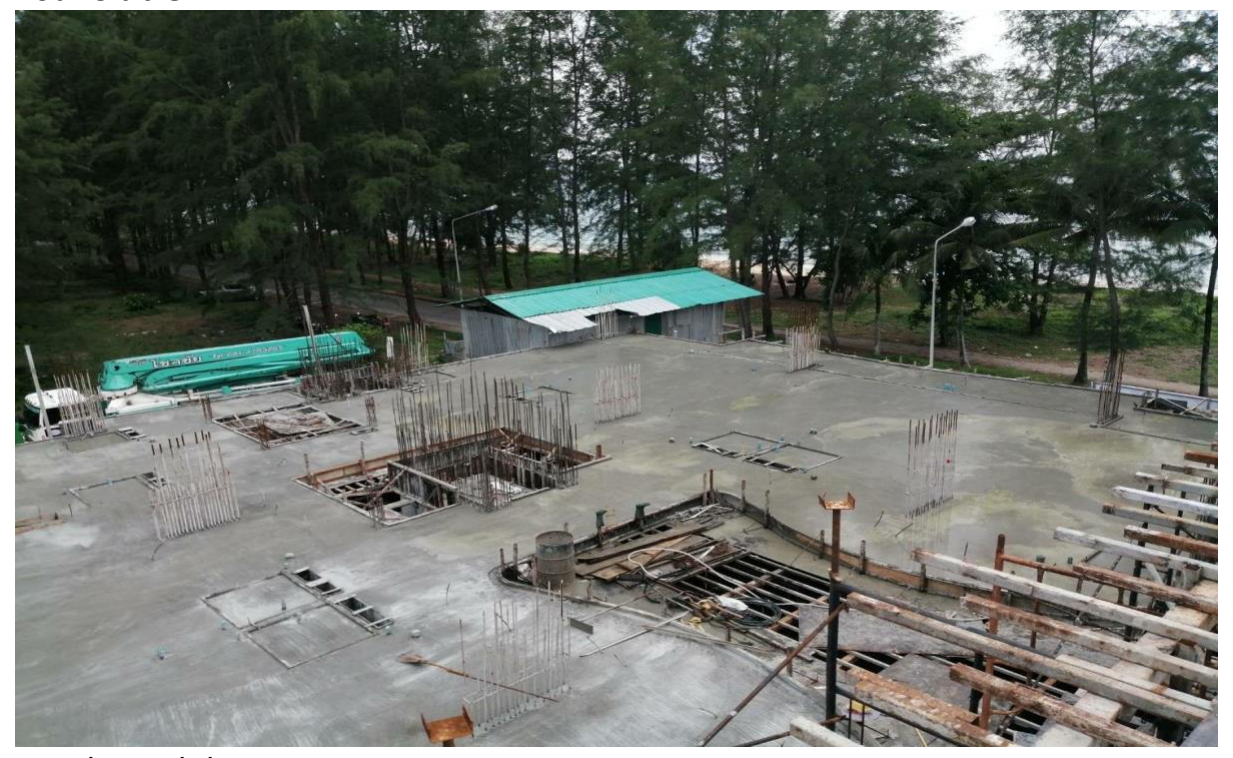
Finishing Slab 8-1 pour