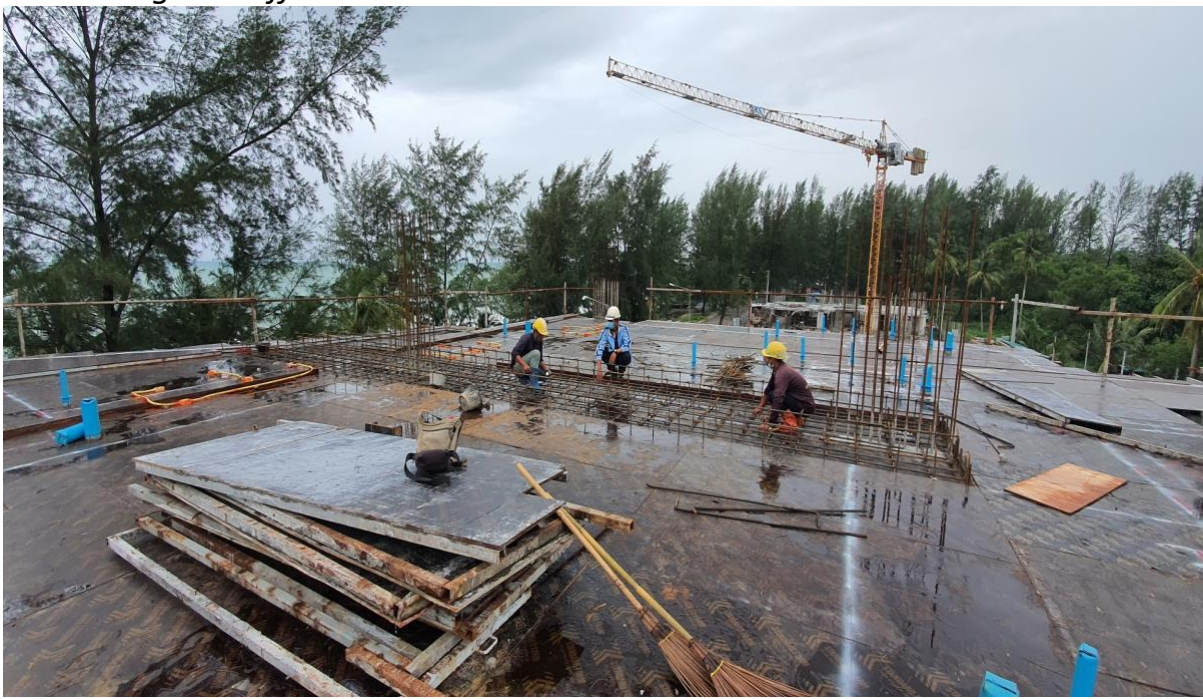
7-3 Formwork and Band Beam steelwork installation (thicker structure area to support Type F Terrace extension)

Radisson Phuket Mai Khao Beach Construction Progress Report