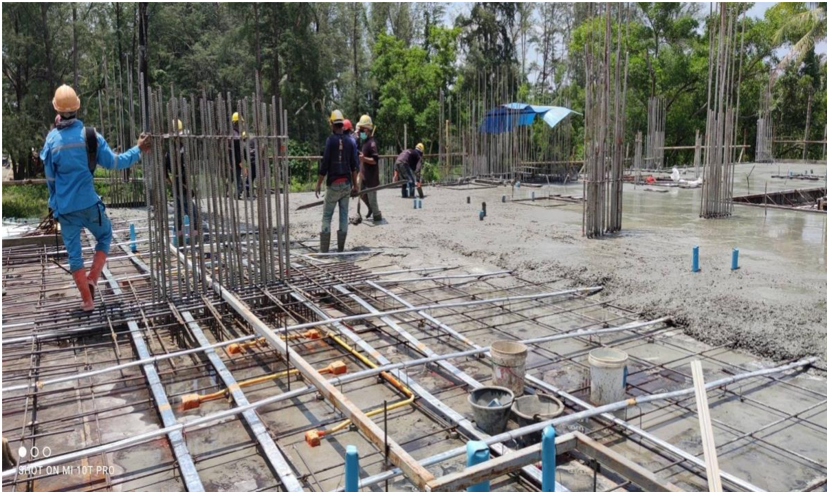
Slab 2 -1

Building 2 Slab 1 pouring guest elevator area in foreground