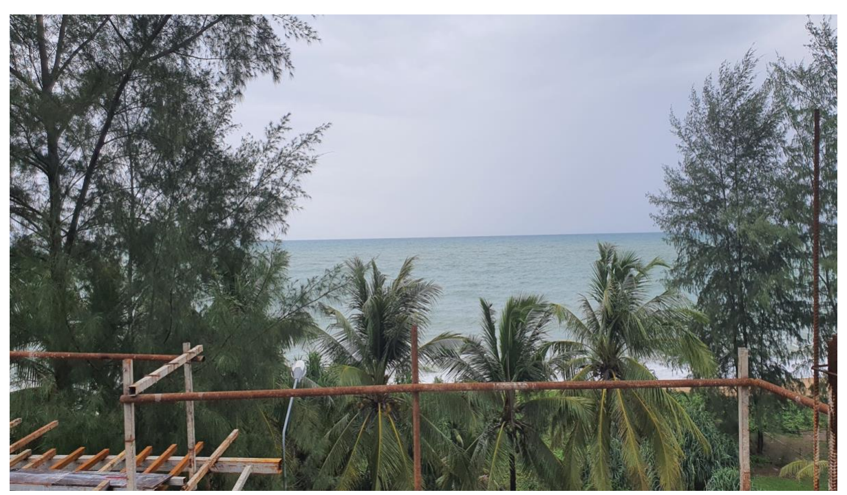
View Building 7 Floor 3 room 7301