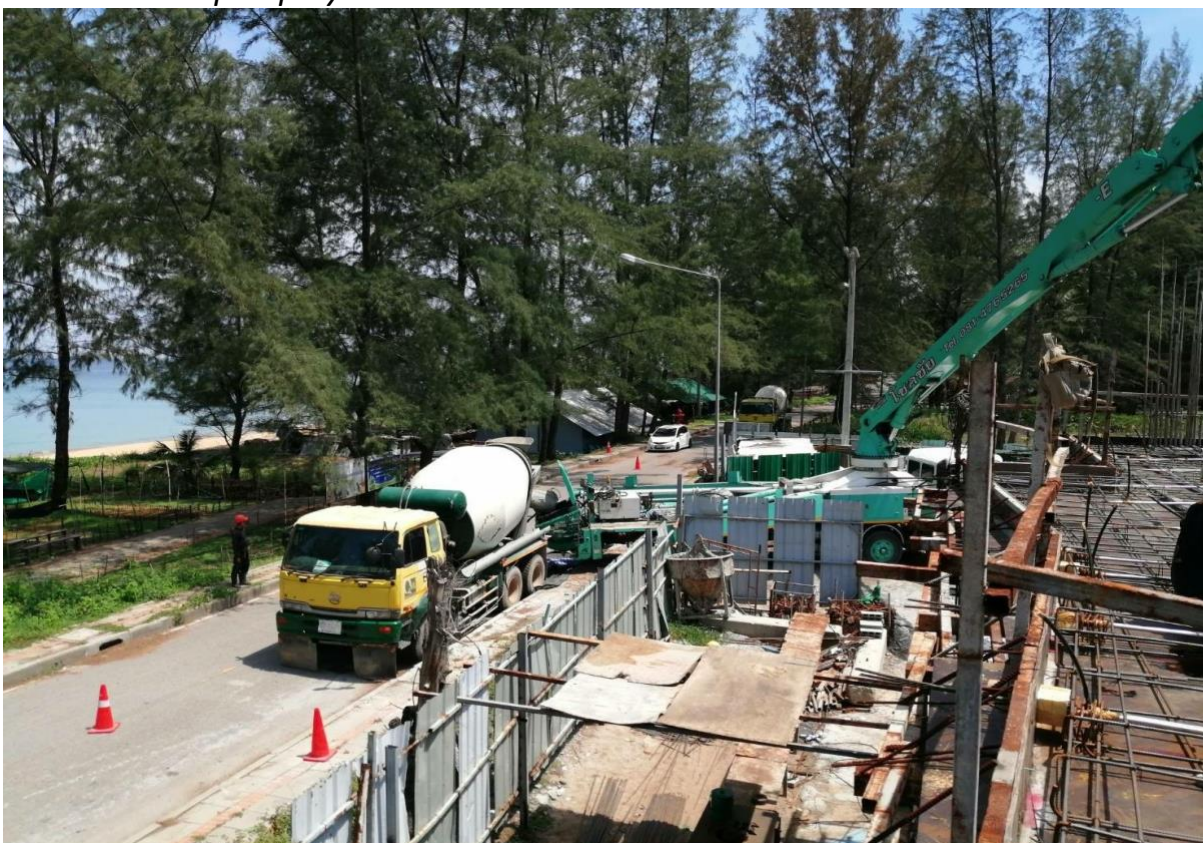
Ready mix arrivals into the concrete pour Building 2-1

Radisson Phuket Mai Khao Beach Construction Progress Report