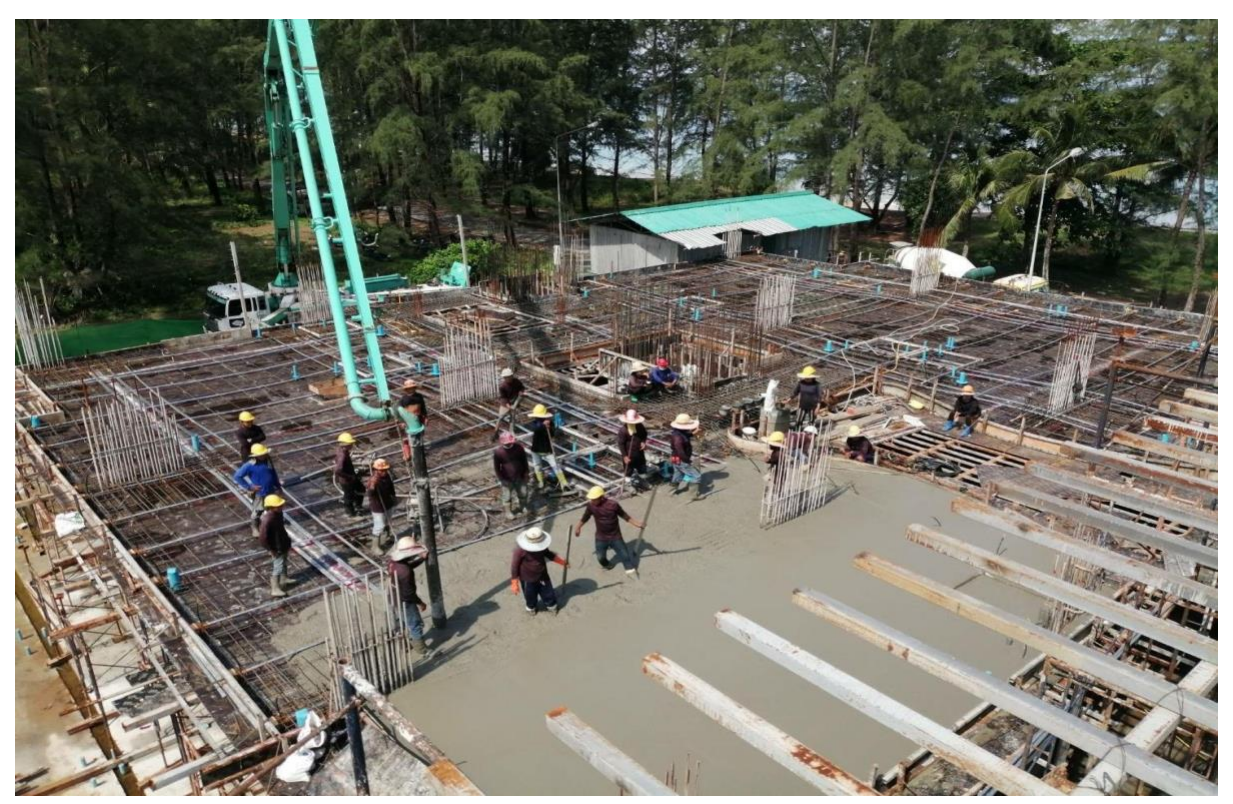
Pouring Concrete Slab 8-1