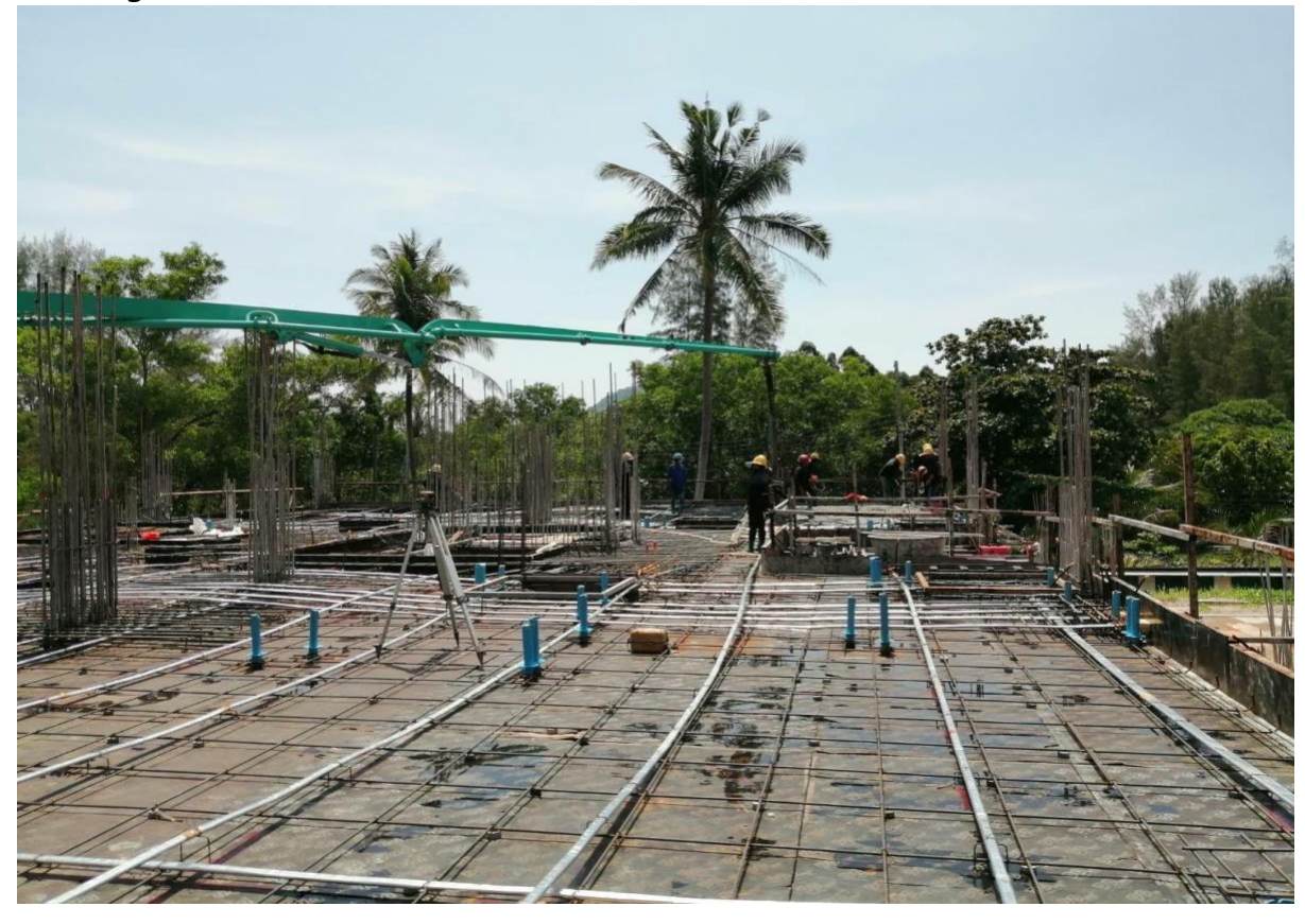
Radisson Phuket Mai Khao Beach Construction Progress Report