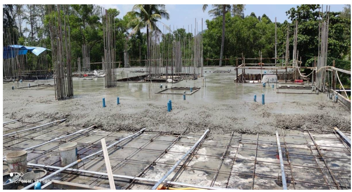
Concrete Pour in progress building 2 floor 1