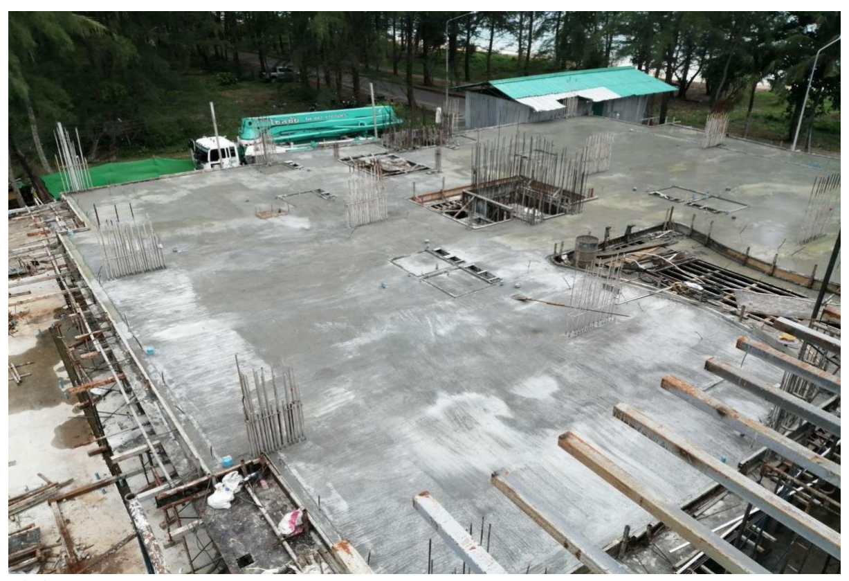
Slab 8-1 Post pour