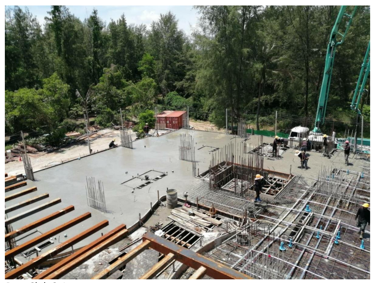
Pour Slab 8-1