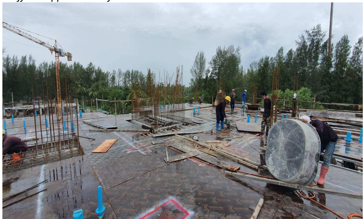
Formwork Building 7 floor 3 – Sleeving installation