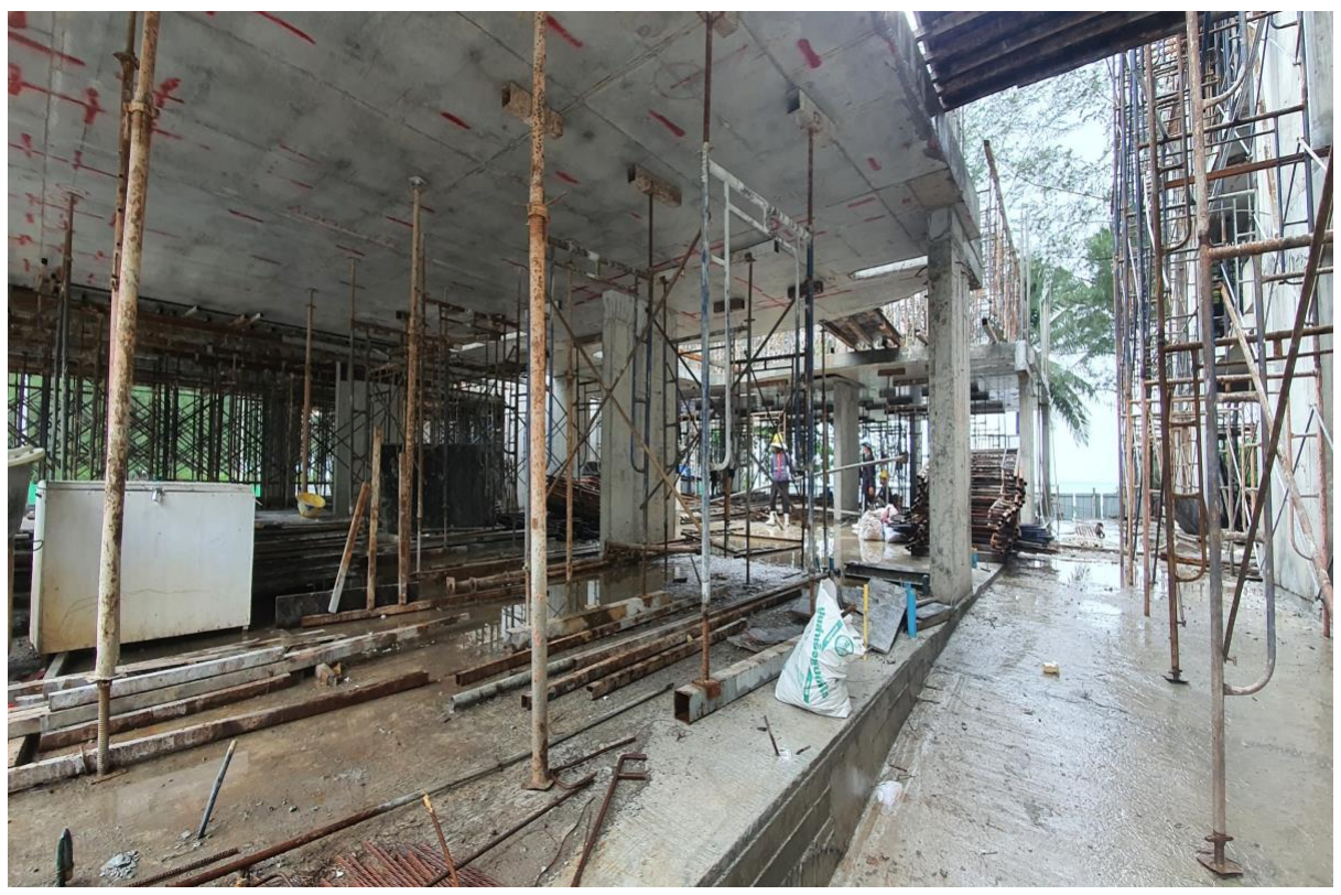
Formwork being removed from underside slab 8-1