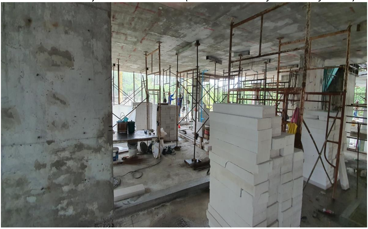
Rooms 7103 looking toward rooms 7102 and 7101