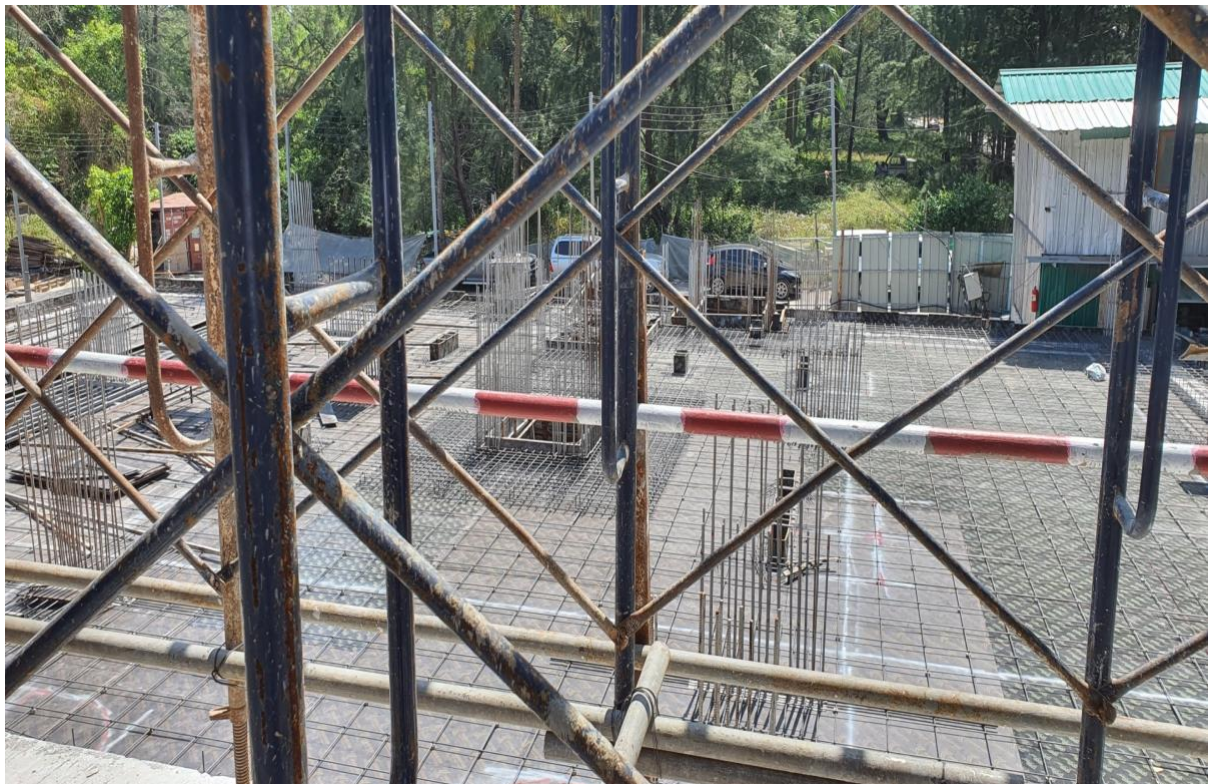
Steelwork Building 8 G Floor Slab