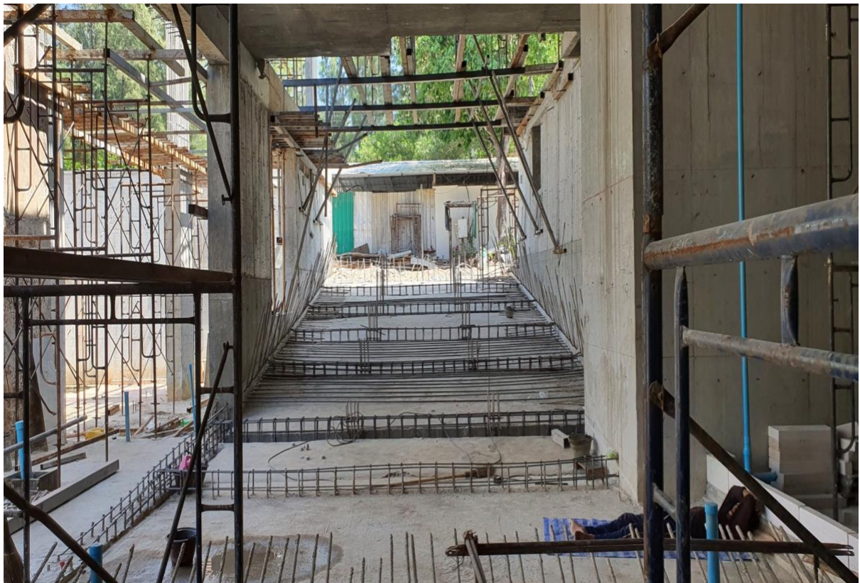
Steelwork Ramp to basement