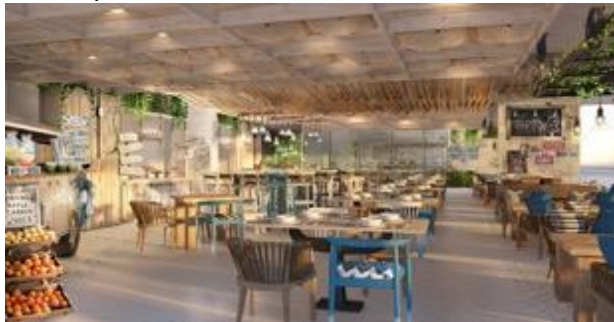
All Day Dining