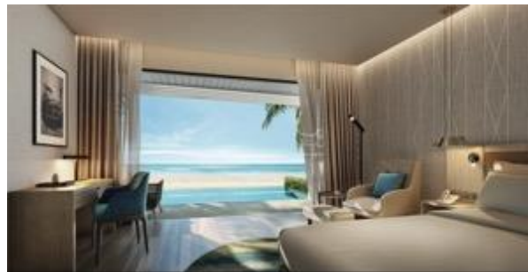
Type D & E

Radisson Phuket Mai Khao Beach Construction Progress Report