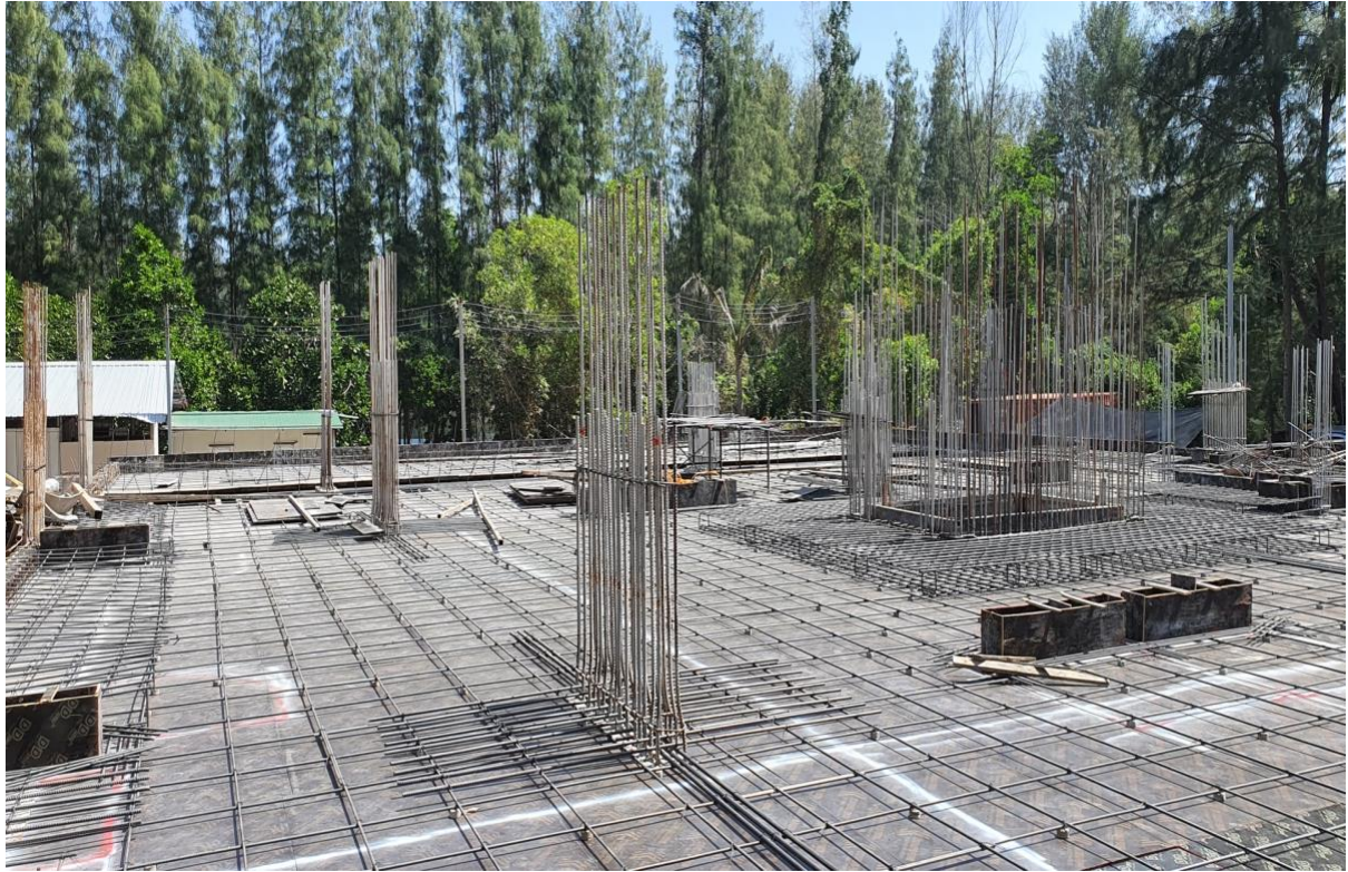
Steelwork Ground slab Building 8