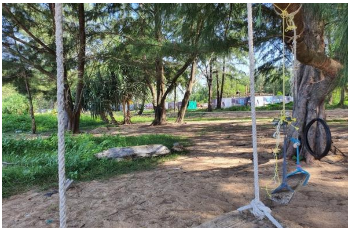
Start of the beach areas opposite the edge of the plot (at building 8 end)

Radisson Phuket Mai Khao Beach Construction Progress Report