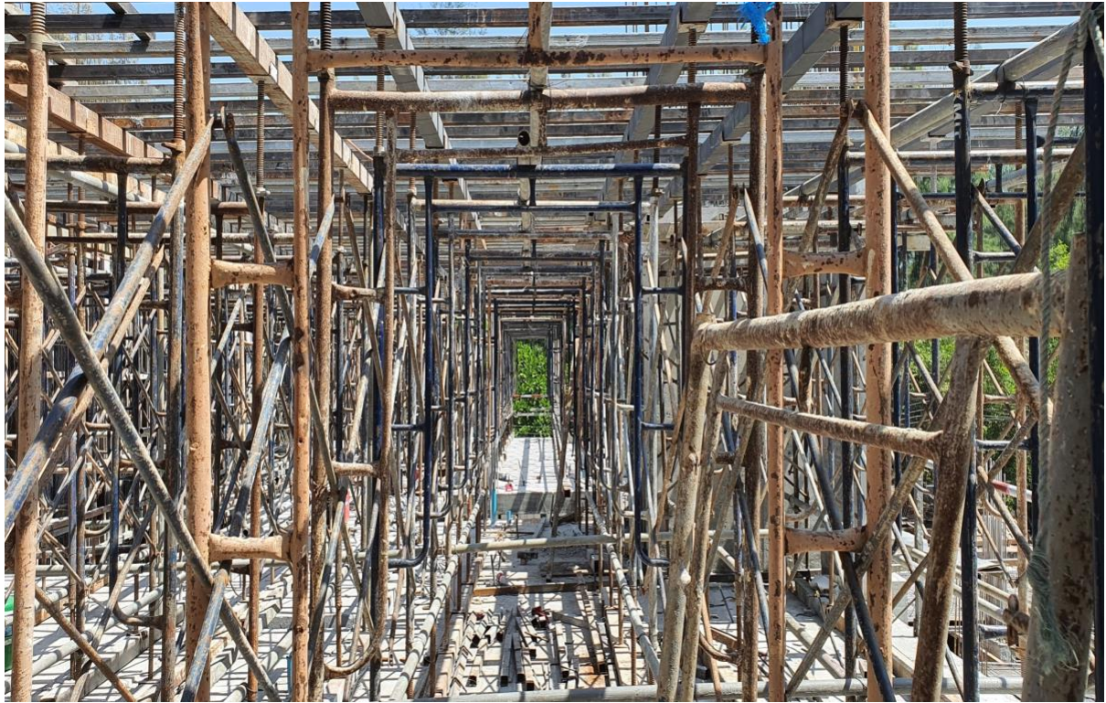
Scaffold support for Formwork slab 2 nd Floor Building 7