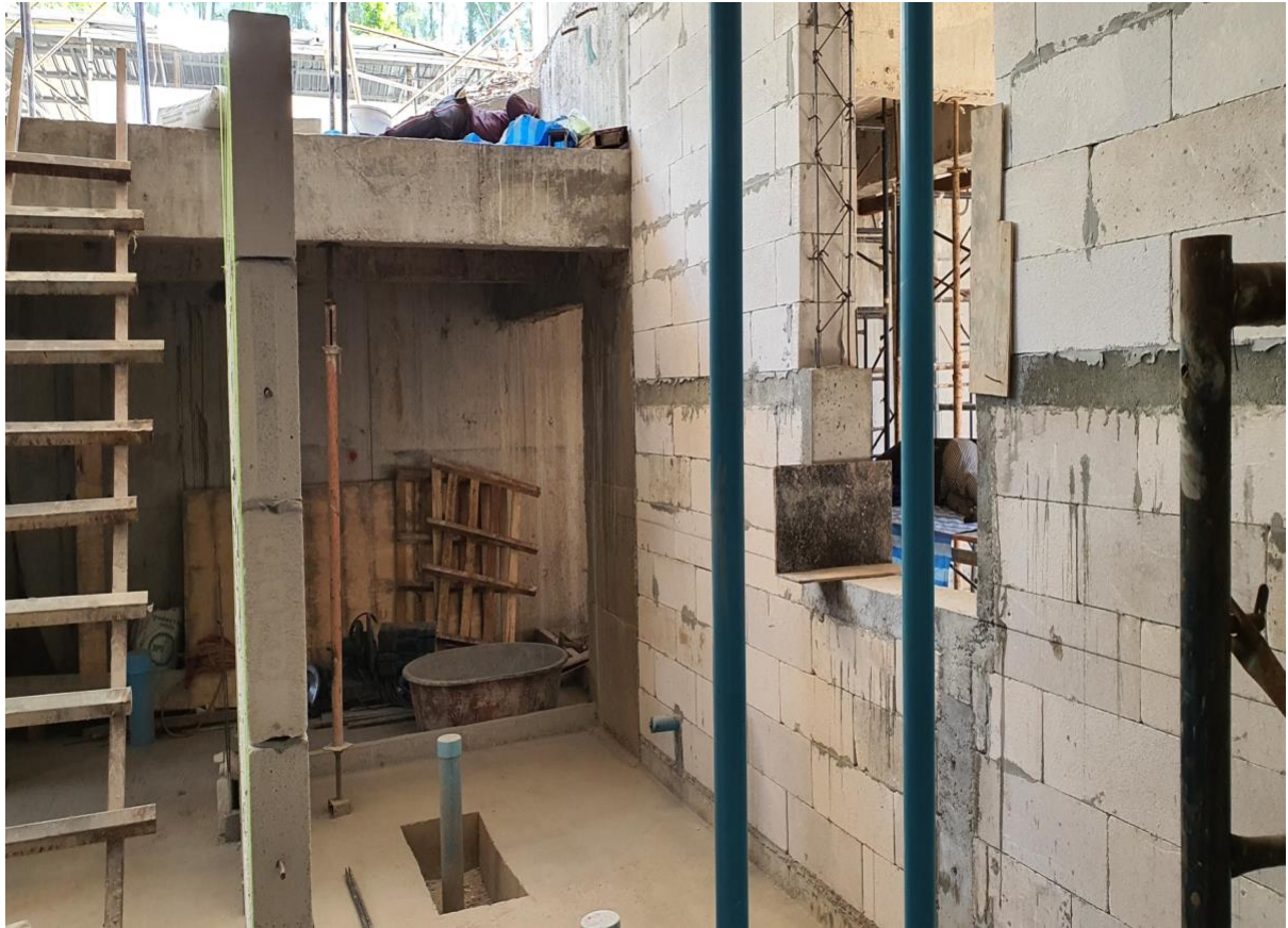
Blockwork in prep kitchen area – area RH side is towards staff canteen