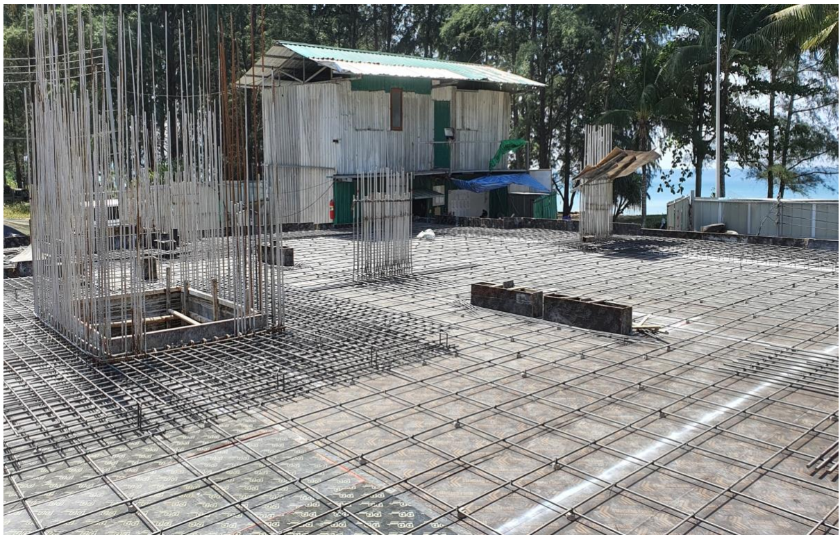
Steelwork Ground floor slab of Building 8

Radisson Phuket Mai Khao Beach Construction Progress Report