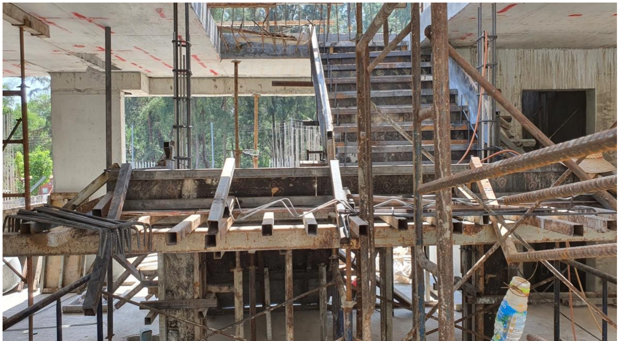
Formwork of Fire Escape stairway Building 7 Ground to 1 st