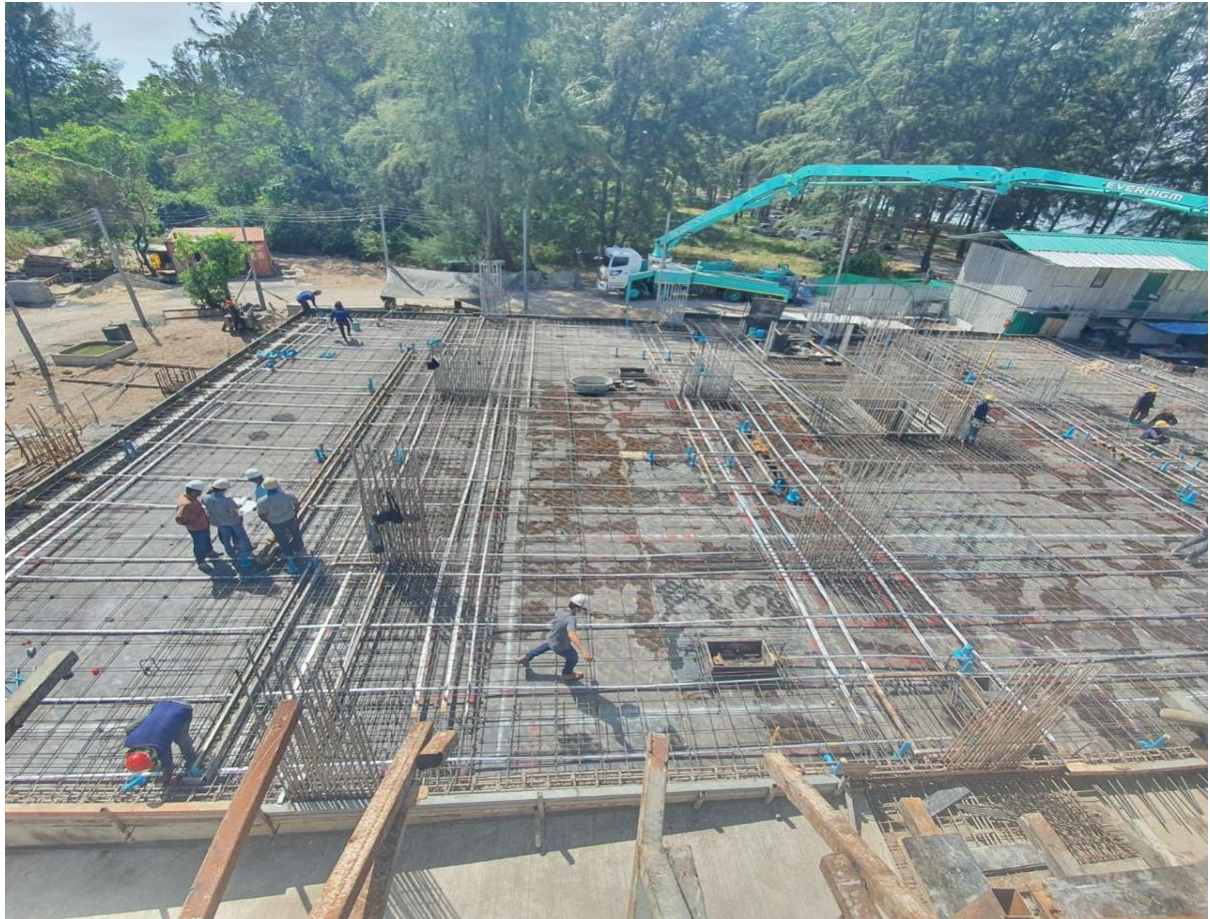
Slab pouring Building 8 G Floor