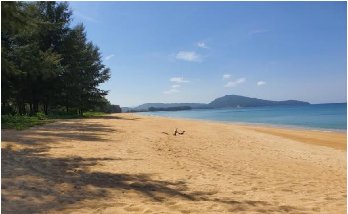
View of the beach, looking to the south