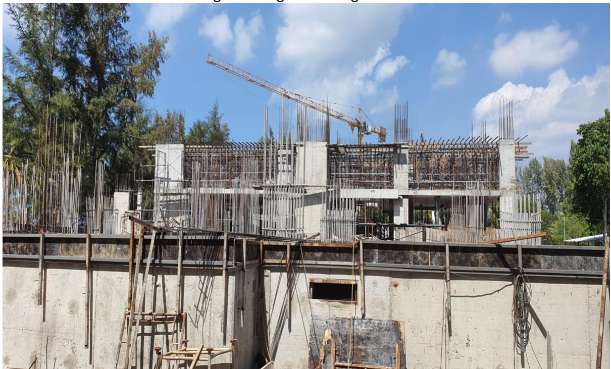
Side Elevation Building 8 looking to Building 7

Radisson Phuket Mai Khao Beach Construction Progress Report