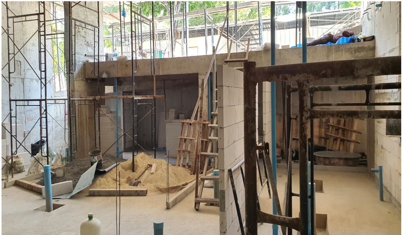
Basement Area blockwork in prep kitchen