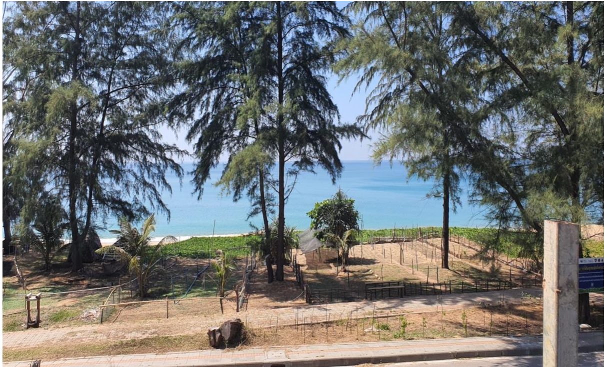
View from 2102/2103