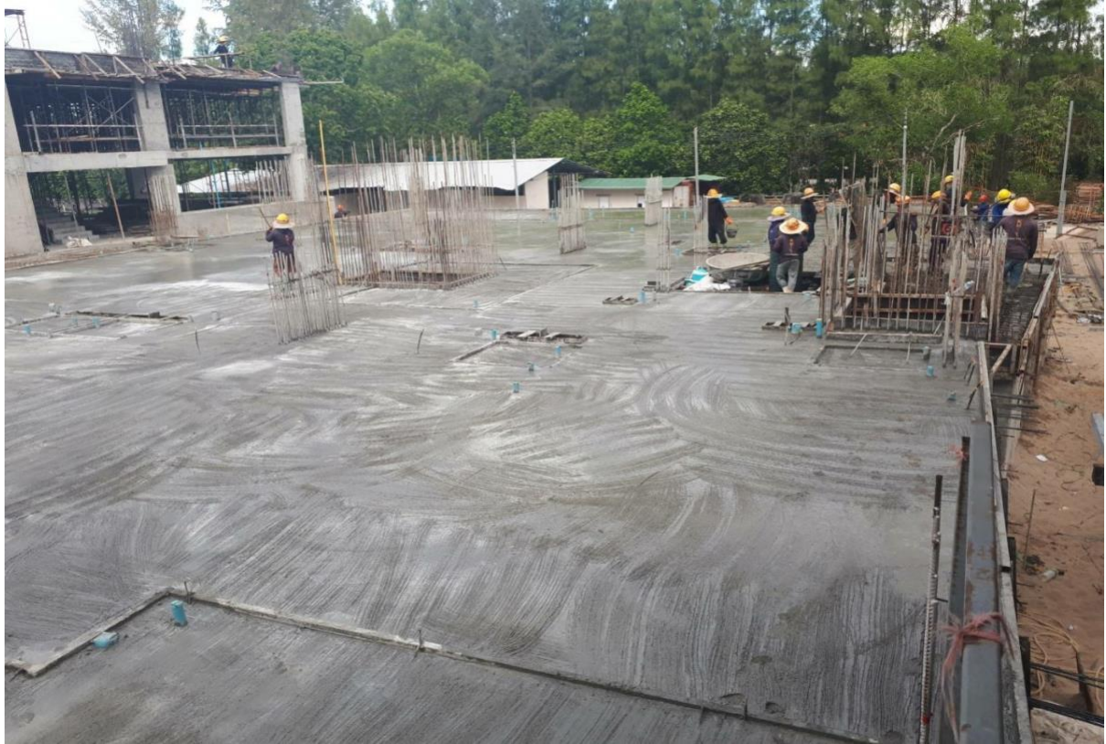
Finishing Pour GF slab Building 8