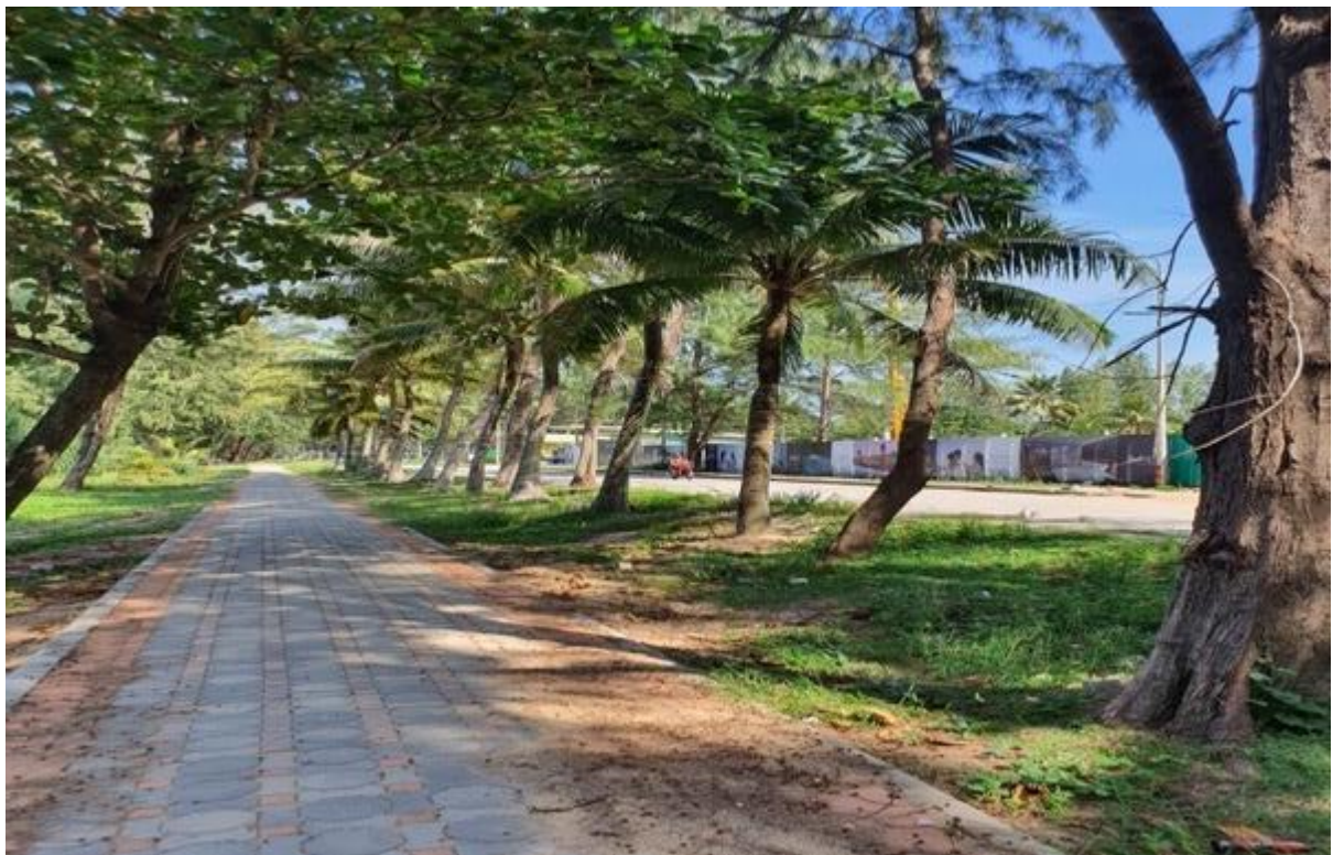
Directly in front of the plot, road and cycle/pathway and to the right onto the beach