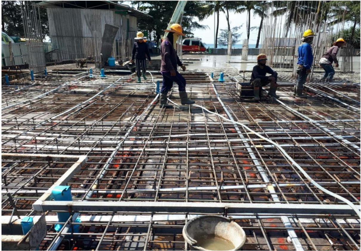
Slab Building 8 on pouring day can see the steelwork and Post tension cabling slings