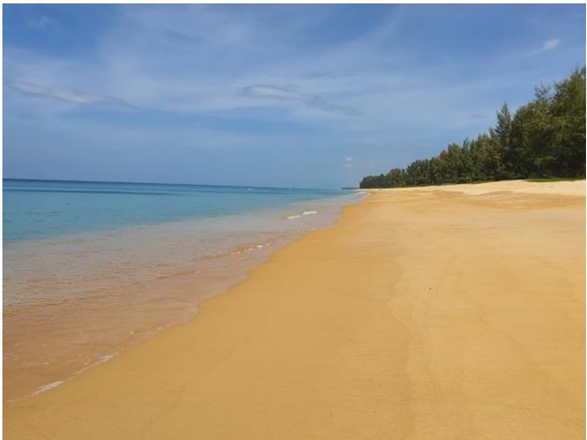
Beach looking to the north

Radisson Phuket Mai Khao Beach Construction Progress Report