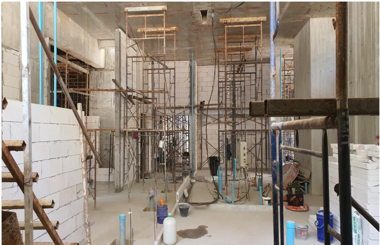
Blockwork Prep Kitchen looking toward doorway to loading dock