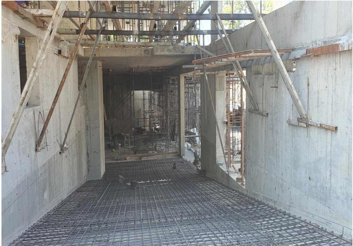
Steelwork Ramp to basement