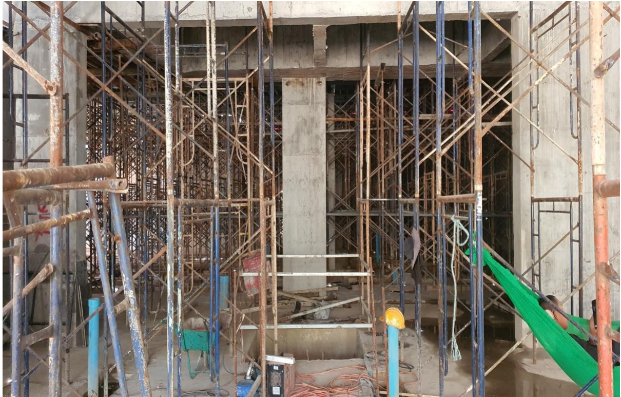
Scaffold support for slab building 8 in area that will be canteen