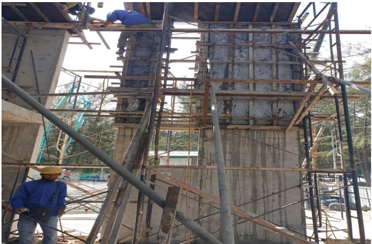
Sheer Wall Building 7 (supports 2 Bedroom penthouse extended terrace)