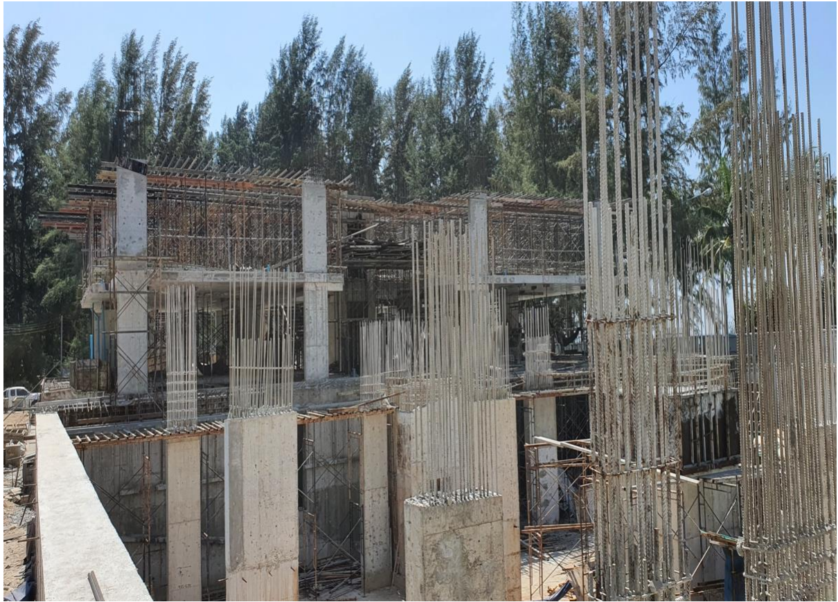
Side elevation view from Building 6 looking to Building 7