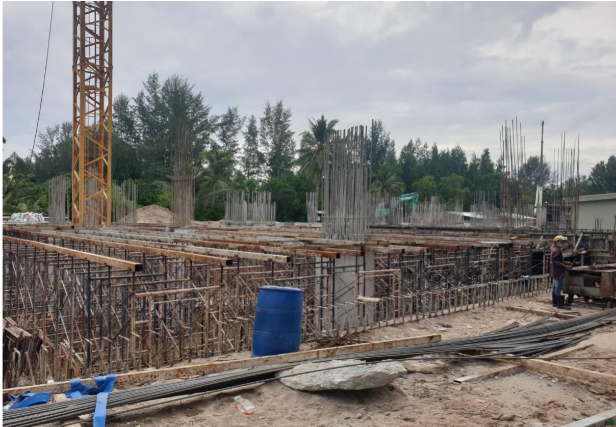
Formwork scaffold support for G floor Building 3