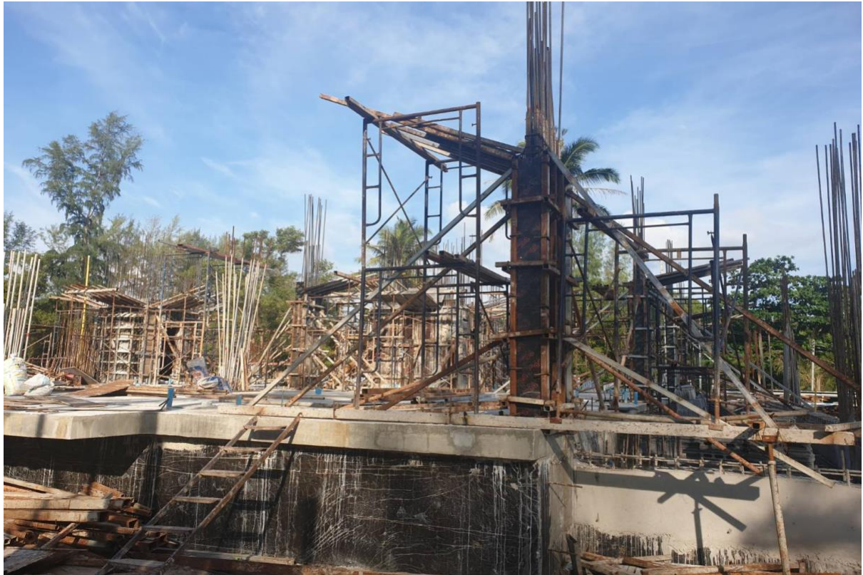
Building 2 GF to 1 st floor Columns