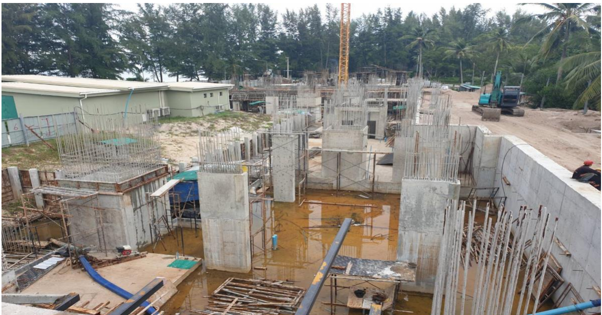
View from Building 7 1 st floor looking toward building 1 end of site

Radisson Phuket Mai Khao Beach Construction Progress Report