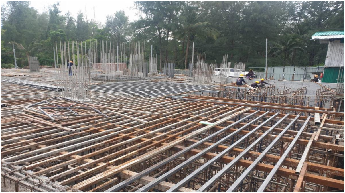
Scaffold and support for building 8 GF slab formwork