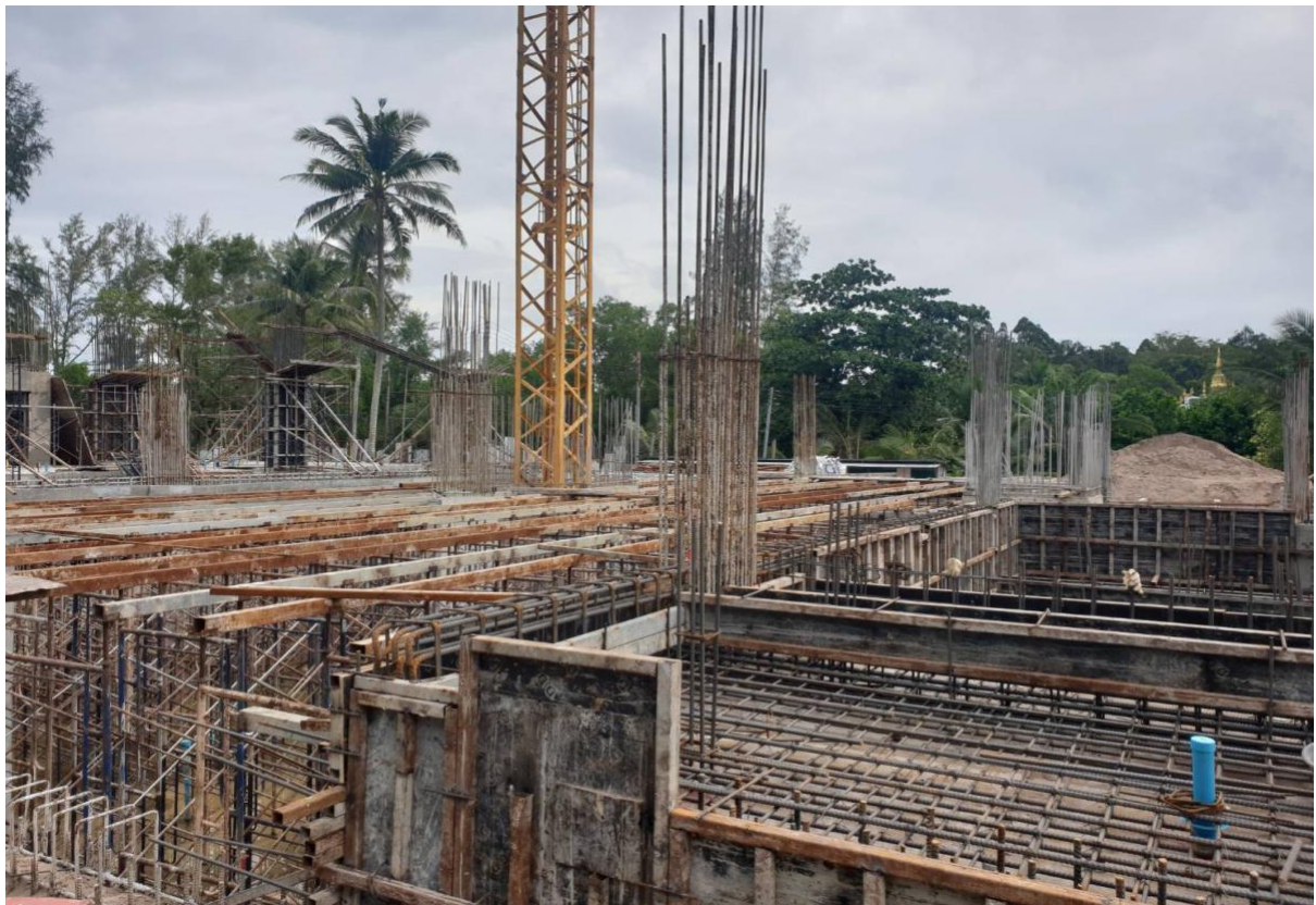
Rear of Building 3-4 planter and scaffold of G floor Building 3

Radisson Phuket Mai Khao Beach Construction Progress Report