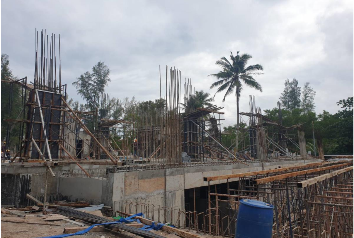
Columns G floor building 2 rising to 1 st floor building 2, scaffold building 3 ready for G floor formwork to right of shot