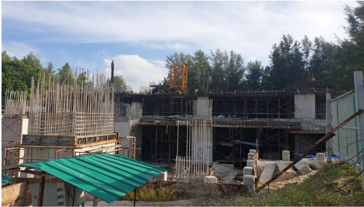
Looking from Building Lobby towards building 7 – Can see Basement 1 st floor and columns G floor to 1 st floor and formwork for 1 st floor slab-