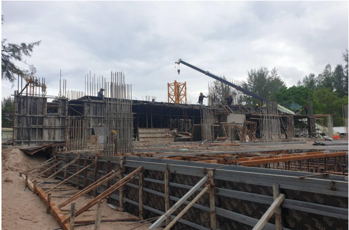
Scaffold support for G floor 8 looking towards building 7 1 st floor