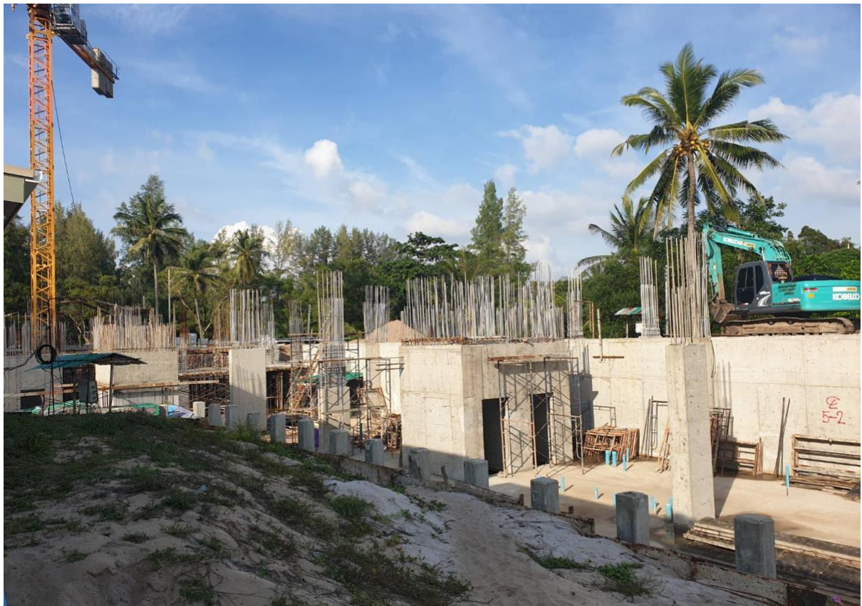
Lift core and columns basement to G Lobby building

Radisson Phuket Mai Khao Beach Construction Progress Report