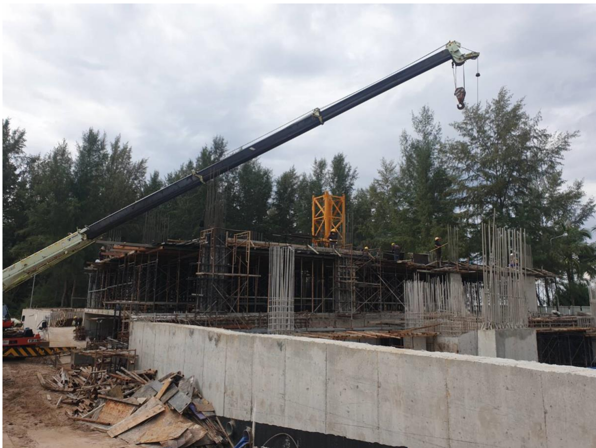
Rear of building 6 looking to Building 7 formwork 1 st floor

Radisson Phuket Mai Khao Beach Construction Progress Report