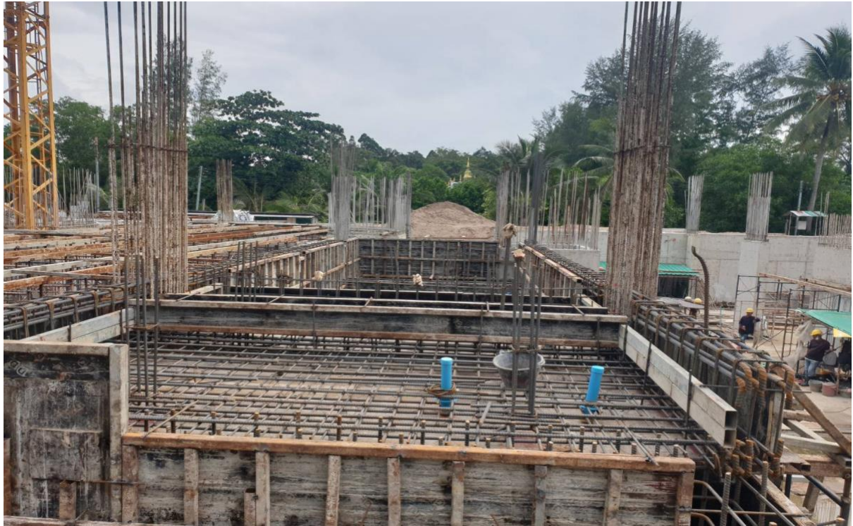
Steelwork and formwork of planters /walkway between 3-4 building @ G floor level ready for concrete