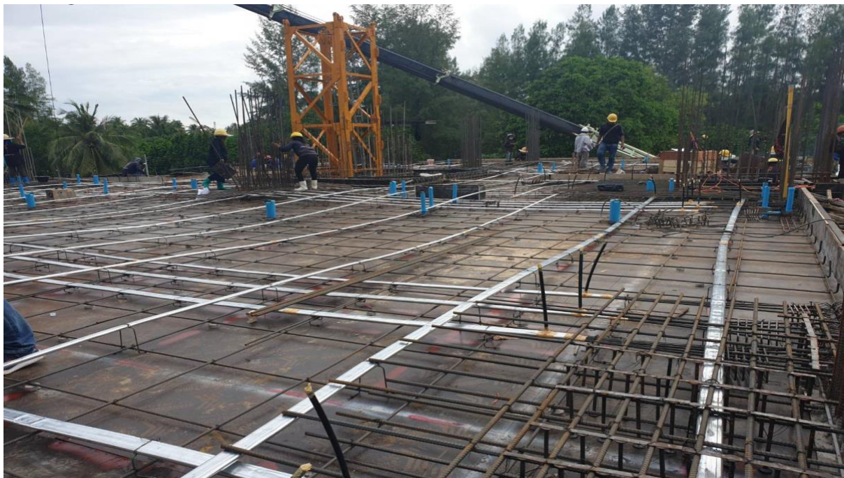
Slab 1 st floor Building 7 including rebar and sling for post tension cable ready for Pour concrete Foreground is unit 7104