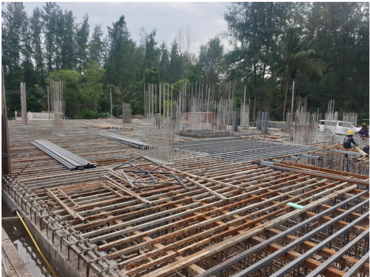
Building 8 Scaffold support for formwork GF slab

Radisson Phuket Mai Khao Beach Construction Progress Report