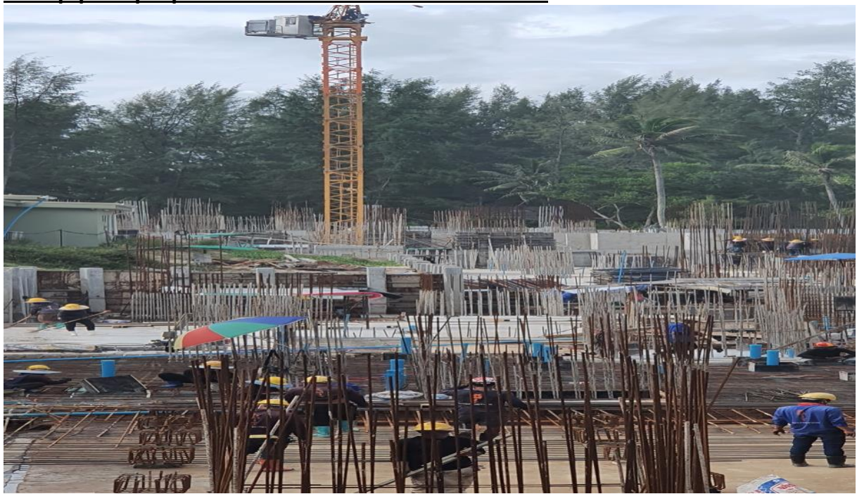
Slab formation work in building 7