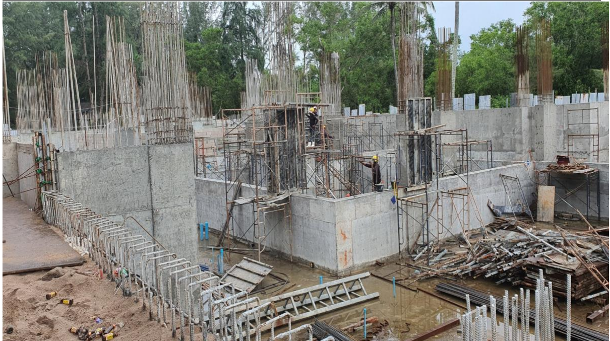
Completing columns around Building 3 area