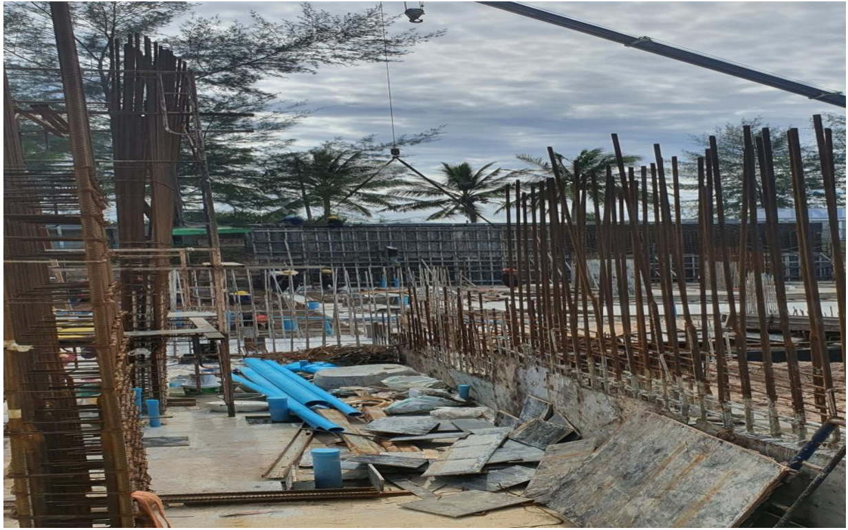
Retaining wall work in background front of building 6 & 7 – area right side of foreground is ramp retaining wall for entry to basement – area centre with blue pipe is preparation kitchen area of the resort