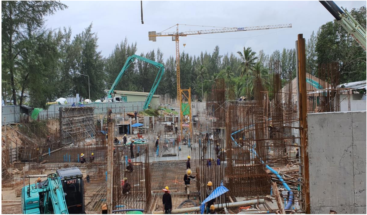
Tower crane finished and start tower crane 2 in foreground, concrete pump operating in slab area building 6/7, slab formwork/steelwork in building 7 & 8 in foreground