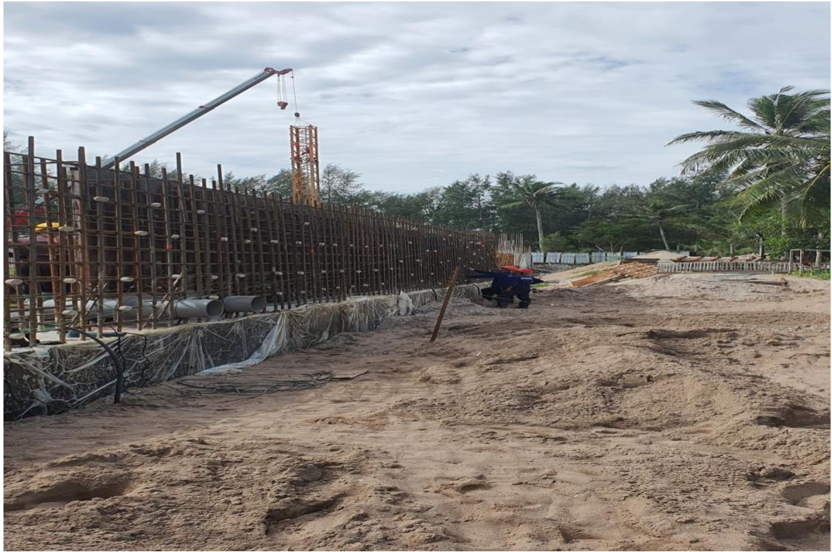
Retaining wall Rear of 6 the soil area will be driveway leading towards drop off of Lobby and turning circle