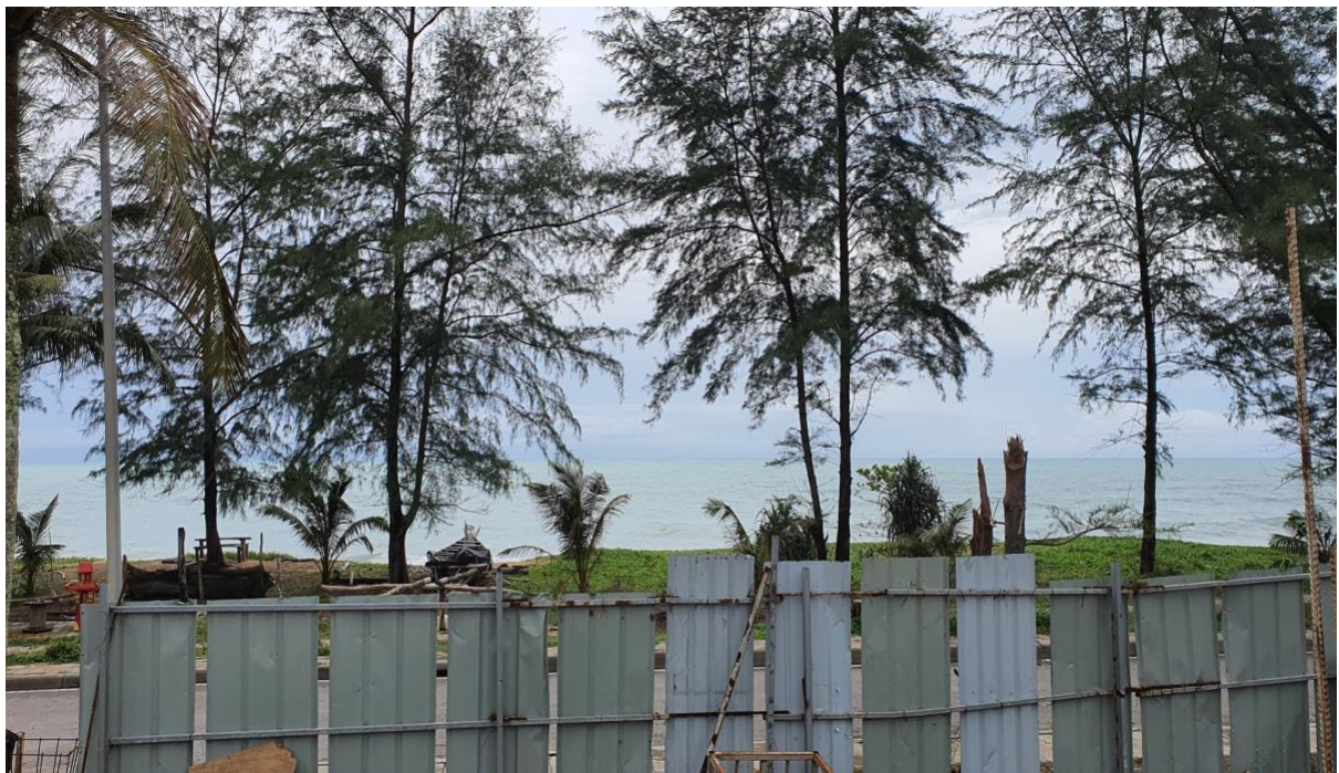
Standing on formwork G floor level Building 2 looking to Sea