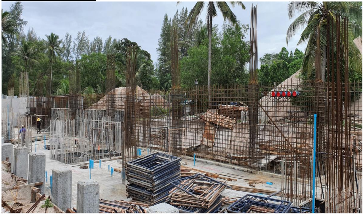
Steelwork for retaining wall Building 5