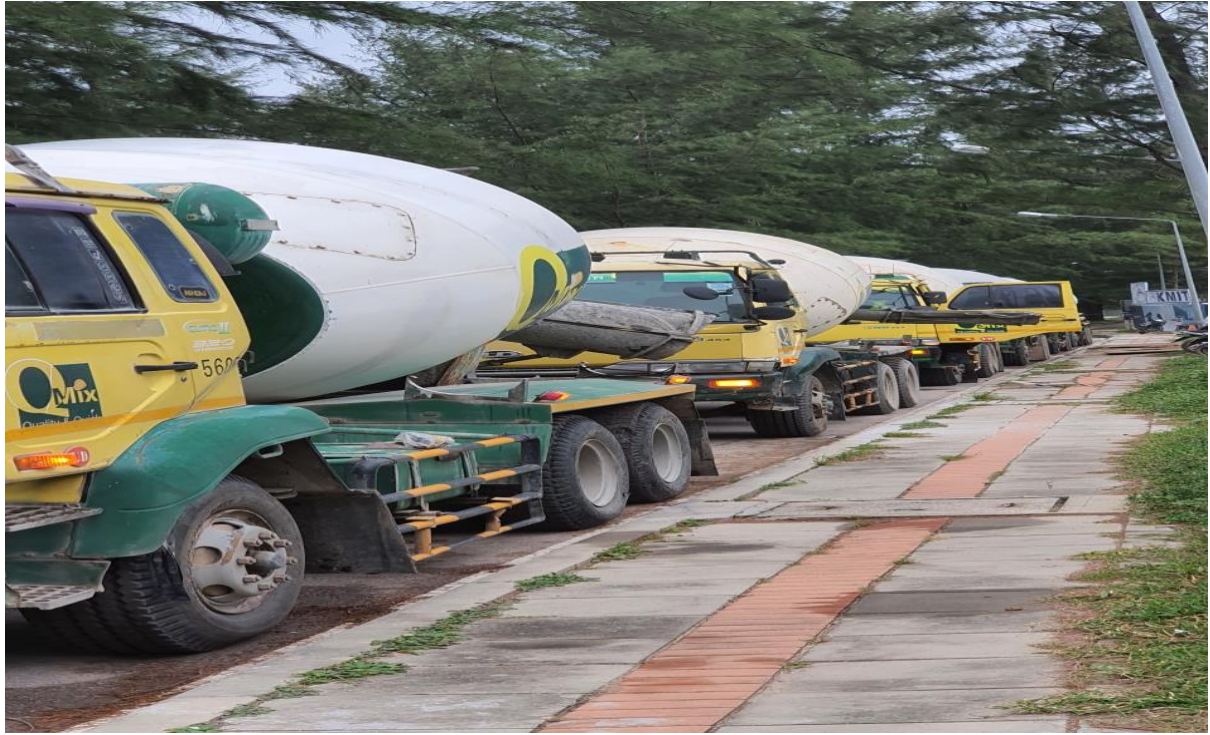
A collective of cement trucks during a pour on Basement slab building 6 area