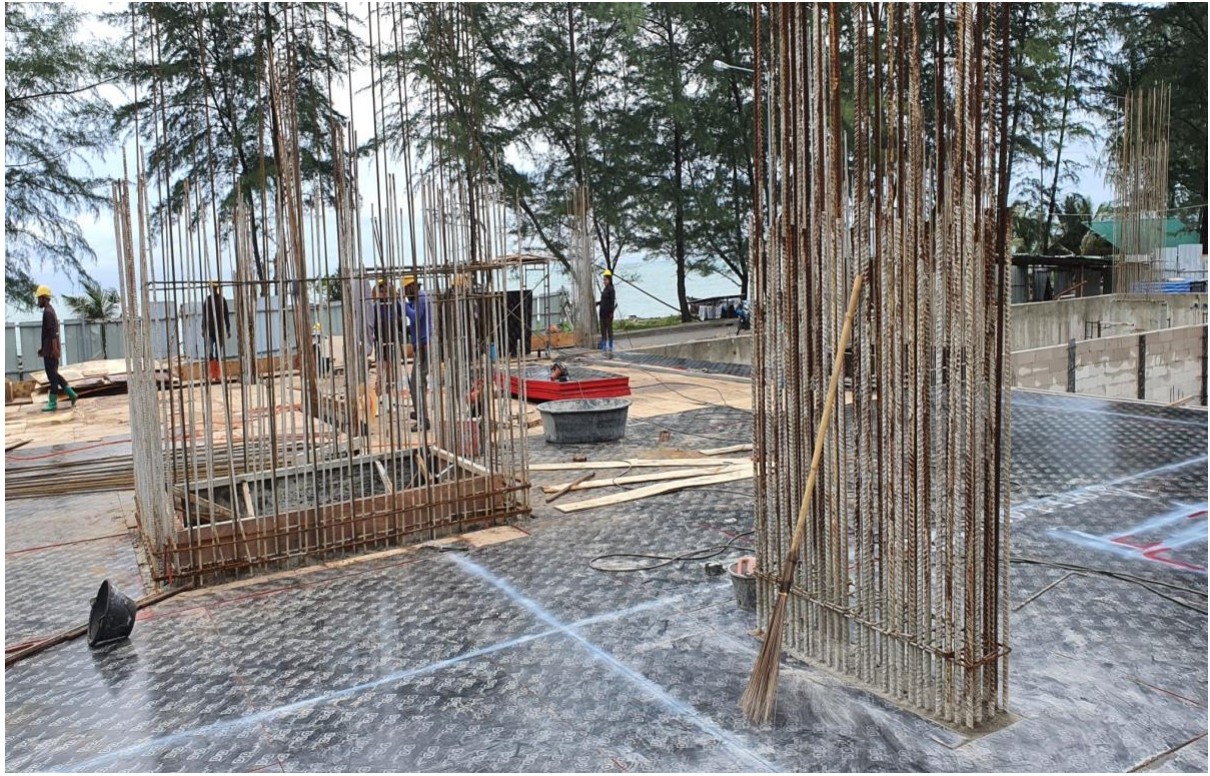
Formwork Base building 2 Ground Floor being laid out ready to receive Steelwork and Post Tension cables