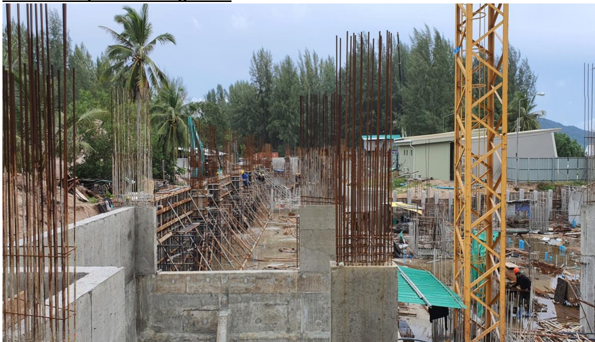
Standing from G floor Building 2 – foreground Left is clean cold water tank, background is retaining wall Housekeeping to generator room ready for pour tomorrow 29 Sept.