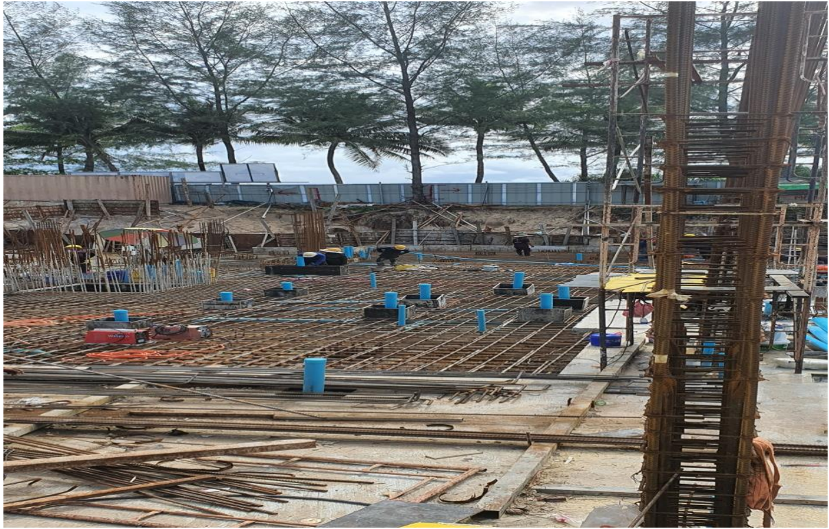
Slab work building 7