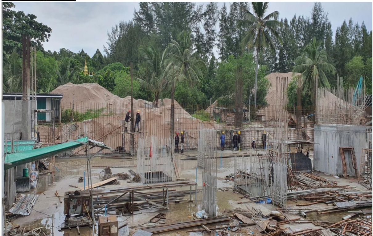
Steelwork retaining wall building 5