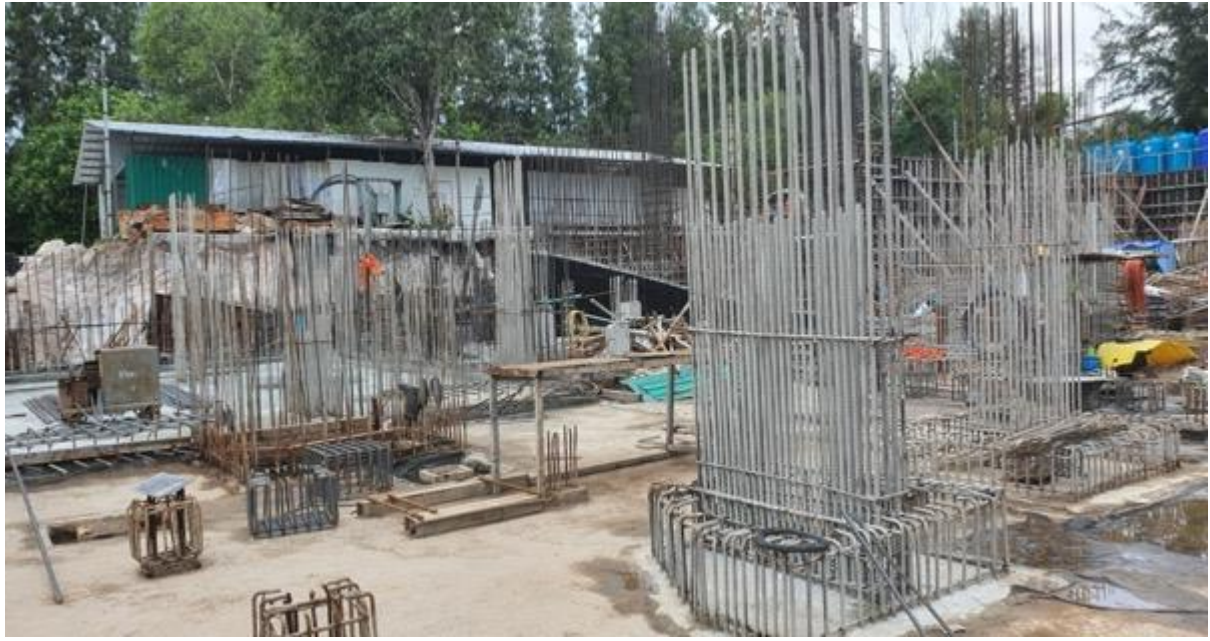
Lien concrete (area between soil and underside of slab) prepared front side of building 6