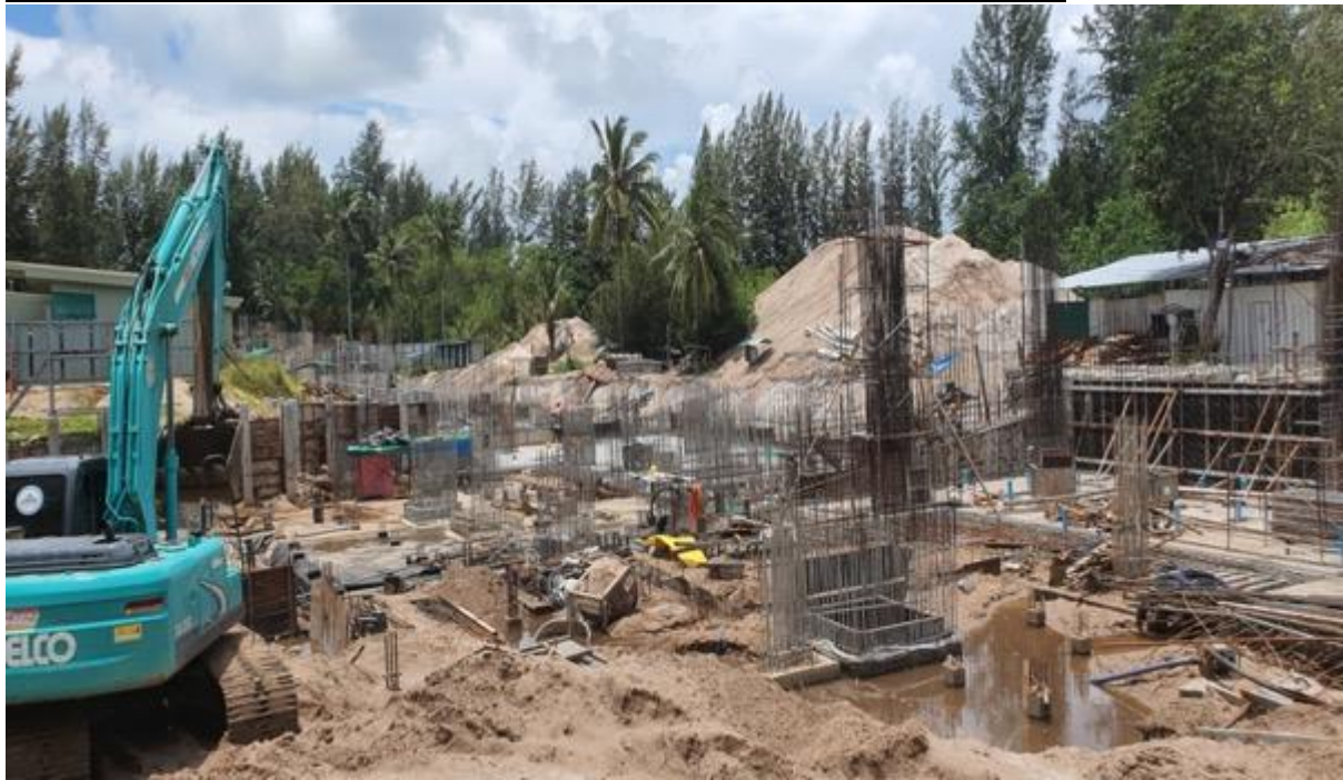
Preparing area front side of building 7 & 8 Slabs ready for Slab formwork – this is the last small pocket affected by the natural water table as seen in bottom right corner, once this is completed the basement area will be unaffected by groundwater