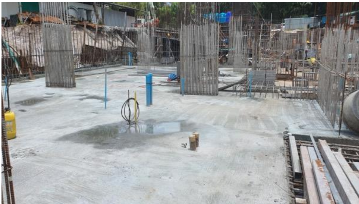
Slab building 6 generator and transformer general area – looking towards building 7 & 8 area