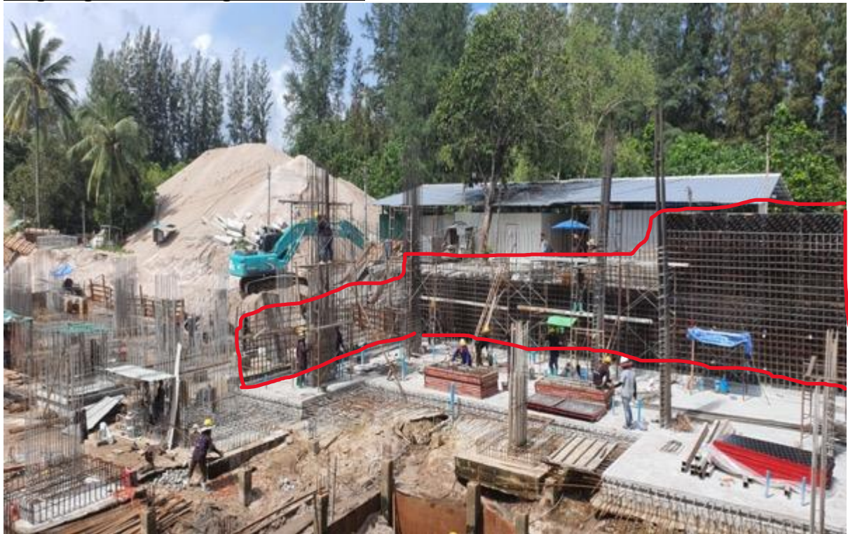
Preparing retaining walls formwork and steel rear building 7 & 8 (Red)