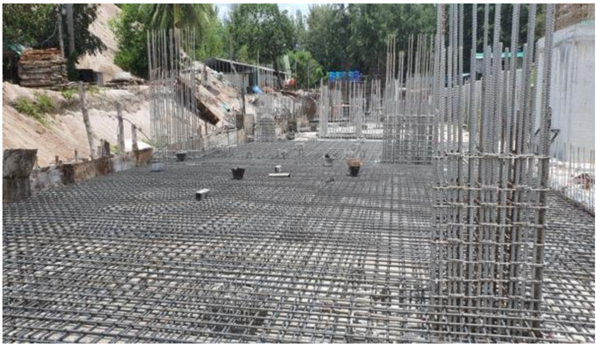
Steel work ready prior to a pouring of slab general area building 5/6