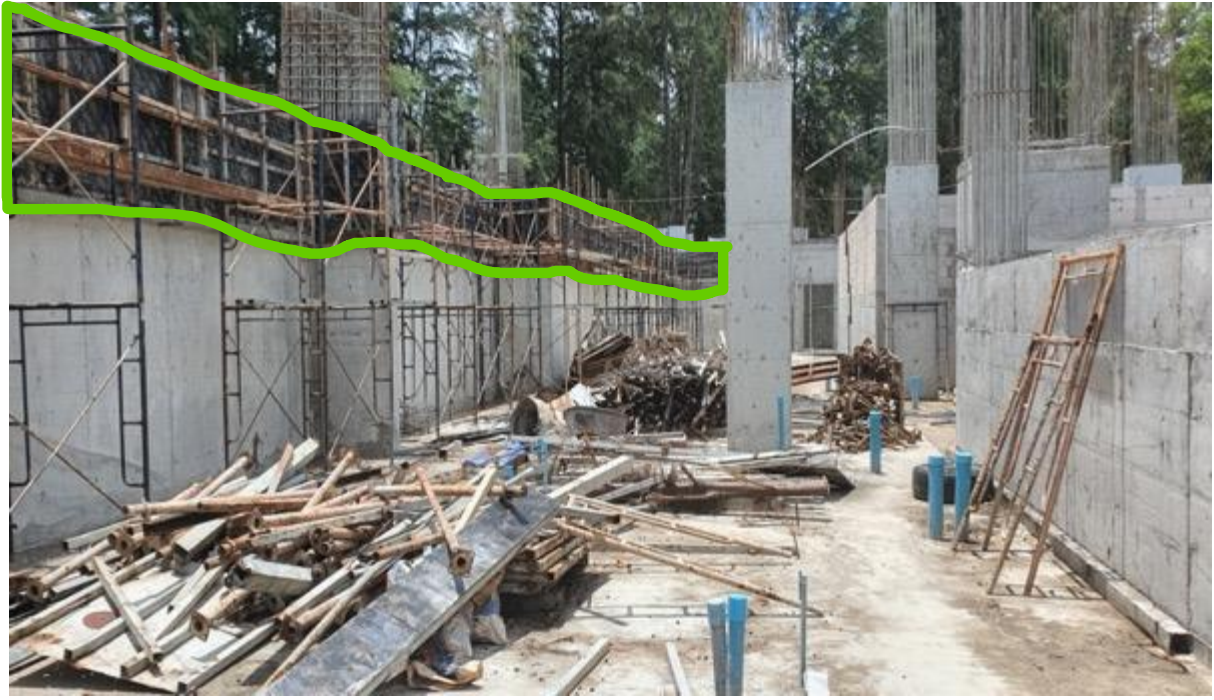
General area building 3 looking towards 2 and 1 – note columns poured to GF level and green cloud area is formwork retaining wall going up from current level to GF level