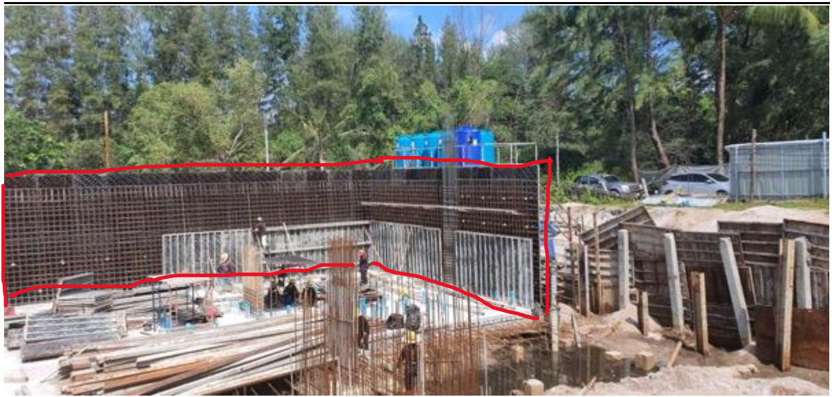
Preparing formwork and steel rear of building 7 & 8 retaining walls (red) note height of pour was approximately 4M – scale is provided by workers size