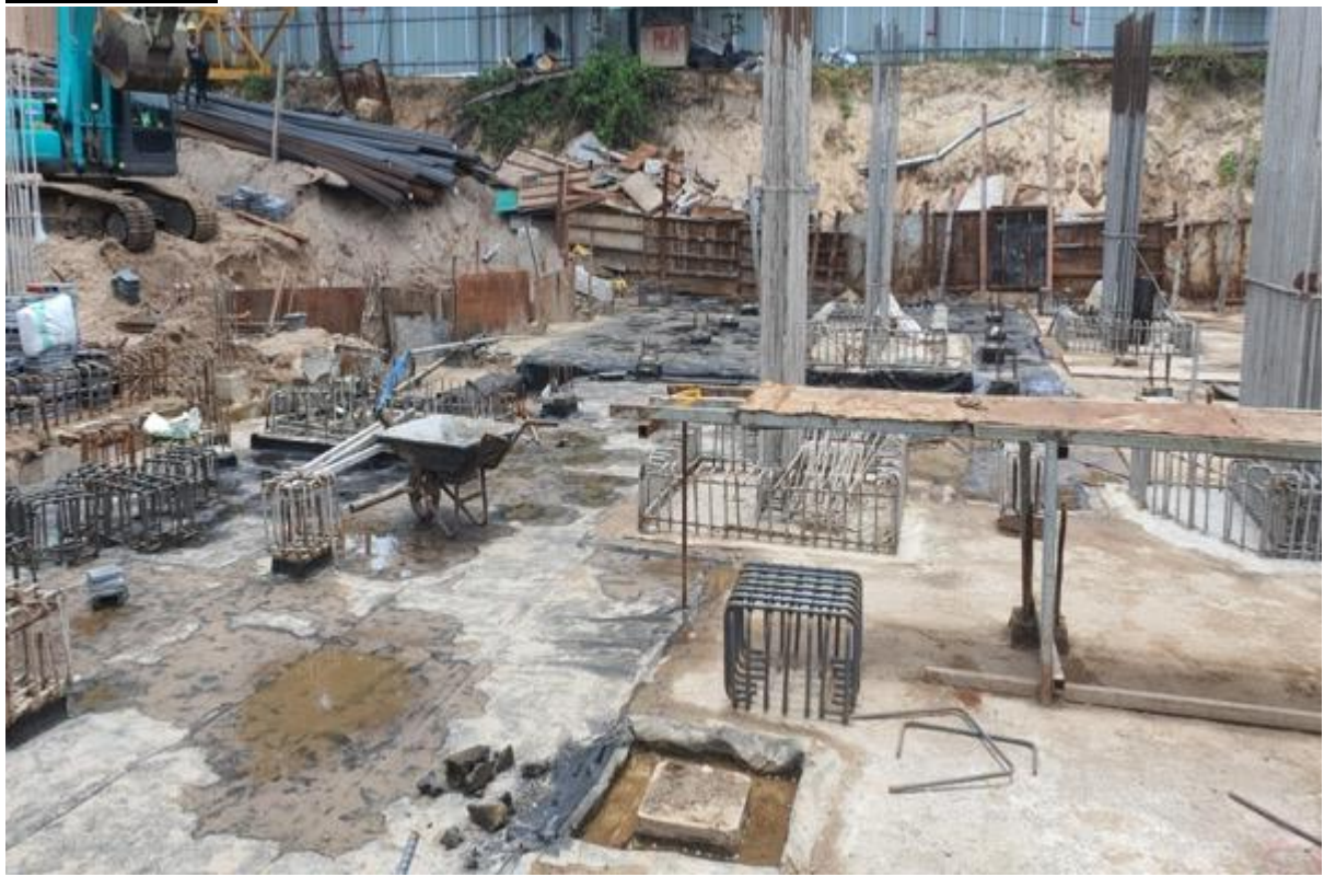
Lien concrete and waterproof membrane being applied vicinity front side of building 6 /7 once membrane is finished the steelwork for the slab will be laid ready for pouring slab