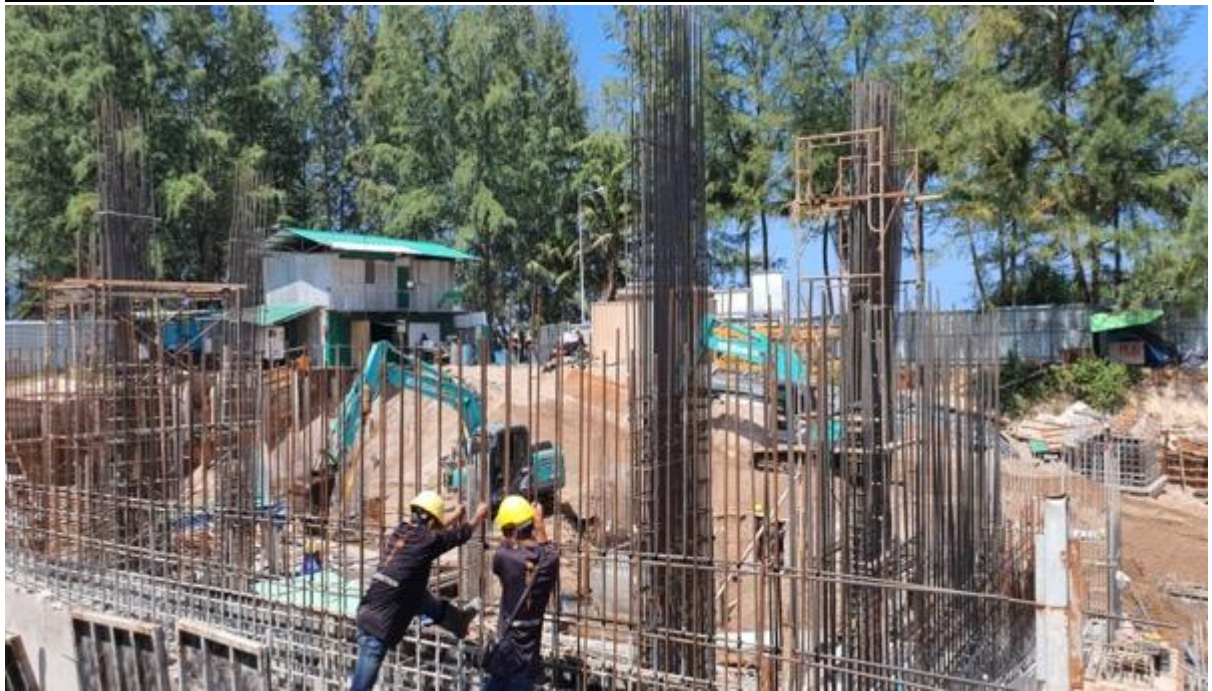
Removing formwork from the retaining wall in building 7& 8 Zone – rear of prep kitchen and staff canteen

The yellow area is the ramp area giving entry for vehicles to the basement