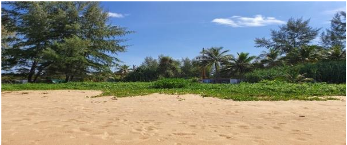
From the beach looking East, back to the project