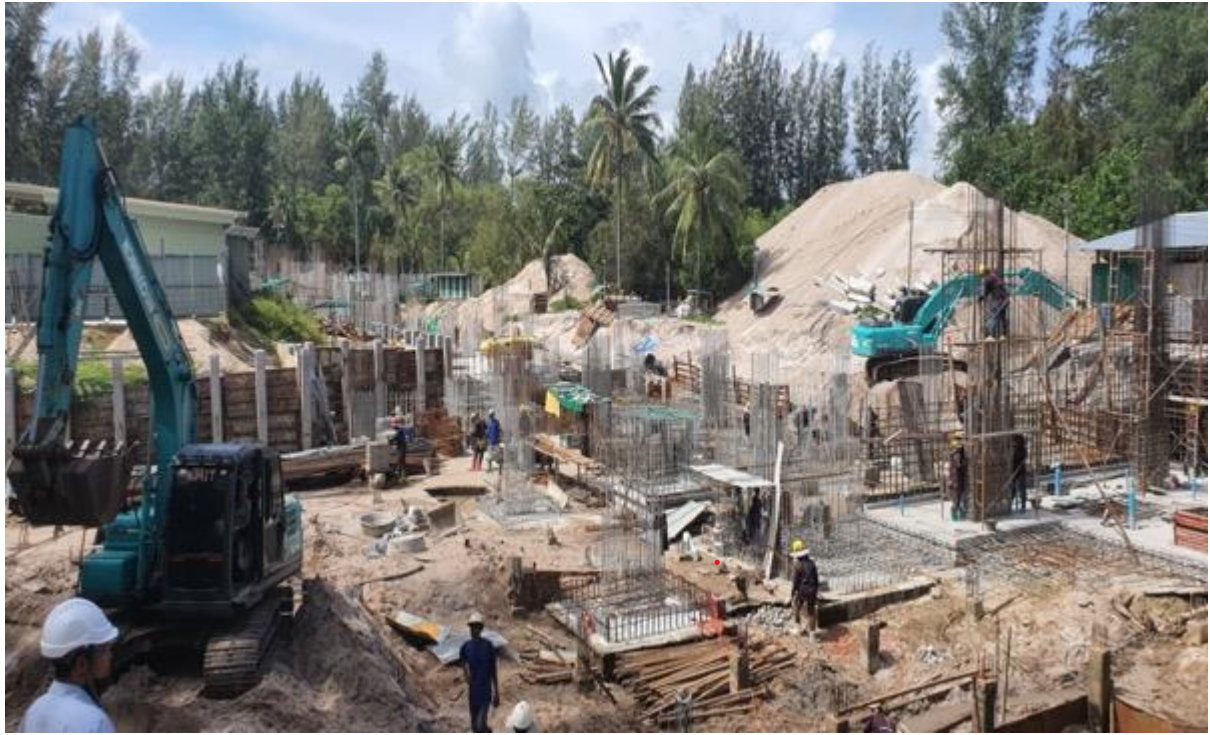
Ongoing works in region of 6/7/8