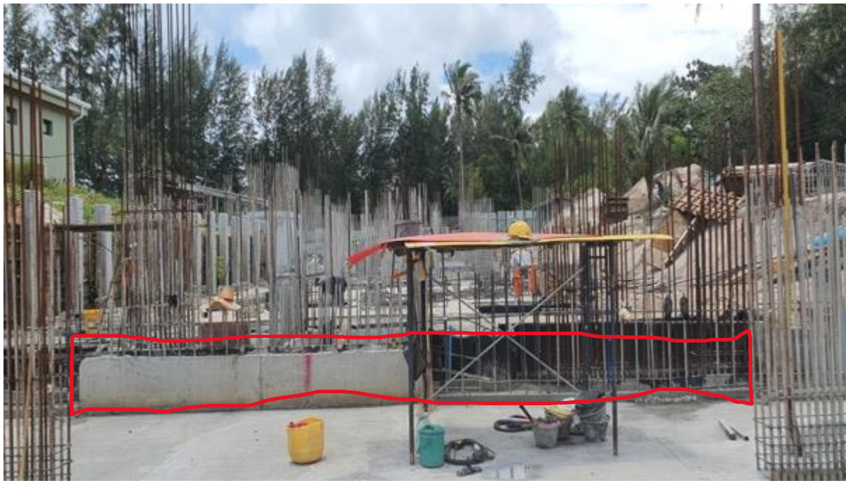
Slab of Building 6 (generator /transformer area) looking towards building 5 and beyond – note the step (red cloud) as the transformer and generator are at lower level in order to give good overhead clearance and space to this essential equipment