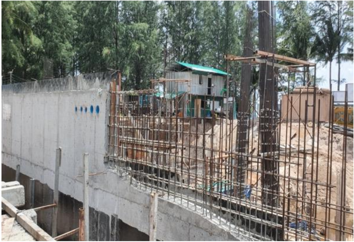
Retaining wall at rear of building 7 & 8 with waterproof (black) up to access road level – steelwork of columns can be seen in prep kitchen area