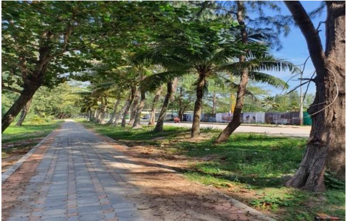
Directly in front of the plot, road and cycle/pathway and to the right onto the beach