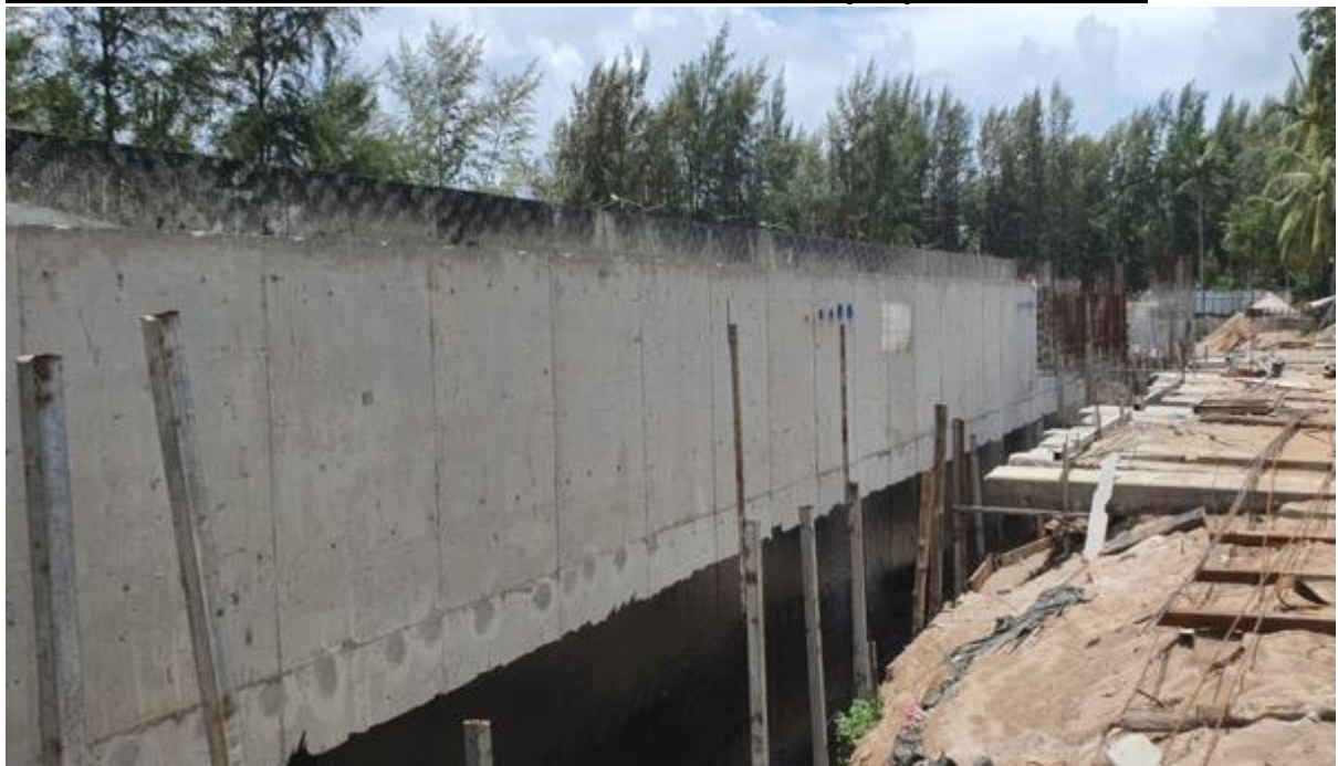
Retaining wall rear of 7& 8 (scale is wall height is 4M high, again waterproof to road level can be seen being applied to wall, once cured the soil can be backfilled up to the wall