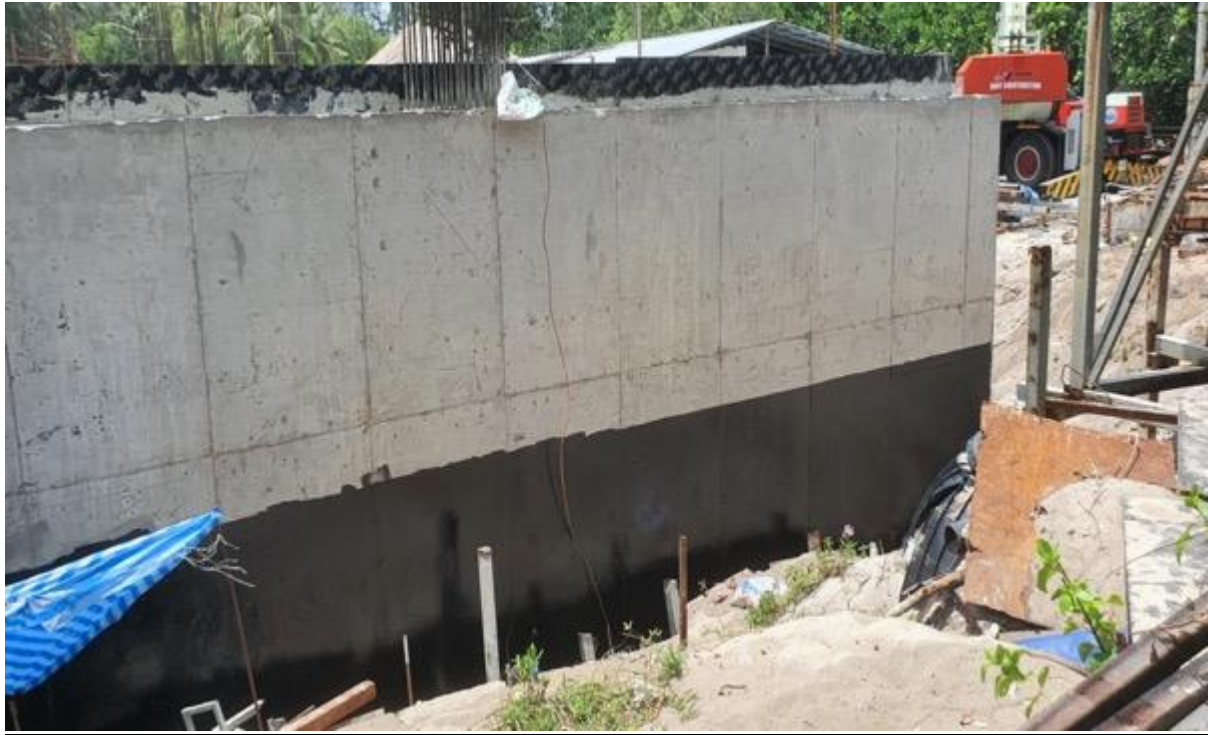
Retaining wall side of building 8, waterproofing being applied