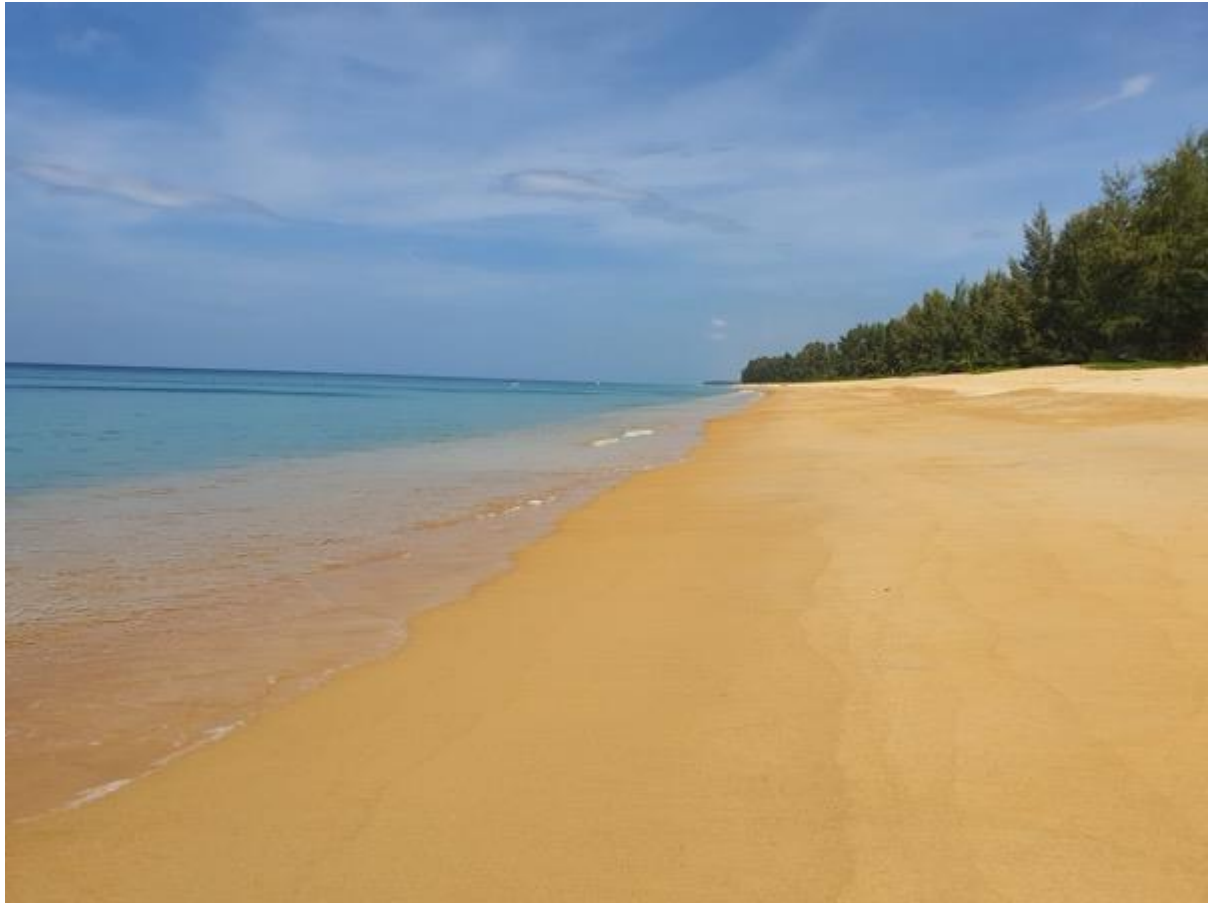
Beach looking to the north