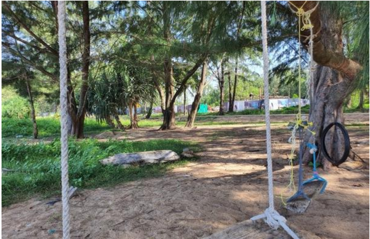
Start of the beach areas opposite the edge of the plot (at building 8 end)