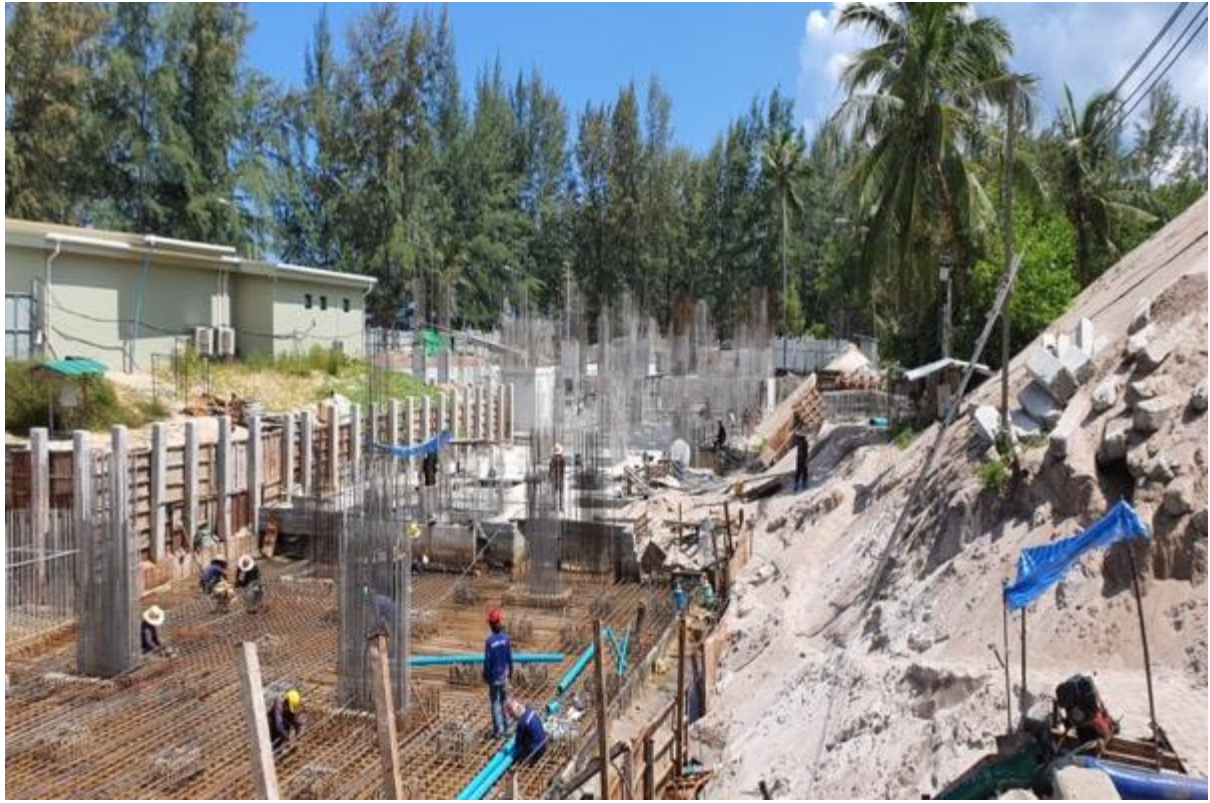
Slab building 6 being prepared with piping and steelwork