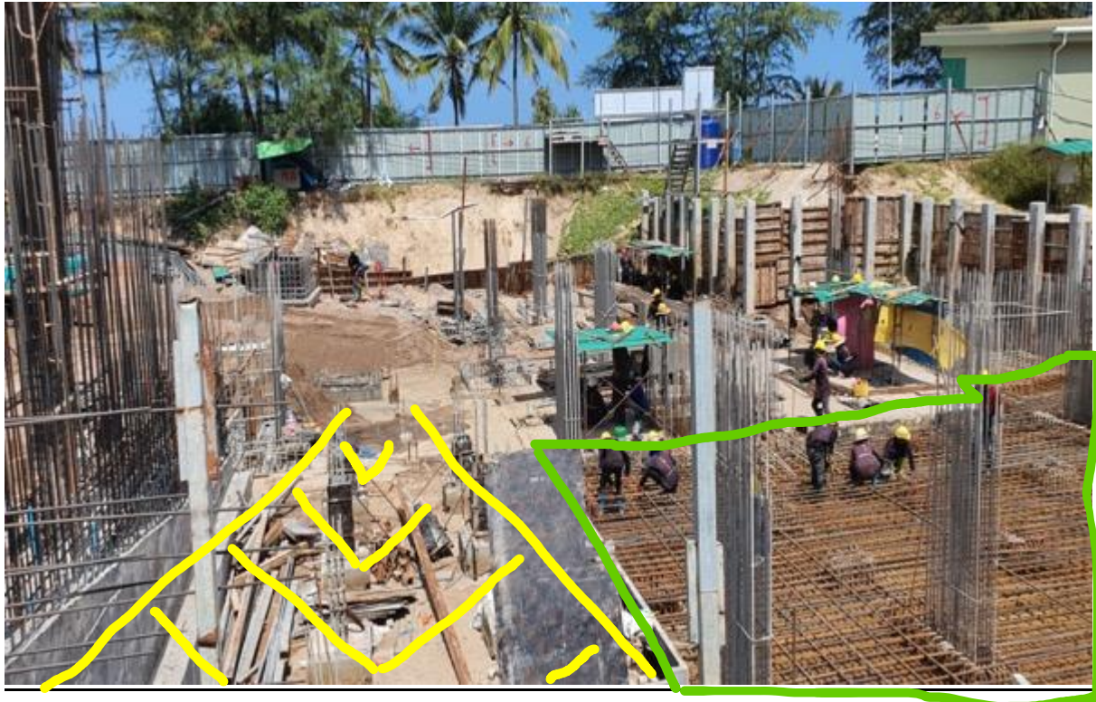
Preparing slab generator room (green cloud)

The yellow area is the ramp area giving entry for vehicles to the basement