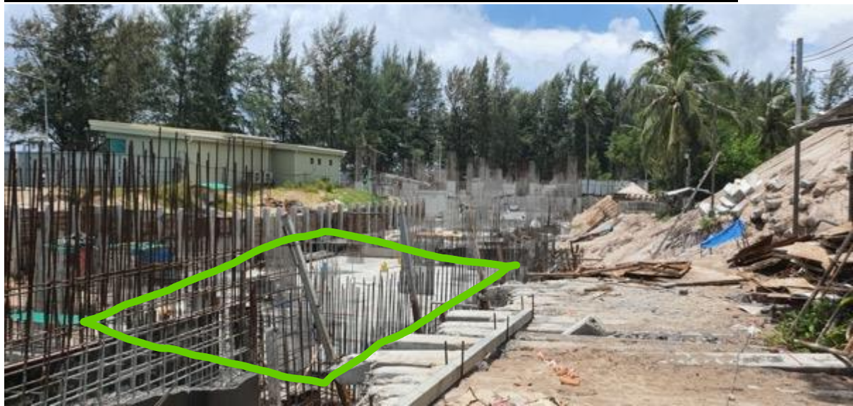
Slab area transformer and generator room building 6 rear side