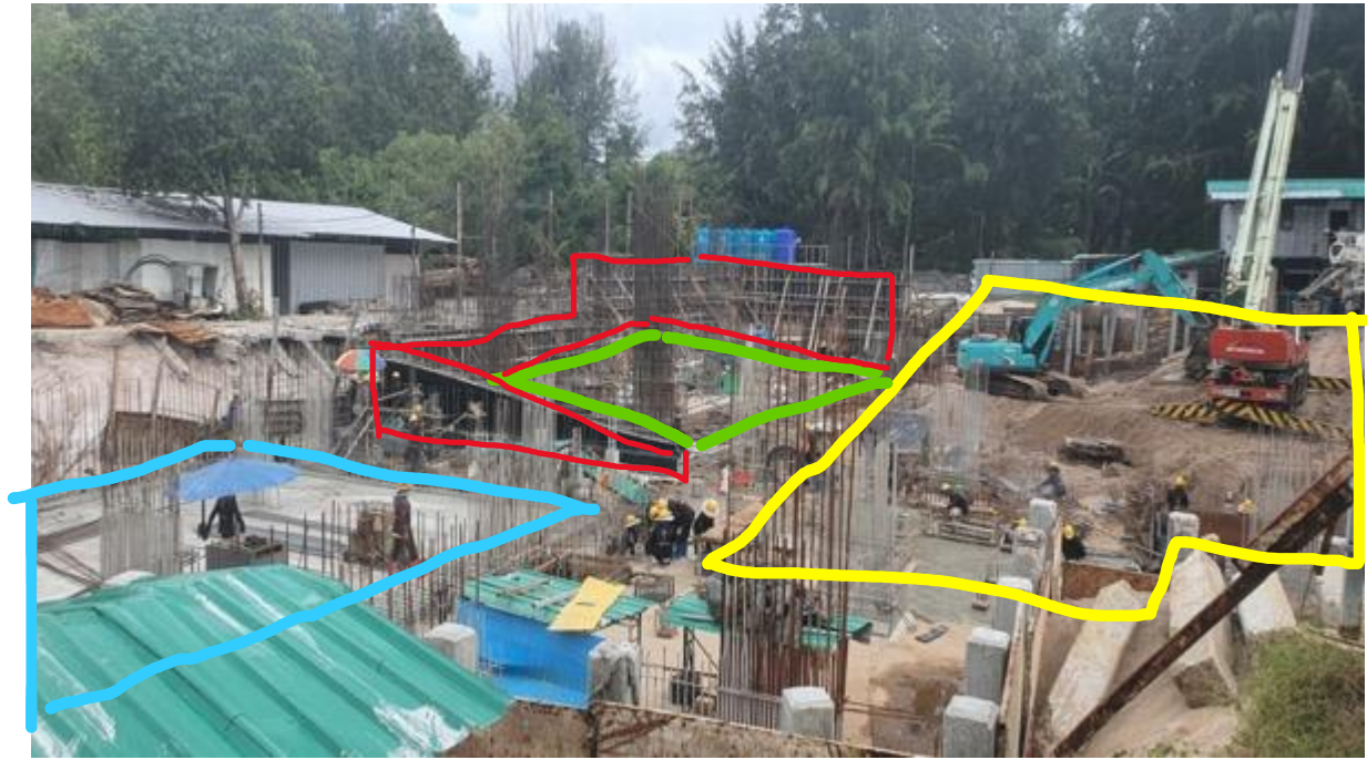
Building 7 & 8 Red areas Retaining walls at rear of prep kitchen /canteen. Green Areas Slab of Building 7 & 8. Yellow front area of building 7&8 slab area being prepped ready for slab formwork. Blue is slab building 6