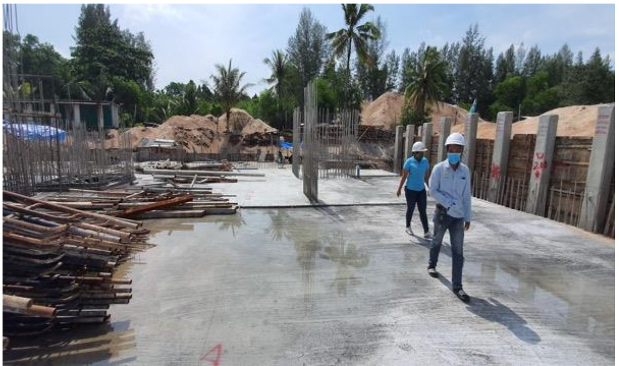
Slab in car park and Housekeeping area