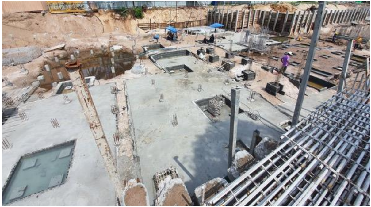
Lien in prep Kitchen area