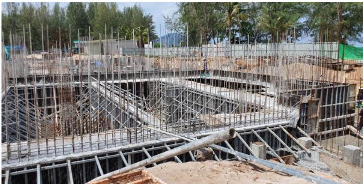
Walls poured for raw water tanks (3 tanks) formwork beginning to be removed