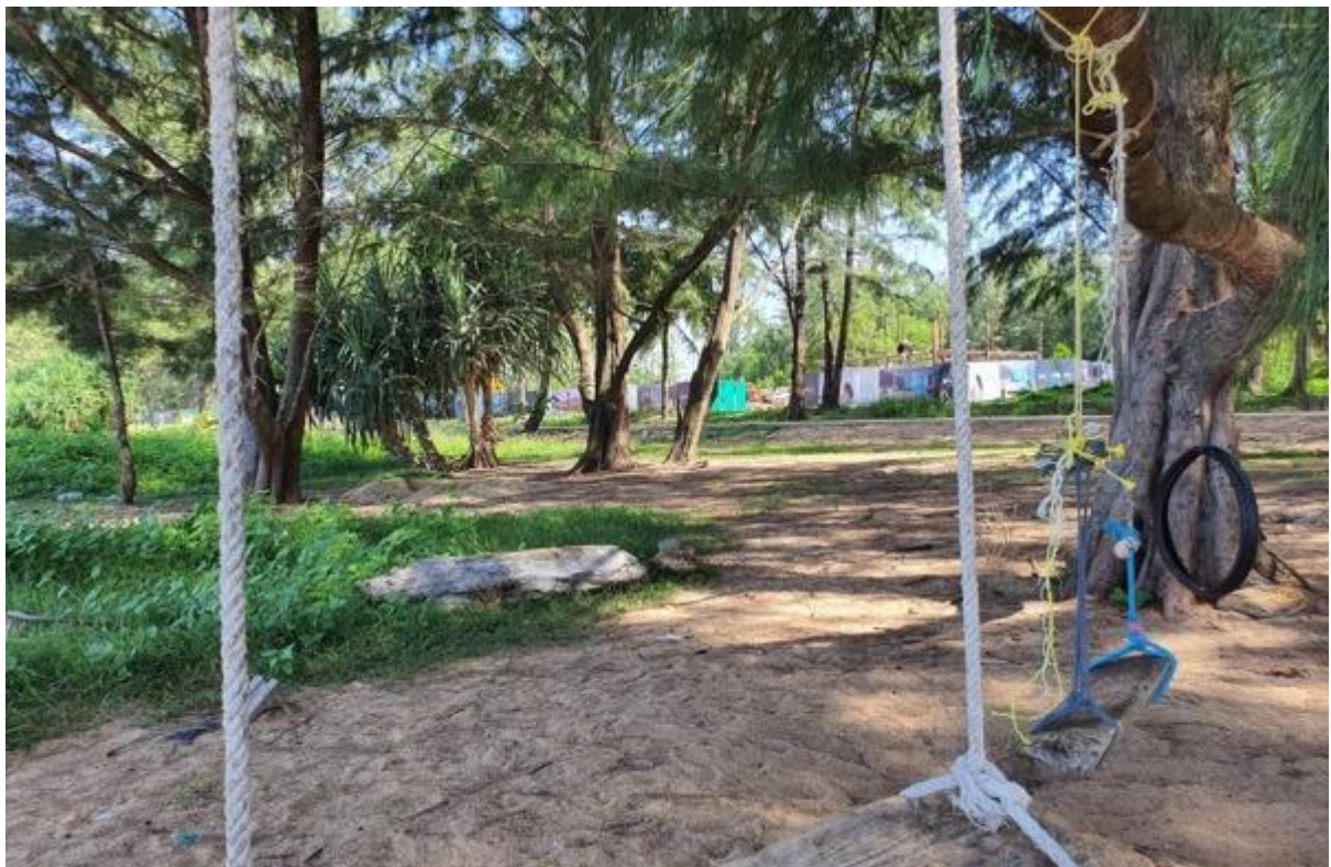
Start of the beach areas opposite the edge of the plot (at building 8 end)

Radisson Phuket Mai Khao Beach Construction Progress Report