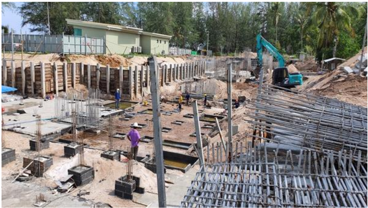
Lien poured in building 7 prep kitchen area, preparing compacting area for lien concrete in generator & Transformer area