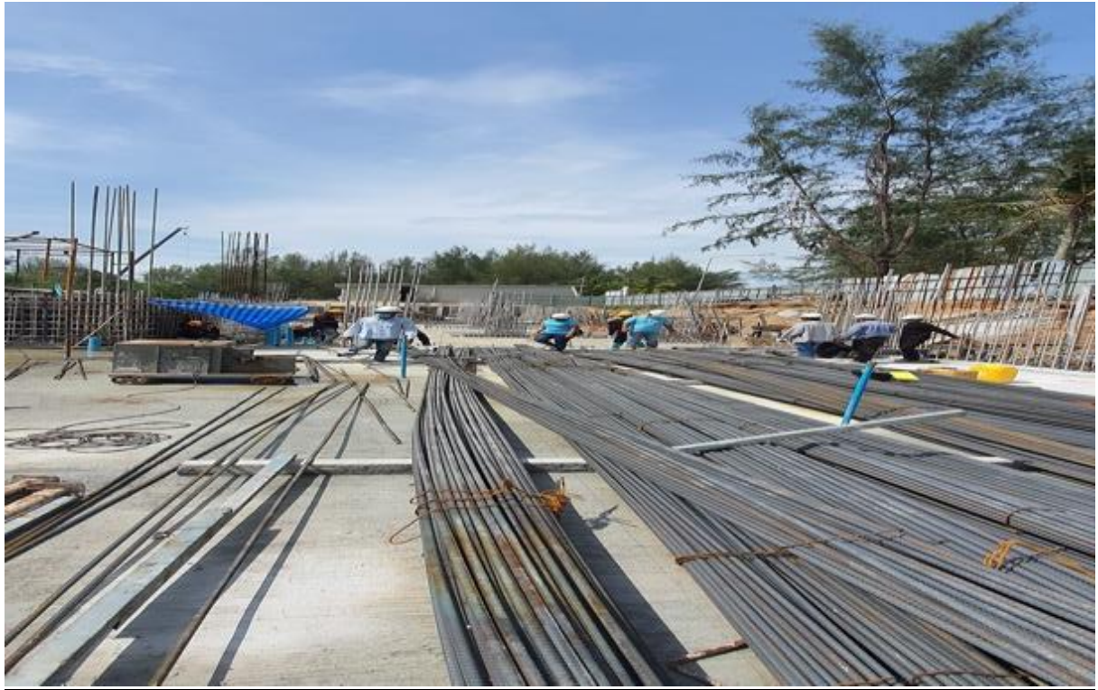
Preparing steel formwork for retaining walls under building 1 & 2 in area of Engineer store, storerooms and finance store