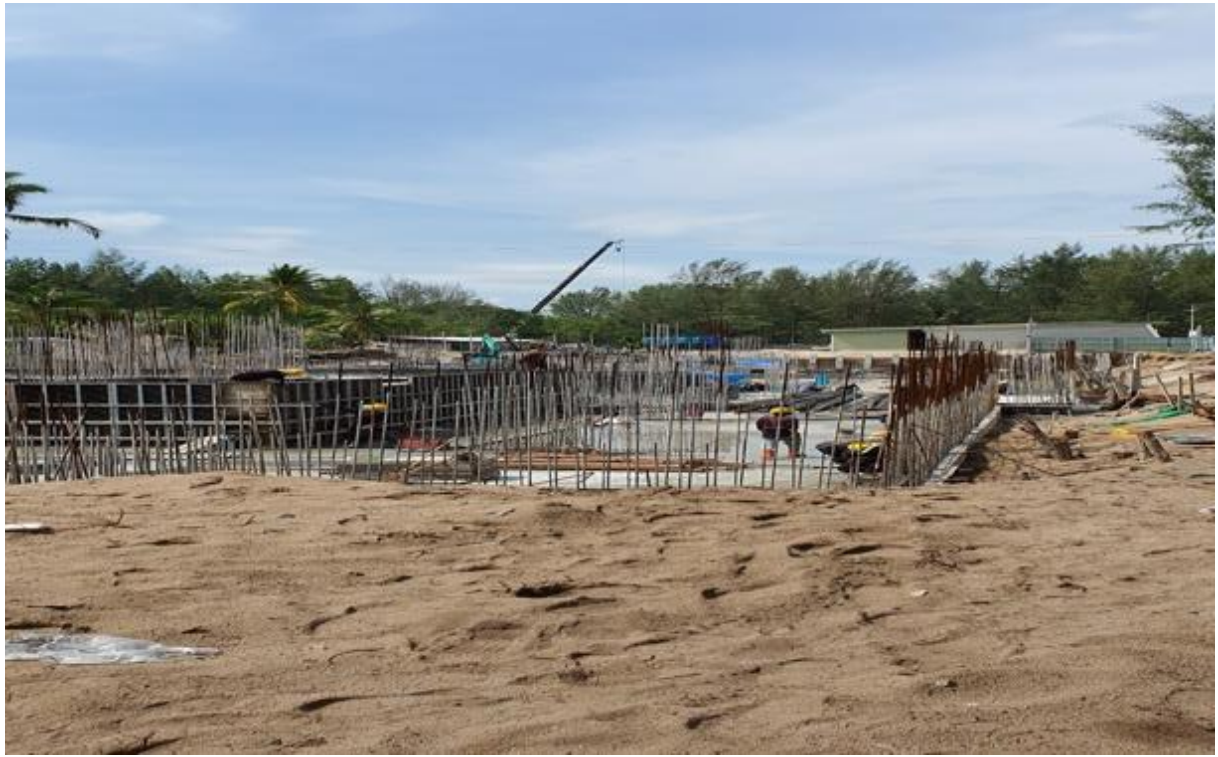
Looking along length of site from corner of 1001 Unit