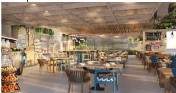
All Day Dining