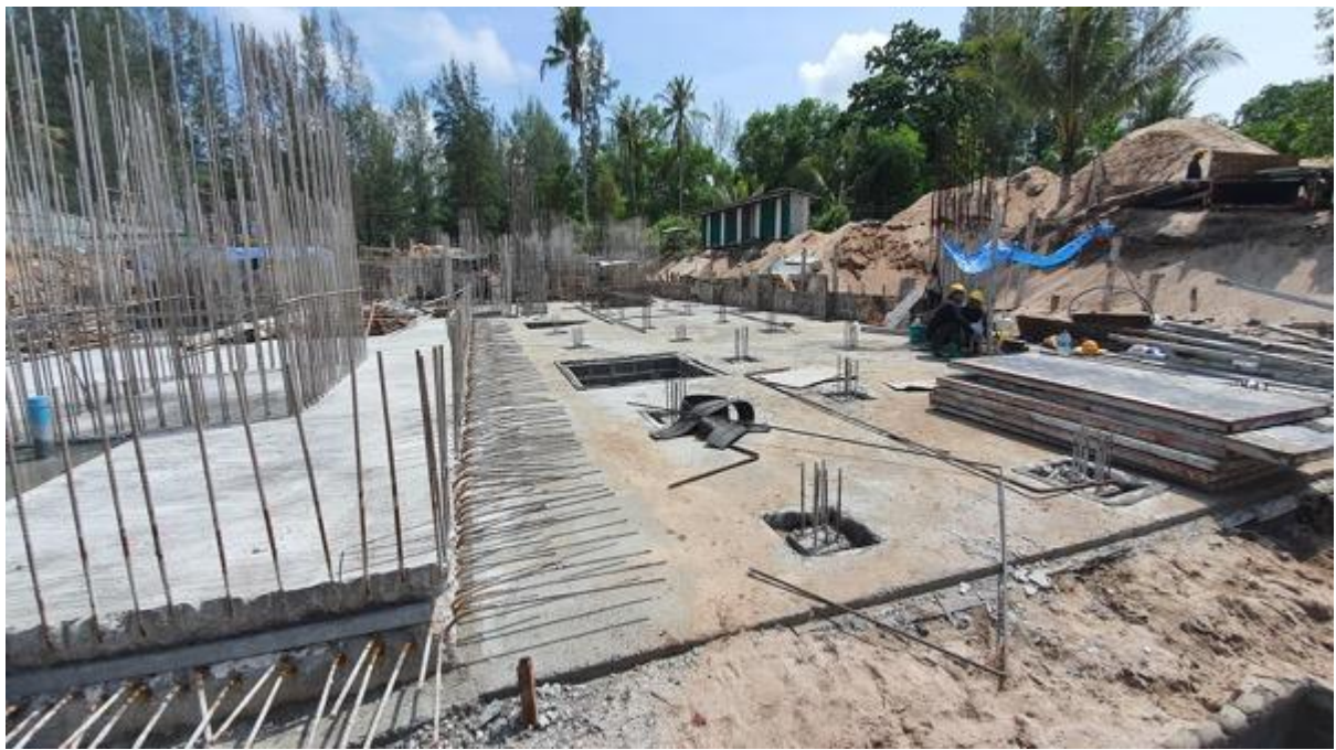
Slab car park area under building 5 and Lien in executive office areas