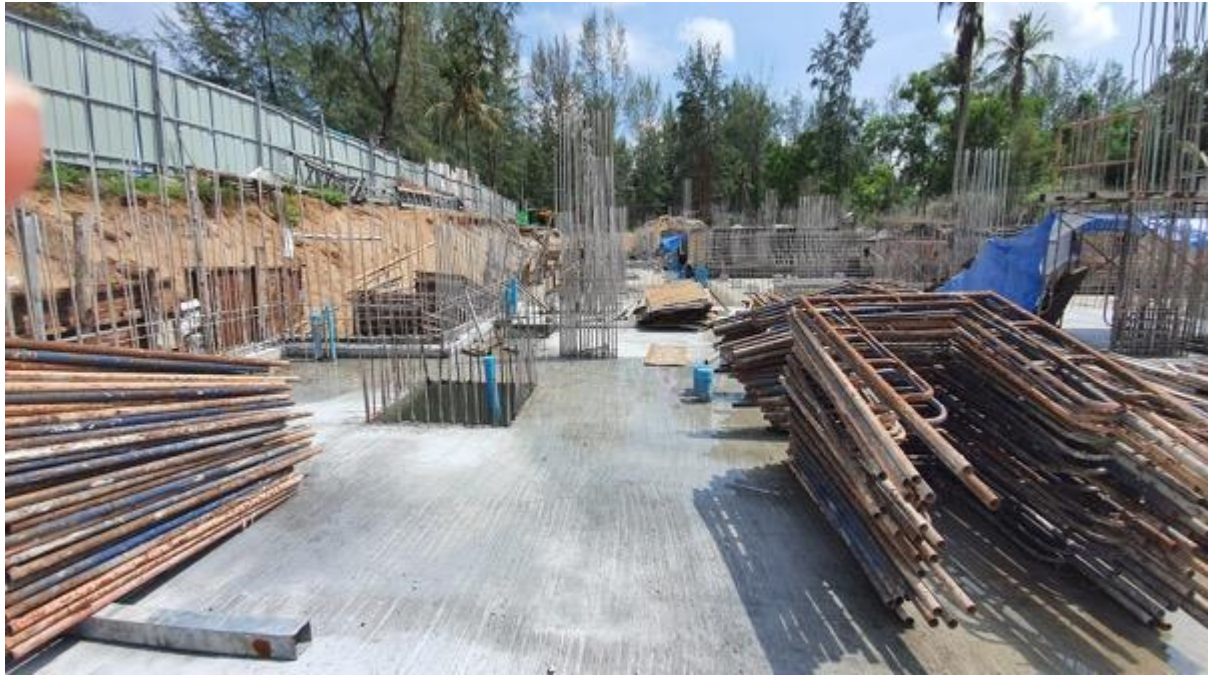
Slab in car park under building 4 and express laundry area