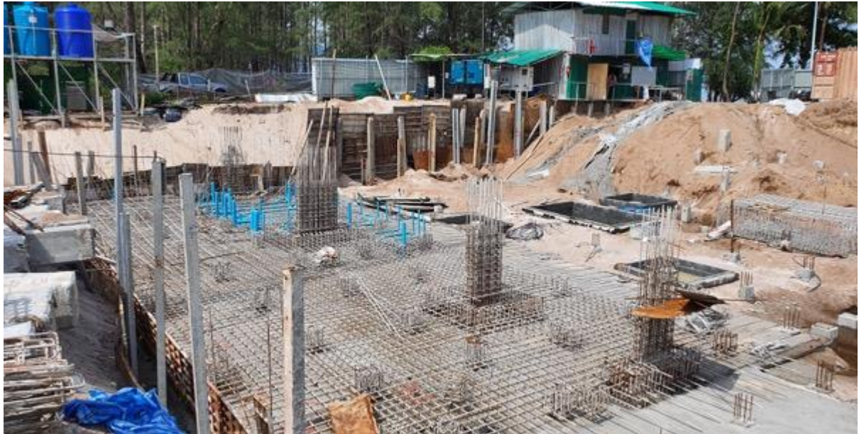
Under building 8 Staff changing areas and staff canteen rebar prepared