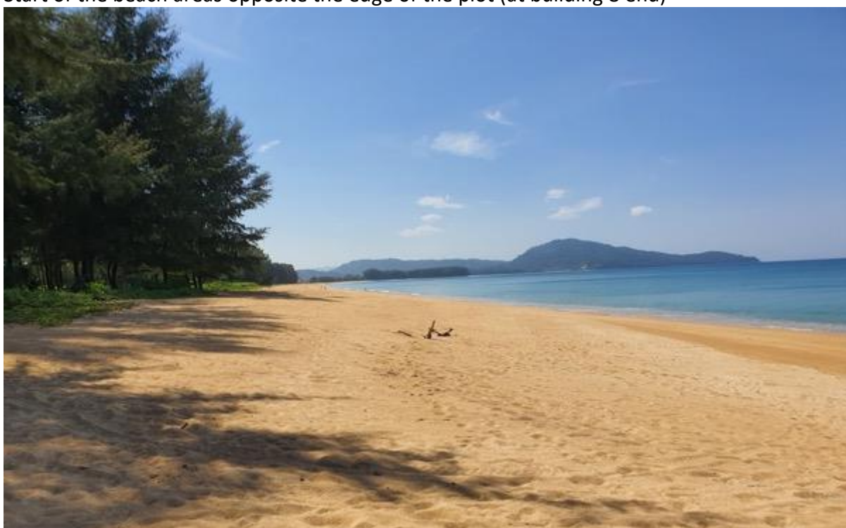
View of the beach, looking to the south

Radisson Phuket Mai Khao Beach Construction Progress Report