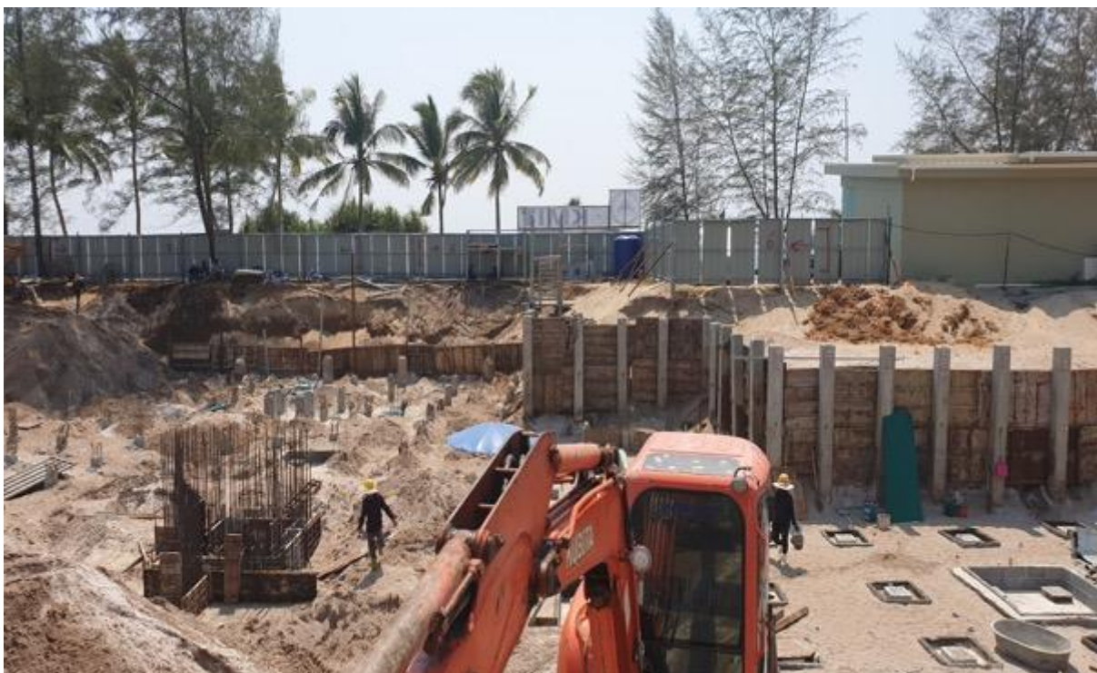
Footings prepared in Building 6 Area