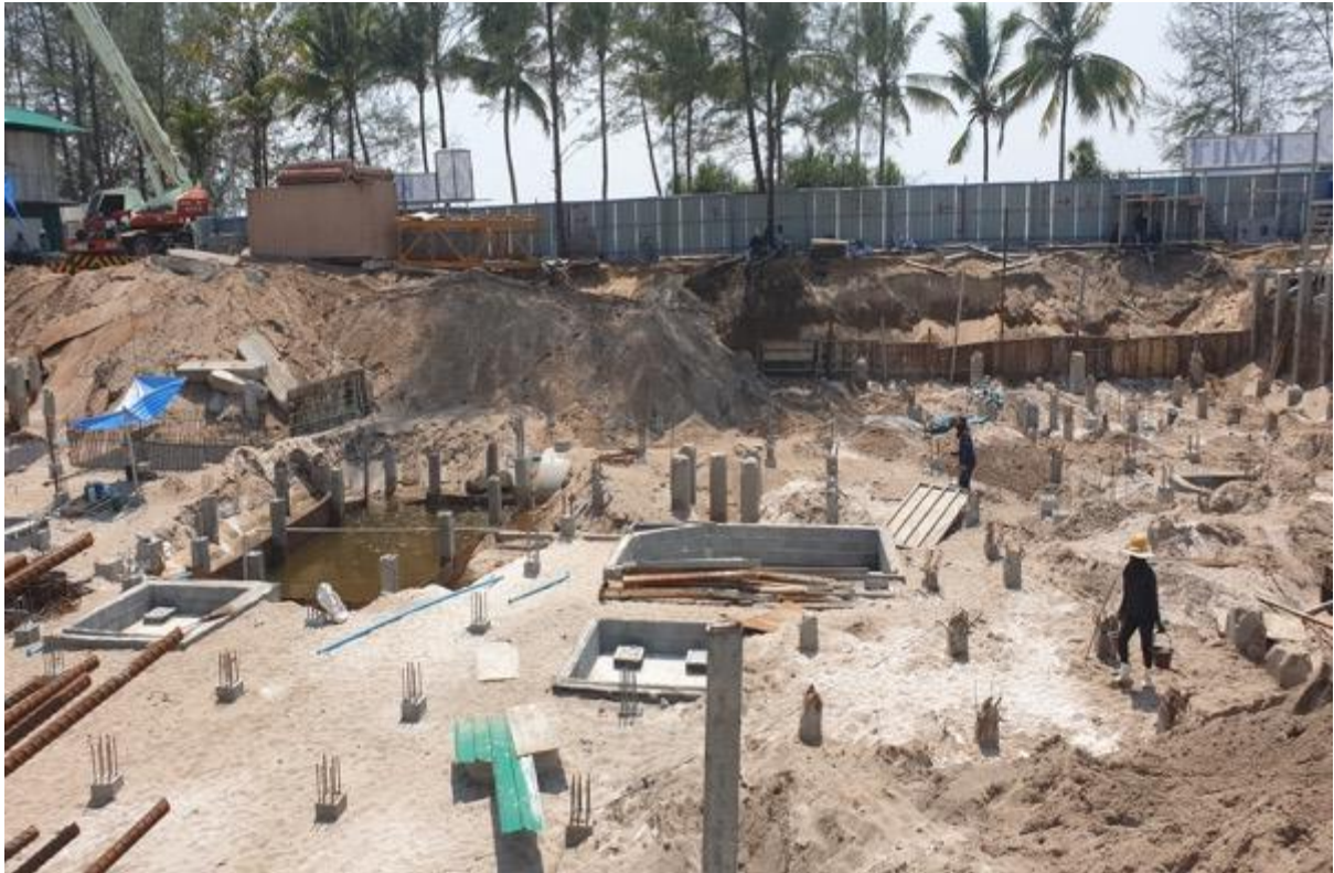
Footings prepared in the Building 7 area at rear right of the shot a grease trap has been installed below the soil level