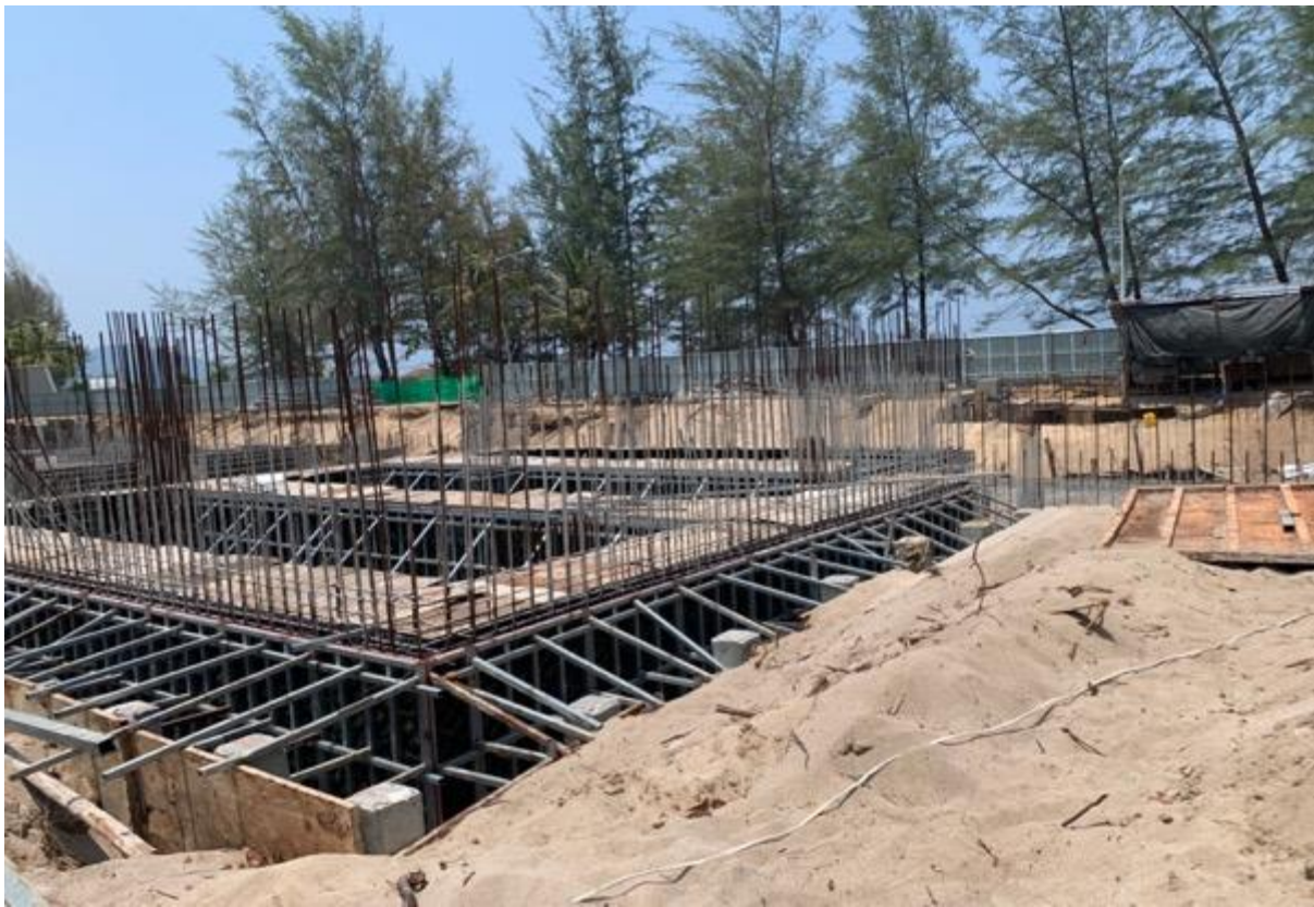
Walls of Raw water tanks under building 1 area, from rear corner of the building facing toward the sea.