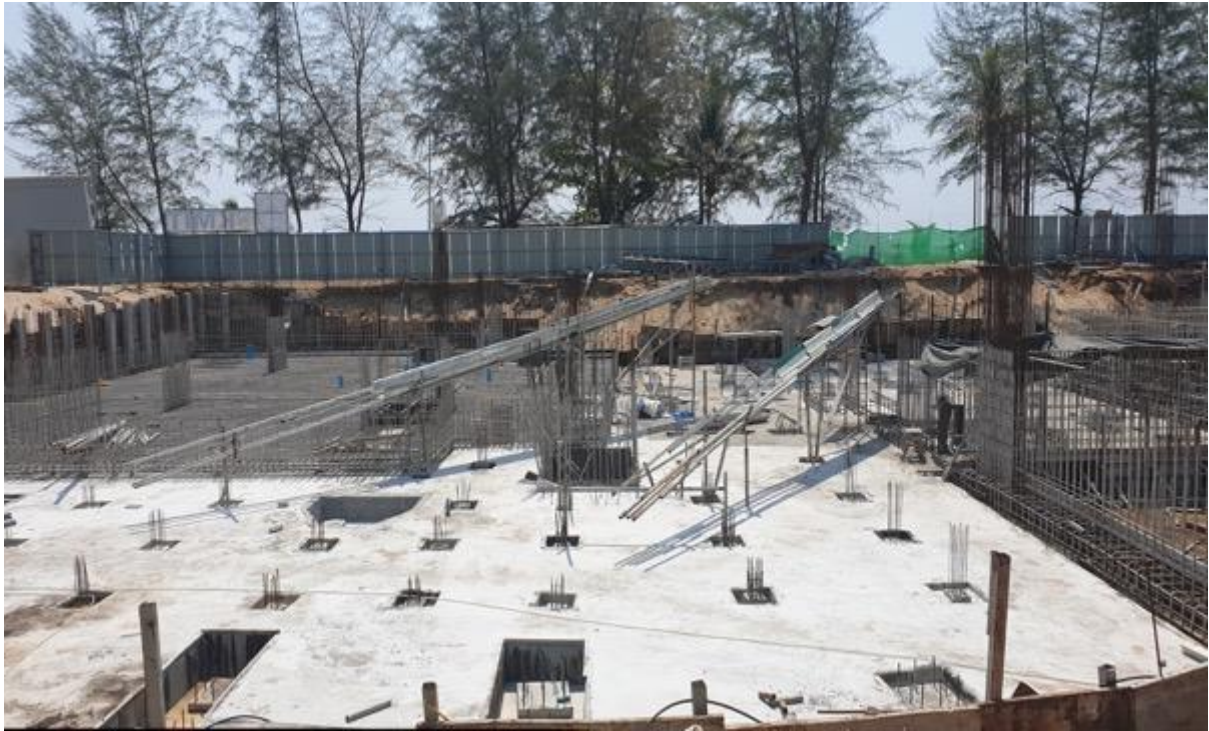
Building 4 Lien of areas around Housekeeping and Linen store in foreground and slab of express laundry area/roadway/car park in background