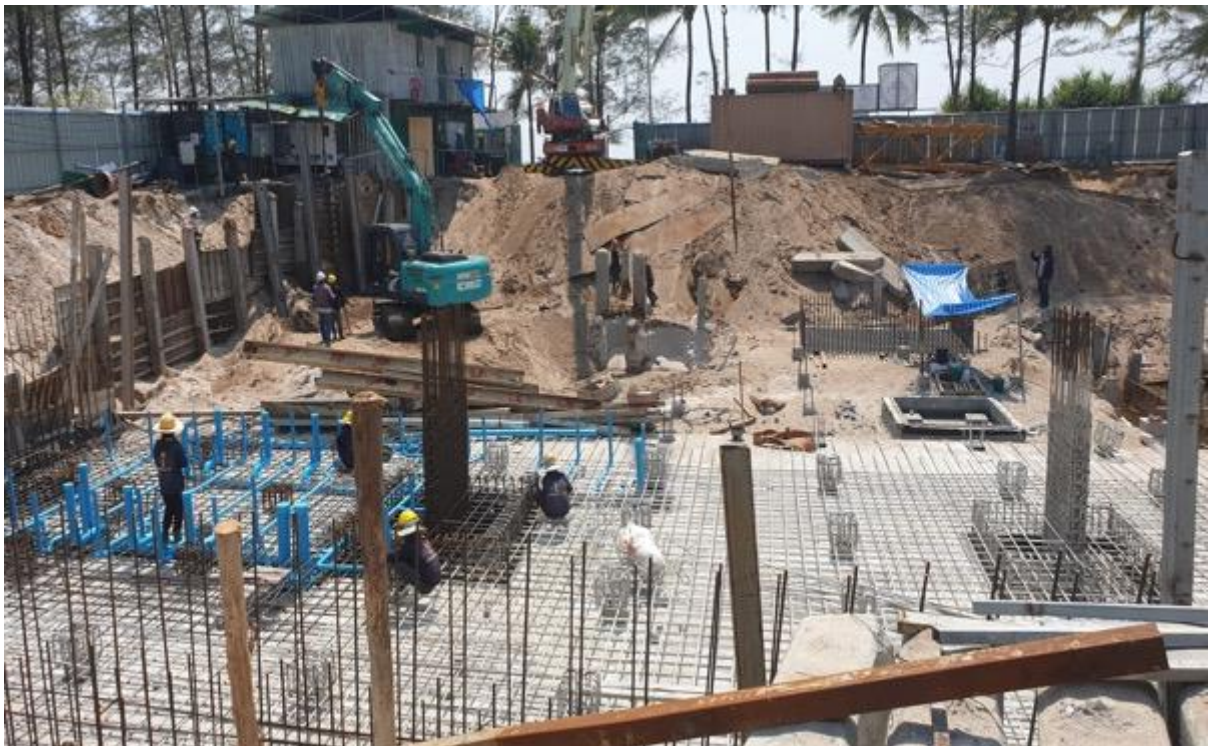
Building 8 Slab steelwork and formwork being prepared and sleeves for the Male changing rooms/toilets/showers being installed