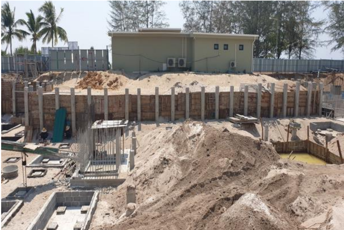
Building 5 – ongoing excavations – preparing footings – note the area around Sales gallery that will be piled later