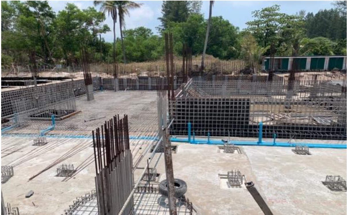
Pump room in centre rear of shot, and formwork of the walls of clean water tanks at centre right of shot- foreground is lien for corridor and storerooms/engineering areas