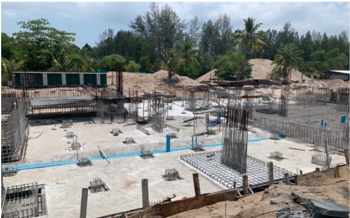
Building 3Lien work in foreground to area near finance store and clean water tanks to the rear left of shot