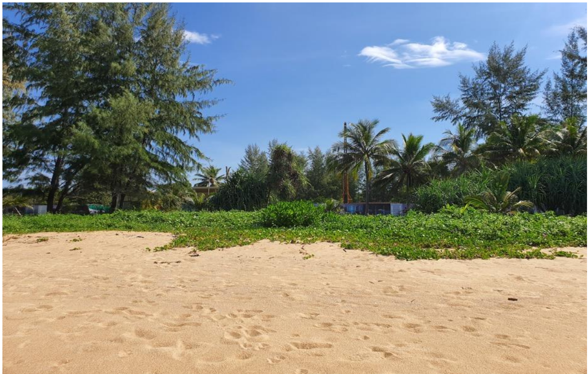
From the beach looking East, back to the project

Radisson Phuket Mai Khao Beach Construction Progress Report