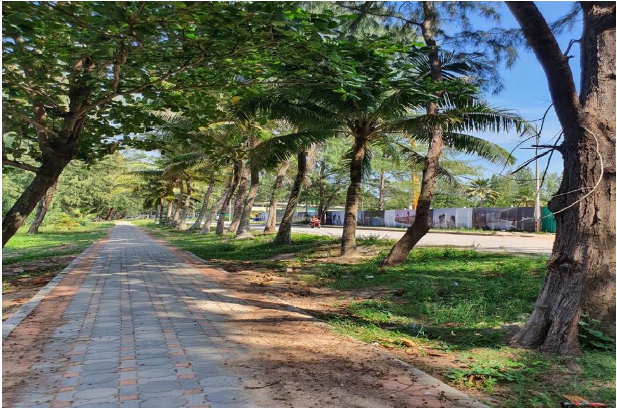
Directly in front of the plot, road and cycle/pathway and to the right onto the beach