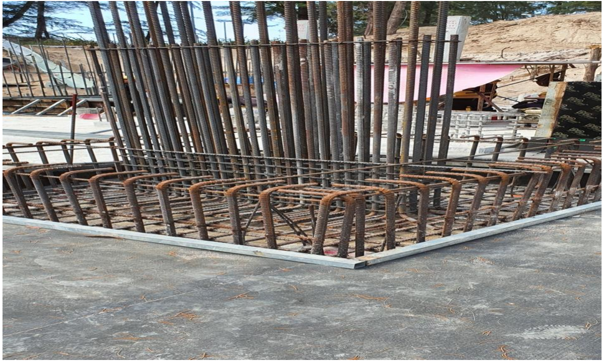
Footings being prepared ready for structural concrete in Building 2 – these are in the area of the water tanks