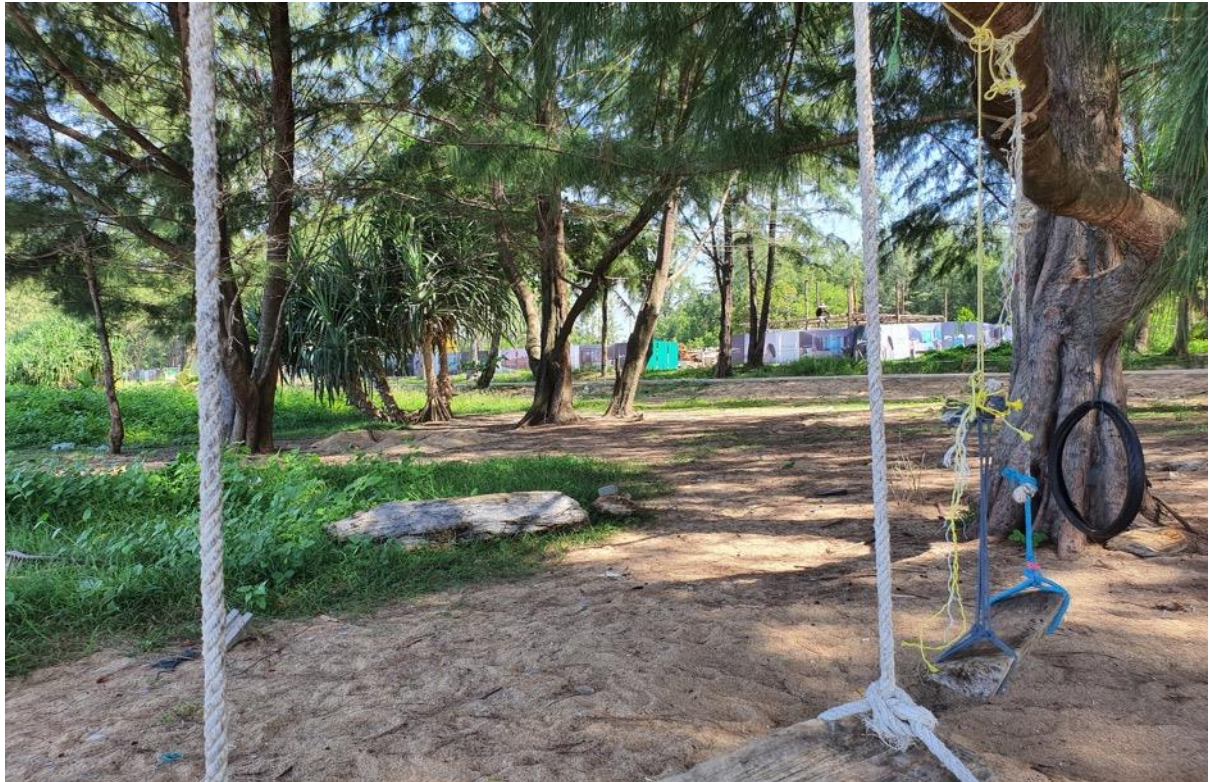
Start of the beach areas opposite the edge of the plot (at building 8 end)