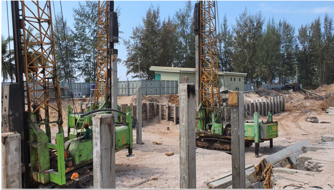
Piling in Building 7& 8 footprint