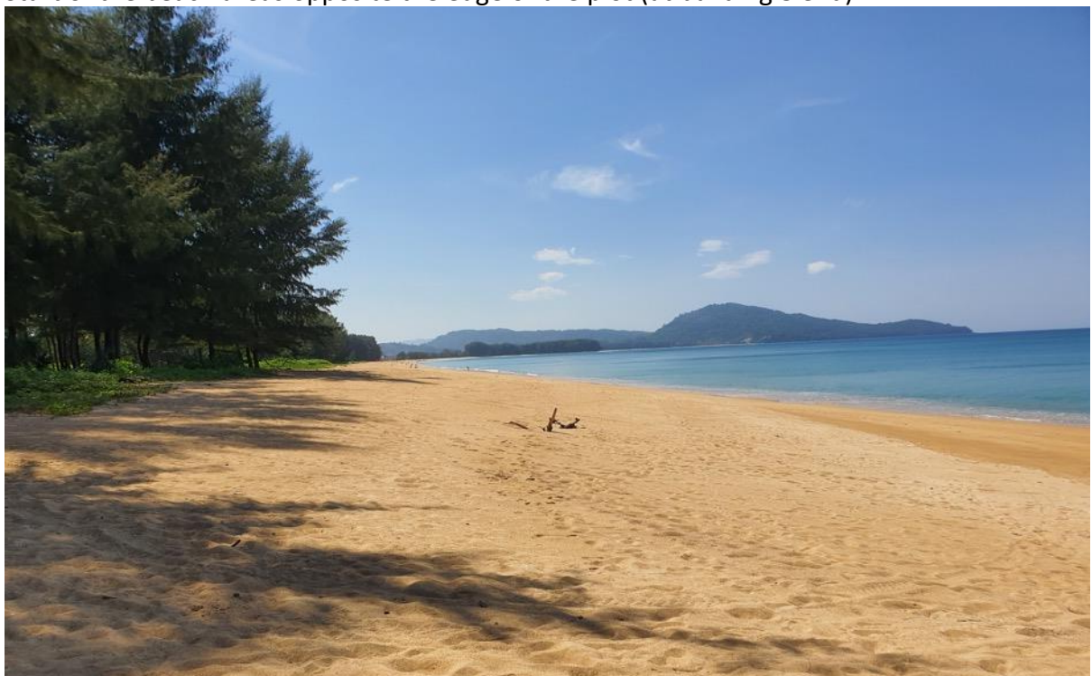
View of the beach, looking to the south