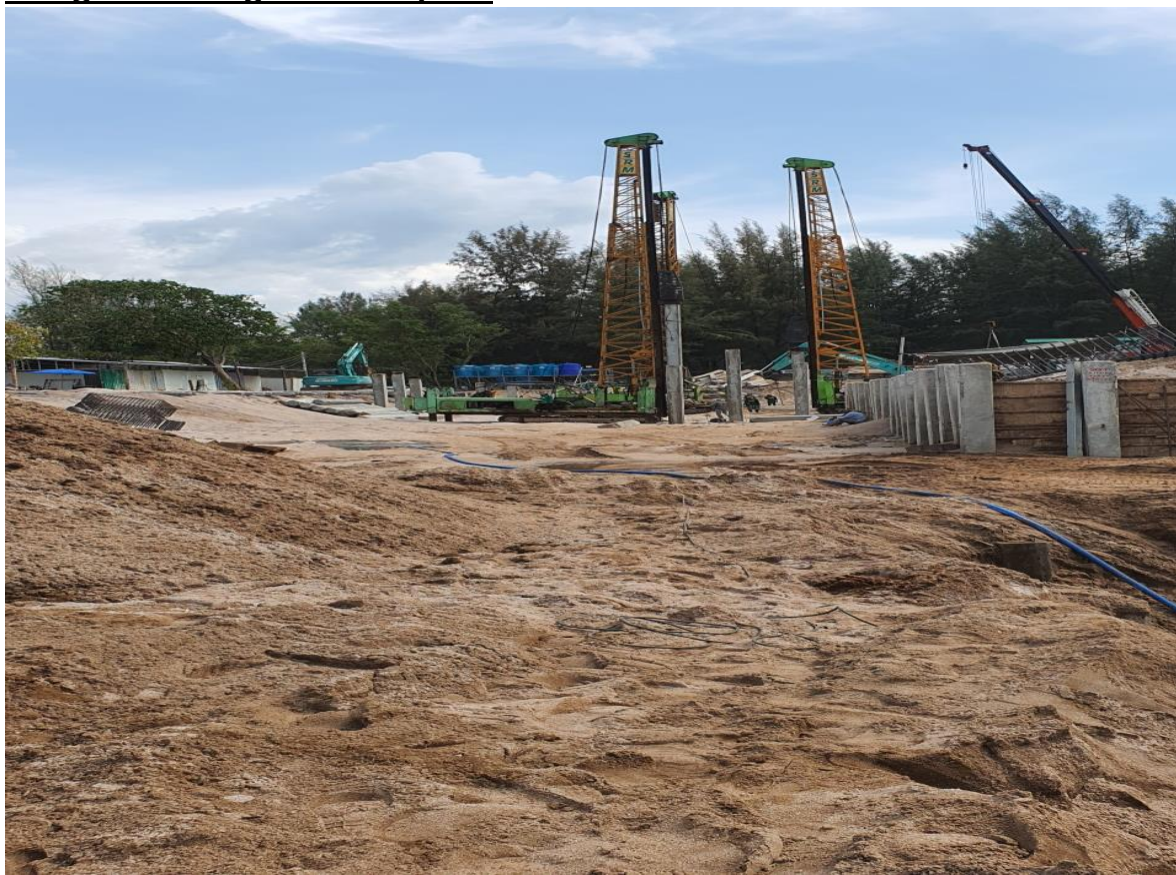
Piling work at 7& 8, looking back across 5,6 (pile heads are already cut off in 5&6 area)