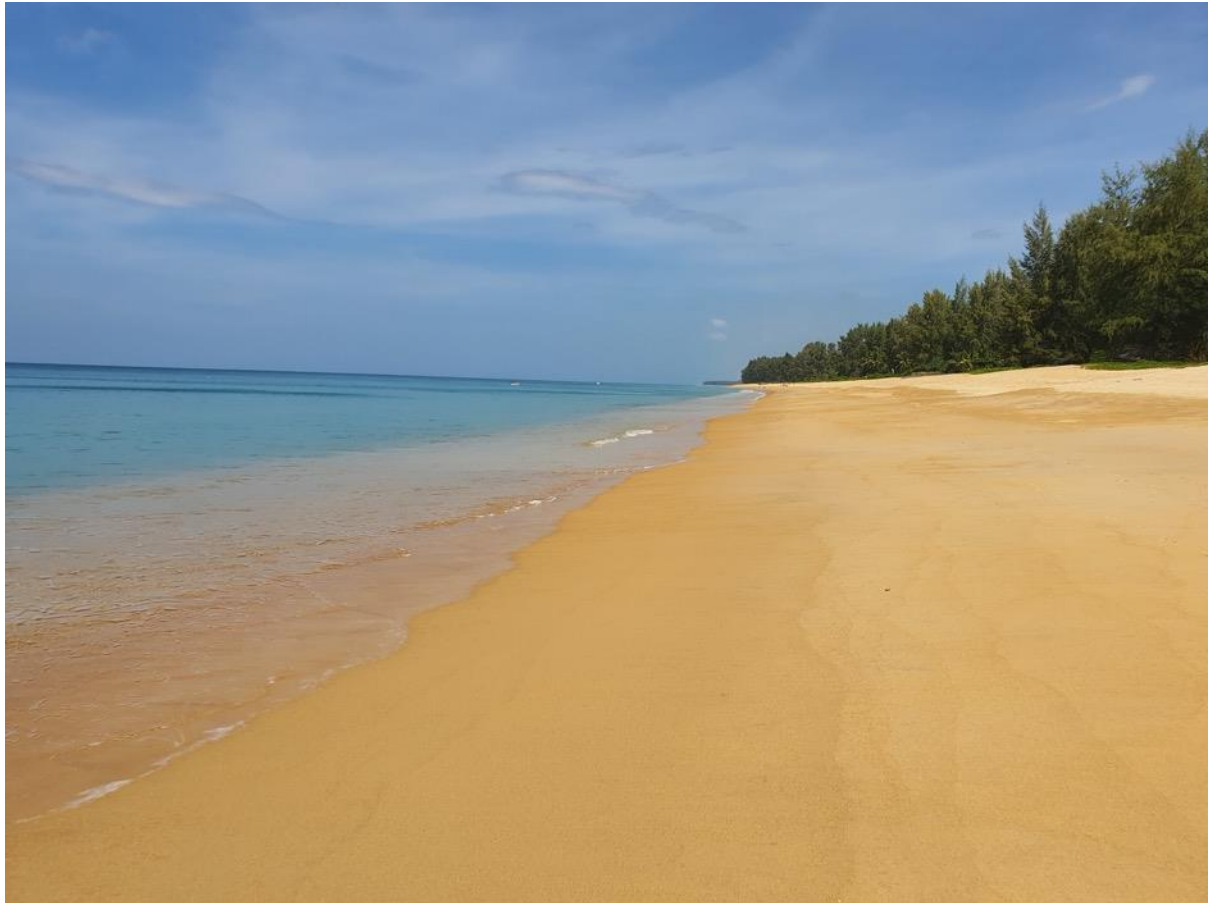
Beach looking to the north