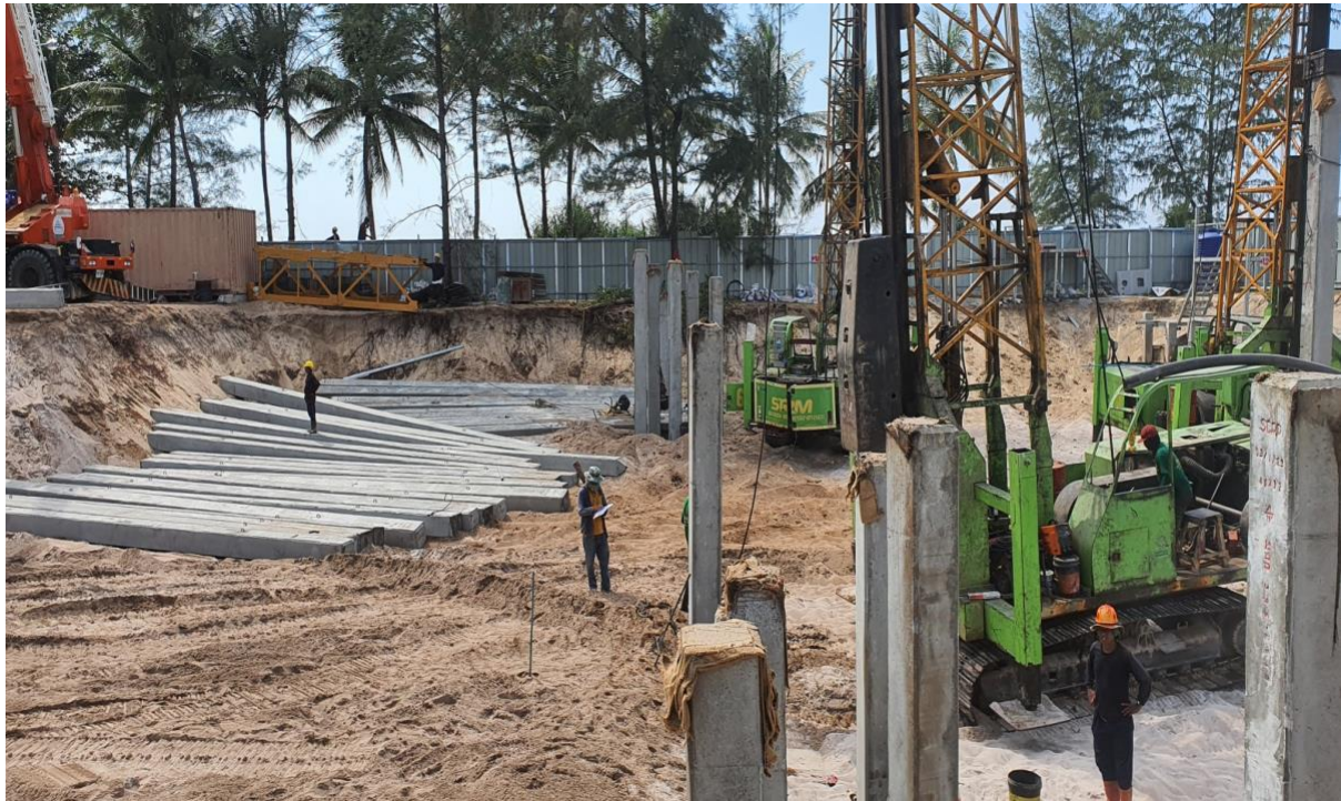
Piling works at Building 7 & 8 Area