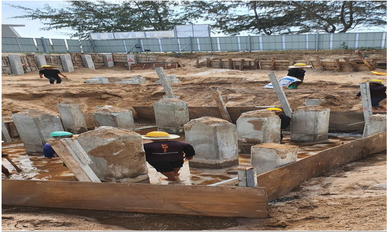
Preparing Liens at top of piles in Building 4 after the lien concrete base the footings will be attached to these pile heads by rebar & structural concrete pour